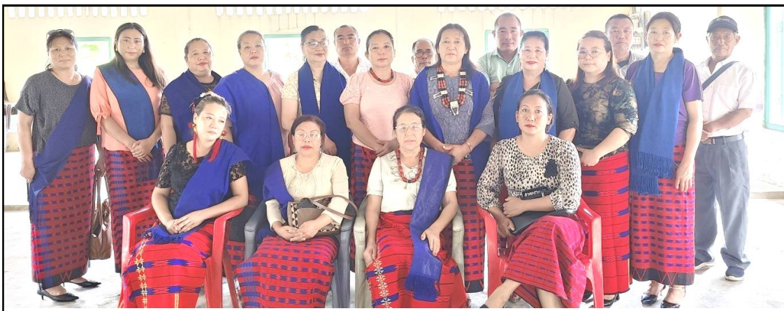
Tuli Town Council nung tokteptsü asoshi Aitlenden Ward, Patizüing Ward aser Tulikong Ward nungi candidate-tem aser Watsü Mungdang lenirtem külemi tangokba noksa ka yangi angur.

Mokokchung, June/Aami 04 (TYO): Tuli Town nung Town Council election agitsü aliba nung Aitlenden Ward, Patizüing Ward aser Tulikong Ward ya Women Reservation kübok aita lir.