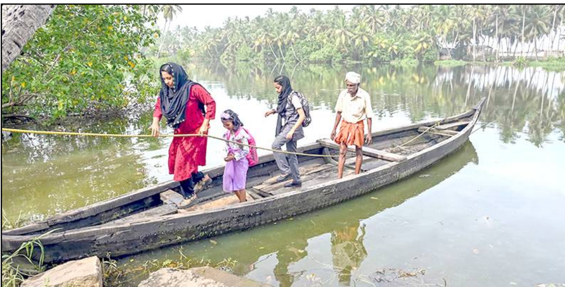
Thiruvananthapuram kübok Panathura asetkong nung tanurtem pei tsürapurtem den school-i rong ka nung mener aoba noksa nung angur.

sendakba nung iba linük nung Israel anemertem tali küma liasü. 1974 küm tesendktep raksaba sülen Israel aser Muslim nungeri amokbanger aliba linük na ya diplomatic tesendaktep mali. Maldives sorkari Israel indang passport bena alirtem linüki maitdaksütsü atema telemetba agiba sülen Israel-i, bendanger passport bena alirtem densema lisopurtem dang Maldives-i maotsü ajungshiba den Maldives nung alirtem danga iba linük toktsür aotsü tetuyuba agütsüogo. Israeli Foreign Ministry-i iba tetuyuba ya Deobarnü agüja liasü.