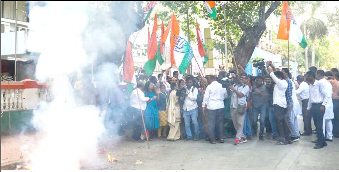
Mongolbarnü vote azüngba mapang Mumbai Congress pusemertem party tejakdang aliba osang angazüka pelatepba noksa nung angur.