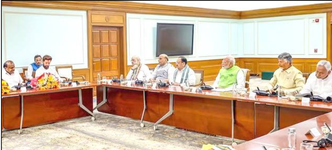
June 06, 2024 nü New Delhi nung NDA teloktep senden nung Ato kilonser Narendra Modi, BJP Tir J P Nadda, TDP Tir N Chandrababu Naidu, JD(U) Tir Nitish Kumar aser tangartem tangokba noksa nung angur.

New Delhi, June 06 (Agencies): Bodhbarnü Ato kilonser Narendra Modi-i NDA teloktep nung aliba party tem nungi lenirtem den senden amenba sülen anogo ka lir osang ka ajanga, JD(U)-i Railways, Finance aser Agriculture Ministries akhanger, ta metetdaksü.