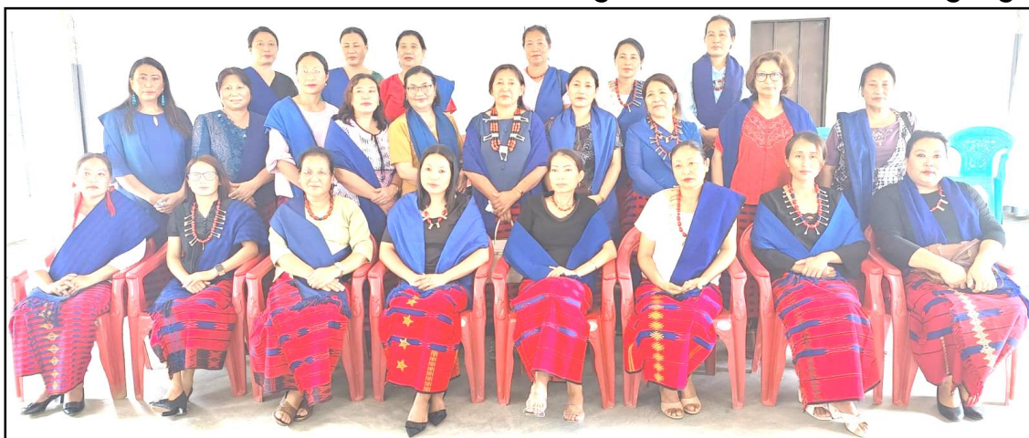
Changtongya nung Watsü Mungdang, Watsü telen Changtongya aser Changtongya Town Council nung Ward Pezü Women Reservation lemsükja aliba nungi Canditate-tem ajurutepa shisa lemsatapba sentong agir kelen tangokba noksa.

Mokokchung, June/Aami 06(TYO): Tanu Watsü Mungdangi ayongzükba Lungwa Watsü Süngki, Changtongya nung Watsü Mungdang, Watsü telen Changtongya aser Changtongya Town Council nung Ward Pezü Women Reservation lemsükja aliba nungi Canditate-tem ajurutepa shisa lemsatapba sentong tajung ka agiogo.