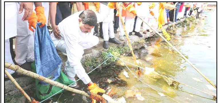
June 06, 2024 nü Bhopal nung 'Jal Ganga Samvardhan campaign' kübok ayong merüktetba sentong nung Madhya Pradesh Chief Minister, Mohan Yadav-i shilem agiba noksa nung angur.

Opposition senden nungji N K Premachandran (RSP), Dipankar Bhattacharya (CPI-ML), Priyanka Gandhi Vadra, AAP nungi Sanjay Singh aser Raghav Chadha na, T R Baalu (DMK), Supriya Sule (NCP), Shiv Sena nungi Arvind Sawant aser Sanjay Raut na, Sitaram Yechuri (CPM) aser CPI nungi D Raja nungera liasü.