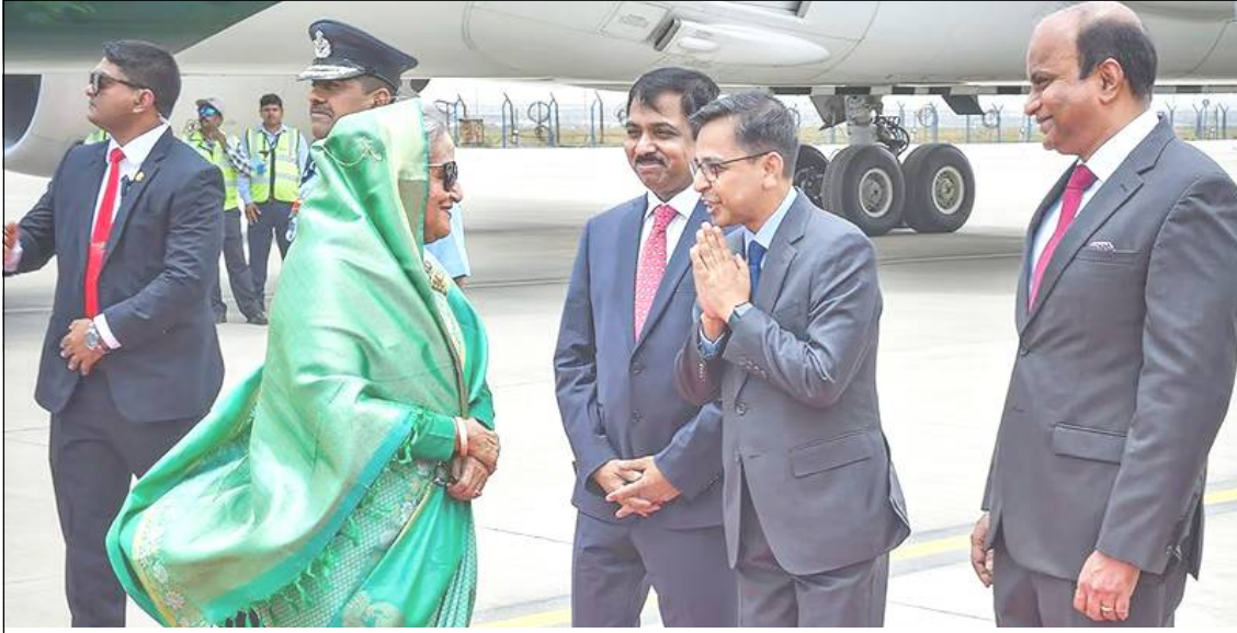
June 08, 2024 nü Bangladesh Ato kilonser, Sheikh Hasina New Delhi tonga arudang tangokba noksa nung angur. Amongnü Narendra Modi Ato kilonser tenangzükba agiba sentong nung adentsü atema Hasina-i Delhi semdanger.