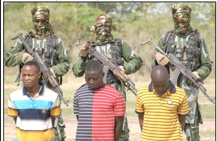
Nigeria kübok Borno state nung Islamic State West Africa Province (ISWAP) kiralongrartemi Khristan asem khasettsü lia tangokba noksa nung angur.

June 08, 2024: Nigeria kübok Borno state nung Islamic State West Africa Province (ISWAP) kiralongrar teloki Khristan asem khasetba noksa kar social media ajanga prokshio, ta International Christian Concern (ICC)-i metetdaksü. June 4, 2024 nü Islamic State group (ISIS)-i lemsatepba noksa nungji Khristan asem temokok agi ali nung nendaker lir aser parnok sülen prangpong amer kiralongrar asem lir. Ano tanga noksa ka nung Khristantemji ali nung laoer lir aser kiralongrartem indang machine gun prangpong nungi injang khadokba mokozü adoka lir. Osang angazükba agi, kiralongrartem jagi June 3 nü Khristan asemji gari ka nungi pua liasü. Gari nung mena alir Muslim nungertembo aotsü