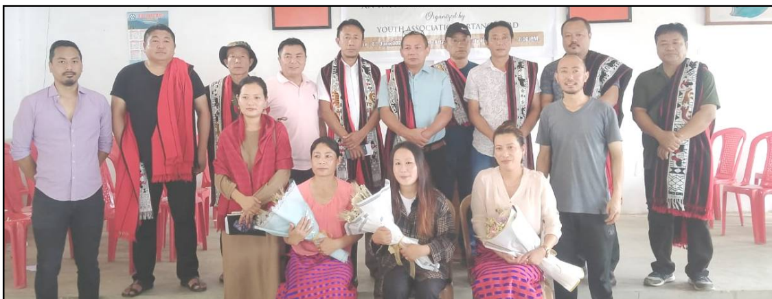
Artang Ward Mkg. nungi ULB election candidate-tem jaoka sentong ka agir kelen candidate-tem, AAW pur, ward Yimden yimsüsür aser sentong nung shilem agirtem külemi tangokba noksa.

Mokokchung, June/Aami 08(TYO): Tanu Artang Ward, Mokokchung Community Hall nung Youth Association Artang Ward-i(YAAW) ayongzüka Artang Ward nungi Urban Local Bodies(ULB) election nung noktaker candidate-tem jaoka parnok nükjidong aser tebilemba lemsadaksüba sentong ka agiogo.