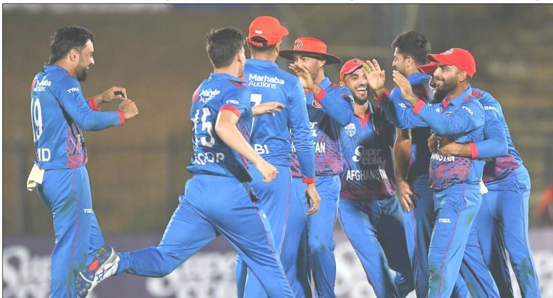
Tang US aser West Indies nung asaya aliba T20 World Cup nung Afghanistan-i run 84 agi New Zealand koker pelaba noksa angur.