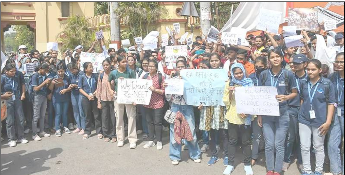
June 08, 2024 nü Varanasi (Uttar Pradesh) nung Kashi Hindu University kima kaketshirtemi NEET-UG 2024 results tanaben reprangshitsü atema takhangba agüja longkak aitdang tangokba noksa nung angur.

Tawa election agiba sülen Lok Sabha nung second-largest party ji Congress lir.