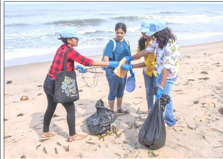
June 08, 2024 nü Kochi nung aliba Puthuvype Beach nung 'World Oceans Day' anogomong nüngtem nung School of Marine Sciences (Cochin University of Science and Technology) aser Ocean Society of India nati senteper tzüyinküm merükdang tangokba noksa nung angur.

Amongnü nikongdang Rashtrapati Bhavan nung linük Tiri ketdangsüa Modi aser council of minister tem nem tenangzükba agidaksütsü.