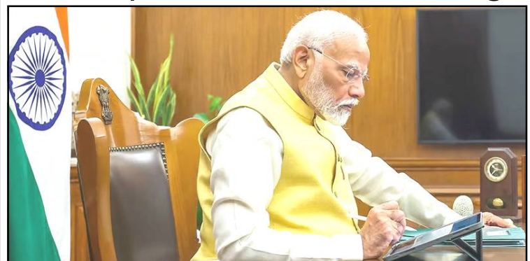
June 10, 2024 nü New Delhi nung Ato kilonser, Narendra Modi-i office mapa tenzükba mapang tangokba noksa nung angur. Modi-i kümsük tasembenbuba Ato kilonser inyaksü atema Amongnü tenangzükba agia liasü.

New Delhi, Aami/June 10 (Agencies): Amongnü nikongdang Narendra Modi-i kümsük tasembenbuba Ato kilonser inyaksü asoshi tenangzükba agiba sülen anogo ka lir Hombarnü pai council of ministers 71 nem portfolios lemzüksüogo.