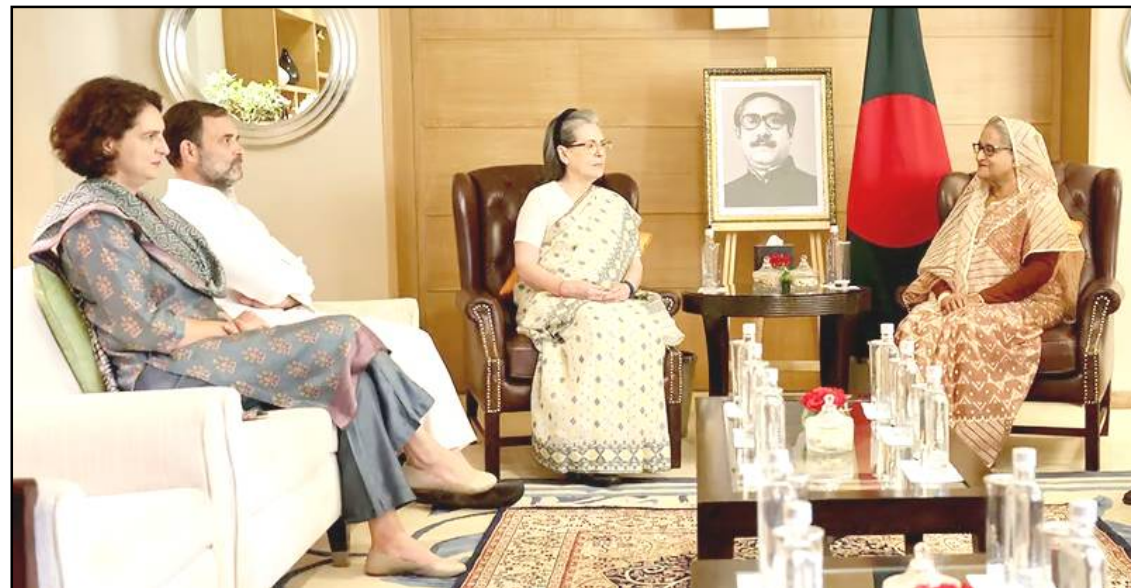
June 10, 2024 nü New Delhi nung Bangladesh Ato kilonser Sheikh Hasina-i Congress lenirtem-Sonia Gandhi, Rahul Gandhi aser Priyanka Gandhi Vadra nunger ajurua senden amandang tangokba noksa nung angur.

PMAY kübok tang tashi nung temsüa aliba sensaker kibongtem atema ki crore 4.21 sütsüogo. PMAY kübok sütsüba ki ajak nungji tanga scheme balala kübok metsümeshidak, LPG connection, electricity connection aser tzü connection lir.