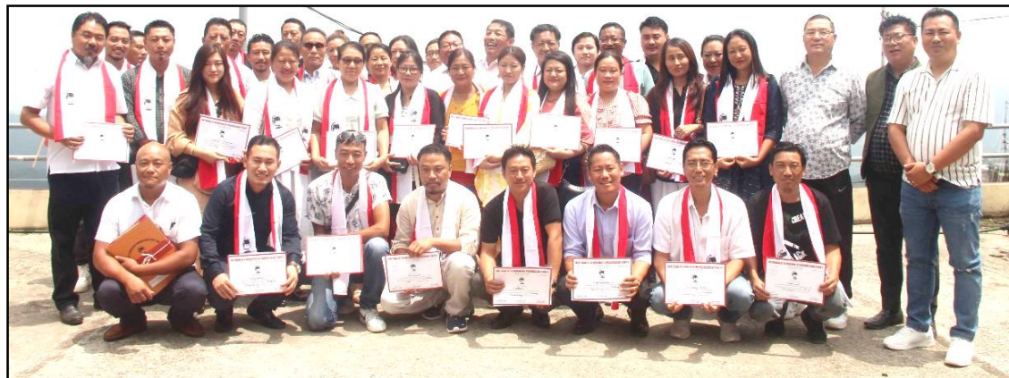
Mokokchung nung Urban Local Bodies election nung tokteper candidate-tem nem NDPP Party Ticket agütsüba sentong nung party lenirtem aser Candidate-tem külemi tangokba noksa yangi angur. (Mokokchung, June 10, 2024)