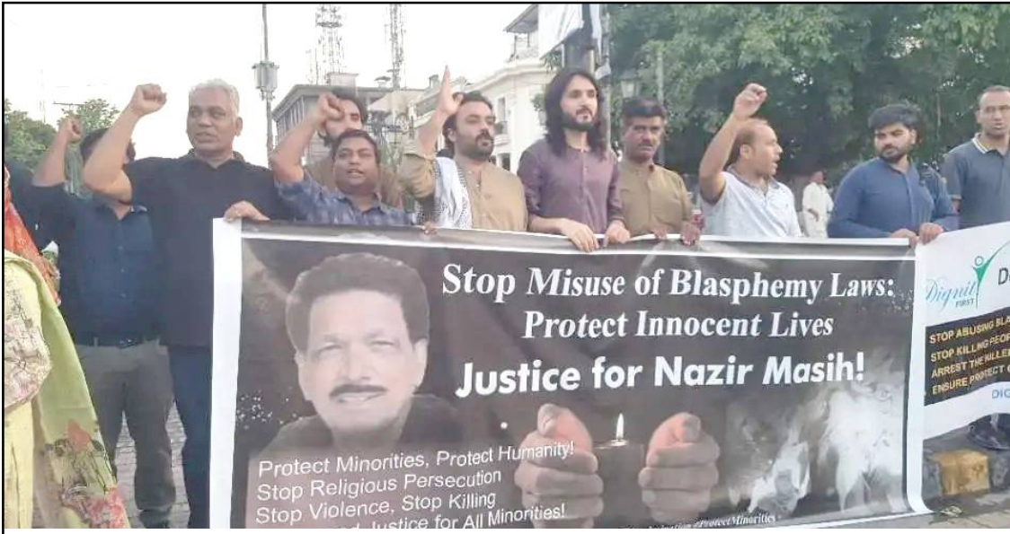
June 08, 2024 nü Lahore nung Khristantemi Pakistan nung Tsüngrem mezüngmeshiba ozüng agientsüla, ta takhangba agüja longkak aيتدang tangokba noksa nung angur.

June 10, 2024: Tawa Pakistan nung lokti kati Khristan ka dak azükba sülen hospital nung temongdak mapang asüba anema taoba hopta tatembanglen Pakistan nung Punjab province yimtiba, Lahore nung Khristan 300 shi adenshia linük nung Tsüngrem mezüngmeshiba ozüng agientsüla, ta takhangba agüja longkak ait.