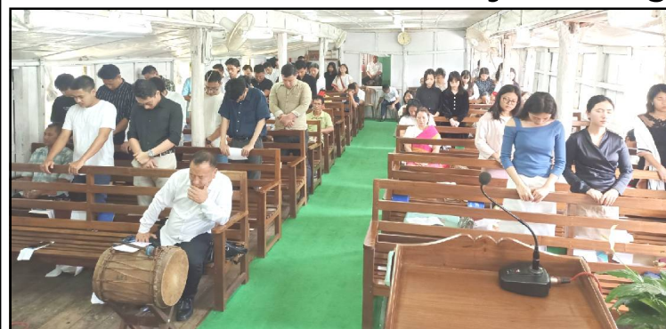
June 09, 2024 nü Kohima Liangmai Baptist Church D. Block youth Department pur 21buba Youth Foundation Day sentong nung Pastor, N. Silubo Zeliang-i lanurtem atema sarasademtsüdang tangokba nokksa nung angur.

Kohima, June 10 (TYO): bulua aliba indang June 09, 2024 nü Kohima metetdaksü.