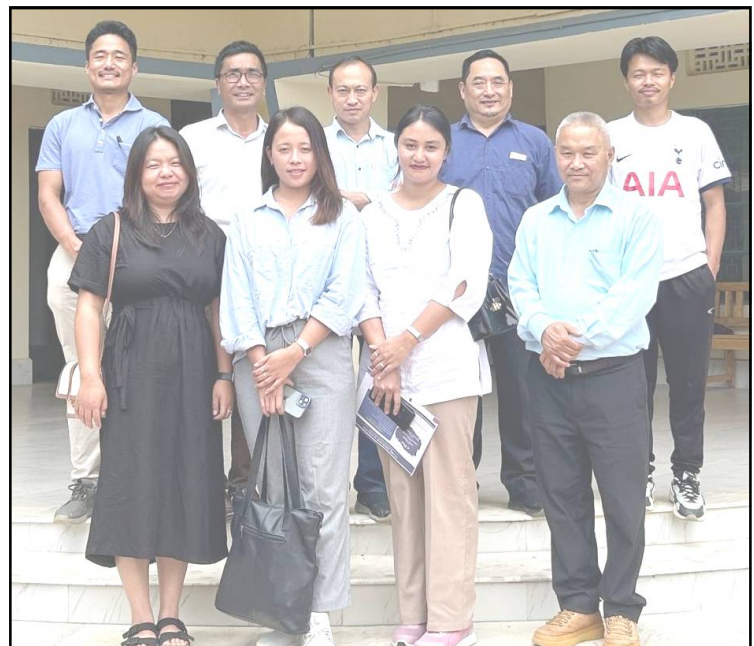
June 11 nü CTC nung Nagaland CCA Forum züngsem CTC Principal aser tesayurtem iba sentong asoshi jelia sentong takok ngua agitsü asoshi tanü senden ka mener kelen tangokba noksa.

Mokokchung, June/Aami 11(TYO): Clark Theological College, Aolijen Mokokchung nung June 19 aser 20 nü Nagaland CCA forum (NCCAF), Kenono Foundation, L E M S A C H E N L O K , Kalpavriksh, North East Network aser Nature Conservancy teloki-i ayongzüka alima nung tzu mupong, arem shiruru, ozü sangnu aser süngdonglidongtem wazüka ayutsü tasa lentong lemsatepa shisa agiba sentong tajung ka omen "Camaraderie towards Safeguarding our Biodiversity." ta asüba nung ajemdaker akatsüba renemdar.