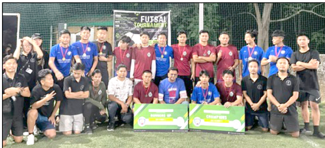
Naga Students Union Dehradun Futsal Tournament 2024 final asayaba sülen Champion End of Era aser Runners Up Manipur FC na tangokba noksa nung angur.

Paisa, Rajya Sabha 264buba Session June 27 nü tenzüktsü aser July 3 nü tembangtsü. June 27 nü Tiri onük jembiba sülen Ato kilonser Narendra Modi-i Parliament nung council of ministers metetpelatsütsü, ta paisa metetdaksü.