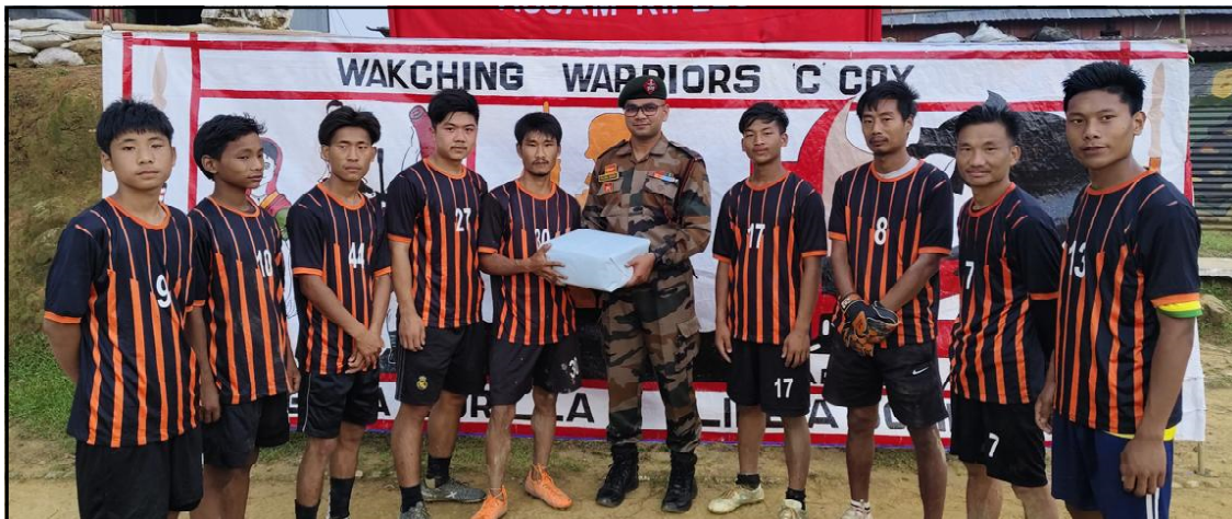
June 13 nü Assam Rifles-i ayongzüka Mon District kübok Wakching nung aliba lanurtem aser Assam Rifles sepaitem football asaya ka asayaogo.

"RB Leipzig nung mezüingbuba küm kanga junga asayaogo aser ni idaki aruba atema pelar," ta pai ashi. "Team, club, yimti, fan ajak kü atema jangrademtsüka lir. Anungji tenangzüktepba atsülangshiba ya jenjang tapet ka agiba ama bilemer," ta Sesko-i ashi.