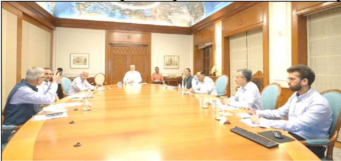
June 13, 2024 nü New Delhi nung Ato kilonser, Narendra Modi leniba nung Jammu & Kashmir nung security tensa asadanga senden amendang tangokba noksa nung angur.

New Delhi, Aami/June 13 (Agencies): Brihostibarnü New Delhi nung Ato kilonser Narendra Modi leniba nung senden ka mena Jammu & Kashmir nung security tensa asadanga sülen pai ketdangsertem dang kiralongrartem sashia mita aotsü tuyuogo.