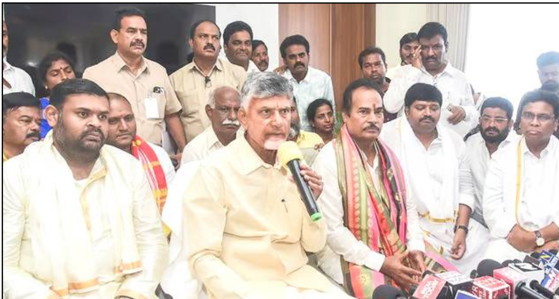
June 13, 2024 nü Tirumala nung Andhra Pradesh Chief Minister, N Chandrababu Naidu-i Venkateswara tekülem ki sendanga sülen osangbenertem den jembidang tangokba noksa nung angur.

Intelligence agency temi, kiralongrartemi Rajouri aser Jammu district na kübok Sunderbani, Nowshera, Domana, Lamberi aser Akhnoor tesemtem amaksüa akok, ta tekümdangtsü osang metetdaksüogo.