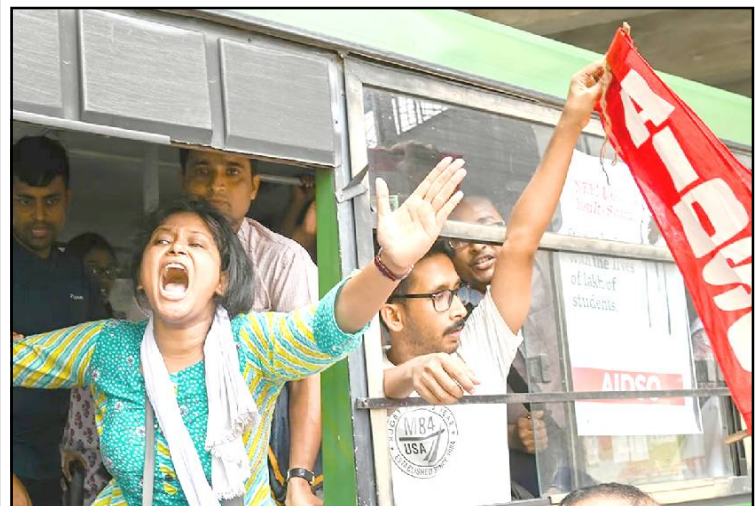
Kolkata, June 13, 2024: NEET-UG entrance exam result-2024 nung ochimashi anema Kolkata nung AIDSO (All India Democratic Students' Organisation) züngsemtemi longkak aita ayimdenba mapang nung tangokba noksa nung angur.

India nung iba Index nung jenjang ano tamajungba akümbaji 'Shisaliok anguba' aser 'Yimtenren tsütsü tashi agütsüba' lenla na nung jenjang tera ajemba agi lir. Ano 'rongsenkettzüng tsütsü shilem agiba' aser 'maongka' lenla na nungbo India nung jenjang ano tera tajungba kümogo, ta report nung shia lir.