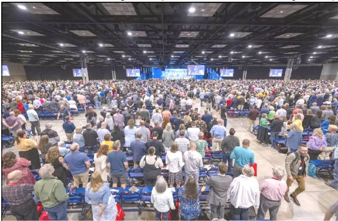
June 11, 2024 nü Indianapolis nung Southern Baptist Convention senden nung adenertem tekülem sentong agidang tangokba noksa nung angur.

Indianapolis, Aami/June 13 (Agencies): Southern Baptists Convention nung tetsür pastor aliba Arogotem nokdangtsü atema Bodhbarnü (June 12) vote agütsütep, ajisüaka magizük.