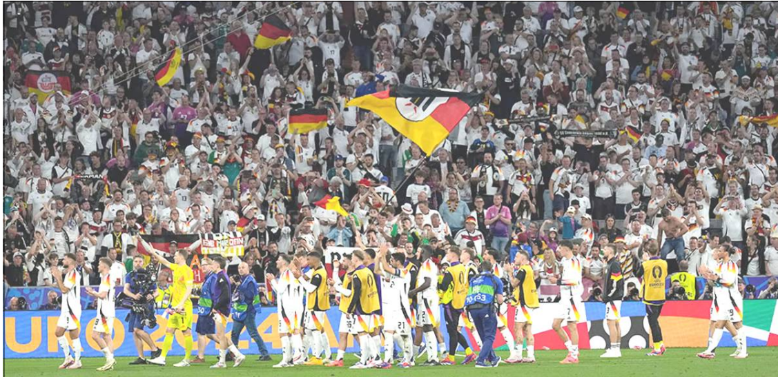
Hokolbarnü Euro 2024 nung Group A nung Scotland goal 5-1 agi akokba sülen Germany nunger asayatem pelatepba noksa nung angur. Iba asaya nung Germany team atema Florian Wirtz, Jamal Musiala, Kai Havertz, Niclas aser Can nungeri goal kaka idakja liasü.