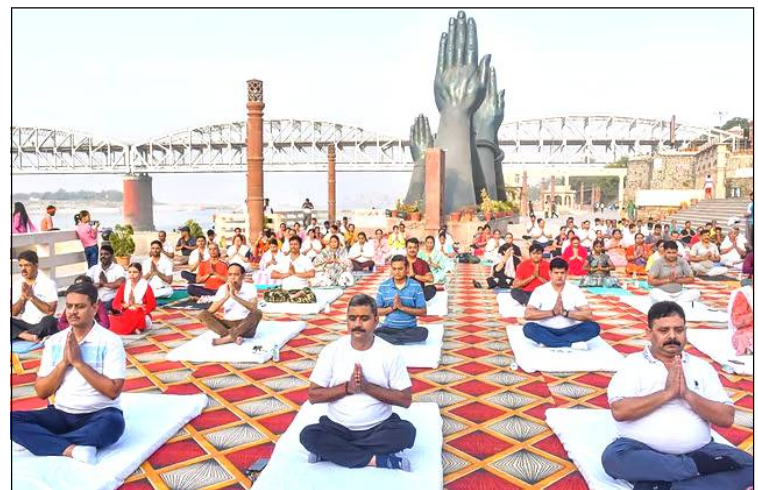
International Day of Yoga anogomong atongtsü mapang ana nung lia June 15, 2024 nü Varanasi kübok Namoo Ghat nung yoga aidang tangokba noksa nung angur.

District Education Officer-i parnok anema Godhra Taluka Police Station nung ken o ka benokogo.