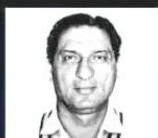
Polly Umrigar 1st 200 in Test