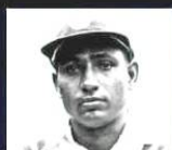
Lala Amarnath 1st 100 in Test