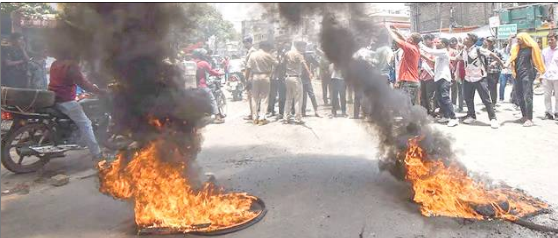
NEET-UG exam results nung ochimashi anema June 15, 2024 nü Bihar yimtiba, Patna nung kaketshirtemi garitsüing rongka longkak aiddang tangokba noksa nung angur.

Tawa Lok Sabha elections nung Maharashtra nung Congress-i menden 13 nung takok angu, Shiv Sena (UBT)-i menden 9 aser NCP (SP)-i menden 8 nung takok ngua liasü.