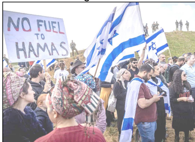
USA Tir Joe Biden indang administration-i Hokolbarnü Tzav 9 nem tenokdangba agütsüogo.