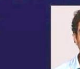
Robin Uthappa 1st 50 in T20