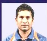
Sachin Tendulkar 1st 200 in ODI