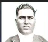
Mohammad Nissar 1st Wicket Test