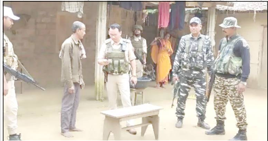
Manipur nung Jiribam district kübok Jakuradhor yimtsüng nung bomb ka pokdaksüba sülen tensa azüoktsü atema ki meita aoba noksa angur.

Jiribam, Aami/June 15 (Agencies): Manipur nung Jiribam district kübok Jakuradhor yimtsüng nung bomb ka pokdaksüba sülen tensa azüoktsü atema ki nungi ki meita aoba sentong aser area domination ayongzük agiogo, ta Manipur police control room-i Honibarnü metetdaksü. Iba bomb ya June 13 nü anepdang 1 ako shi nung Jakuradhore Part 1 village kübok Narayanpur tesem nung Meetei nunger ka ki dak rangloker pokdakja liasü. Tang kin o kin tsüngda