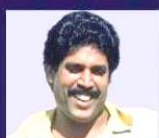
Kapil Dev 1st 100 in ODI