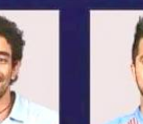
Suresh Raina 1st 100 in T20