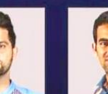
Zaheer Khan 1st Wicket T20