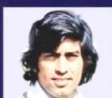
Eknath Solkar 1st Wicket ODI