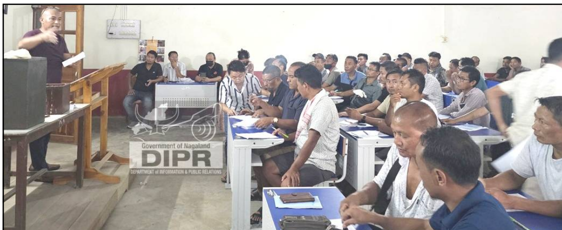
Dimapur ULB election atema renemshiba mapang Dimapur District Administration-i achayanga presiding Officer, polling officer, polling officer 1 aser 2 aser grade IV staff tem densema polling personnel tem training mezüngbuba shilem June 15 nü Dimapur Government College nung agiogo.

Iba ya WMD Dance Battle volume 2.0 asütsü anungji tsüngsangertemi arua shilem agitsü aser senpet agizüksü ayongzükür ta Pucho-isa ashi.