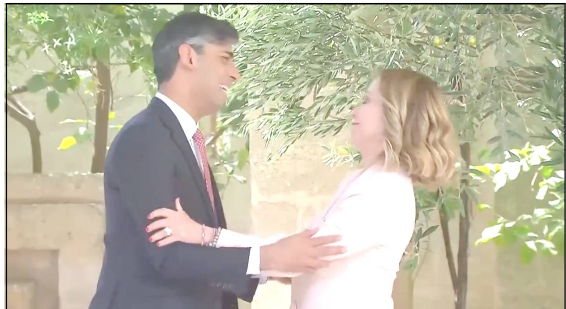
Italy PM Giorgia Meloni-i summit tenzüka anogo G7 züingsemtem ajak pelashishia agizükba liasü. G7 Summit nung British Prime Minister Rishi Sunak densema linük balala lenirtemi shilem agidar.

South China Sea ya Vietnam, Malaysia aser Brunei nung atema-a kanga tongtibang lir aser tesem kar nungbo parnoka China den mangatettep lir.