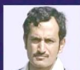
Ajit Wadekar 1st 50 in ODI