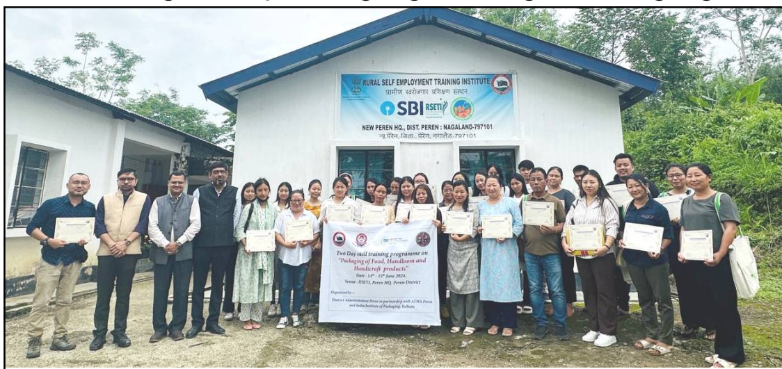
Peren nung June 14-15, 2024 anogotem food packaging training agiba nung shilem agirtem kulüzüng kaket amer tangokba noksa ka yangi angur.

Dimapur, Aami/June 16 (TYO): Peren nung "Packaging for export of food, Handloom & Handicraft Products of Nagaland" indang training sentong ka June 14 & 15, 2024 anogotem ayongzüka agia liasü.