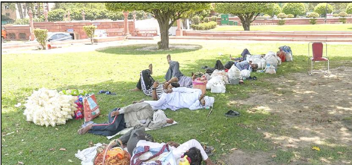
June 16, 2024 nü New Delhi nung lenmang nung yokya-yokchirtem süngdong ka akhümbok nung anisüngzükdang tangokba noksa nung angur.

Nashishi anguba sülen FIR ka benok aser nisung ka puogo; tanünga nisung terji tang tebushidak, ta paisa metetdaksü.