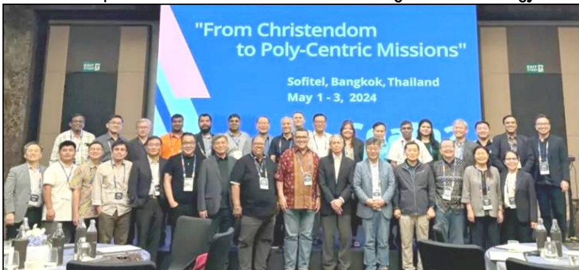
Taoba ita Thailand yimtiba, Bangkok nung alima nung mission lenirtem, missionary tem aser pastor tem senden amenba mapang tangokba noksa nung angur.

June 16, 2024: Alima nung Khristai tenyaba wadang longjemer inyaksü asoshi tawa Global South nung lenirtemi mission telok ka tentetogo.