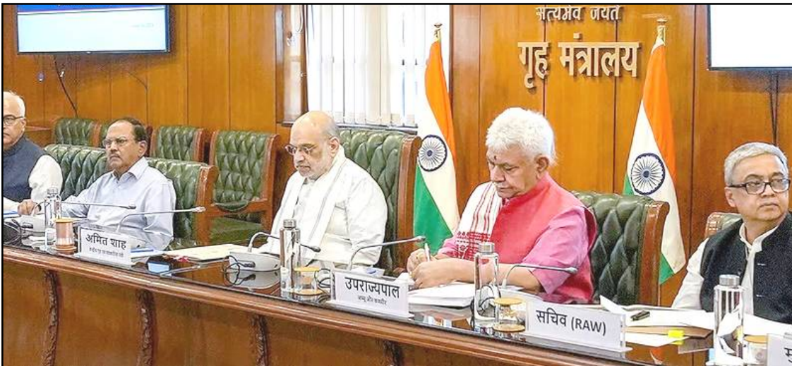
June 16, 2024 nü New Delhi nung Union Home Minister Amit Shah leniba nung tongti ketdangsertem senden ka mena Jammu & Kashmir nung security tensa asadanga mapang tangokba noksa nung angur. Kasa noksa nung Jammu & Kashmir Lt. Governor, Manoj Sinha aser National Security Advisor, Ajit Doval nata angur.