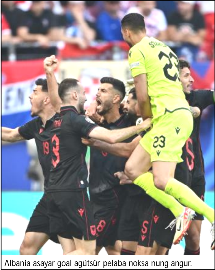
Albania asayar goal agütsür pelaba noksa nung angur.