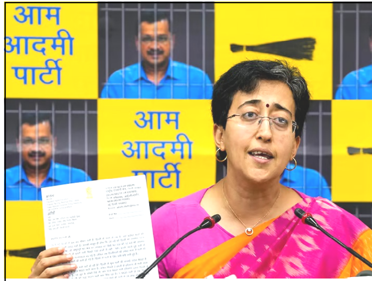
June 19, 2024 nü New Delhi nung AAP lenir aser Delhi Minister Atishi-i osangbenertem senden ka nung jembidang tangokba noksa nung angur.

TRF-i sangdong ka ajanga, tarutsü nunga maneni kiralongrartemi tanga state nungi arurtem amaktsü, ta amokmerenogo.