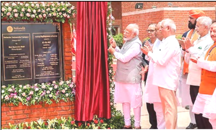
June 19, 2024 nü Nalanda district nung Ato kilonser Narendra Modi-i Nalanda University indang campus tasen ka semzüksüdang tangokba noksa nung angur.

Patna, June 19 (Agencies): Bodhbarnü Bihar kübok Rajgir nung Ato kilonser Narendra Modi-i Nalanda University nung campus tasen ka semzüksüogo.