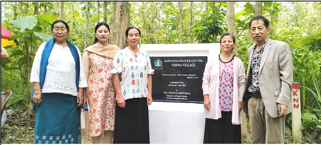
June 18, 2024 nü Chümoukedima district kübok Vidima yimdak Koinonia Baptist Church (KBC) indang ministry Koinonia Prayer Centre (KPC) amenoktsü atema foundation lung azüngba sülen tangokba noksa nung angur.