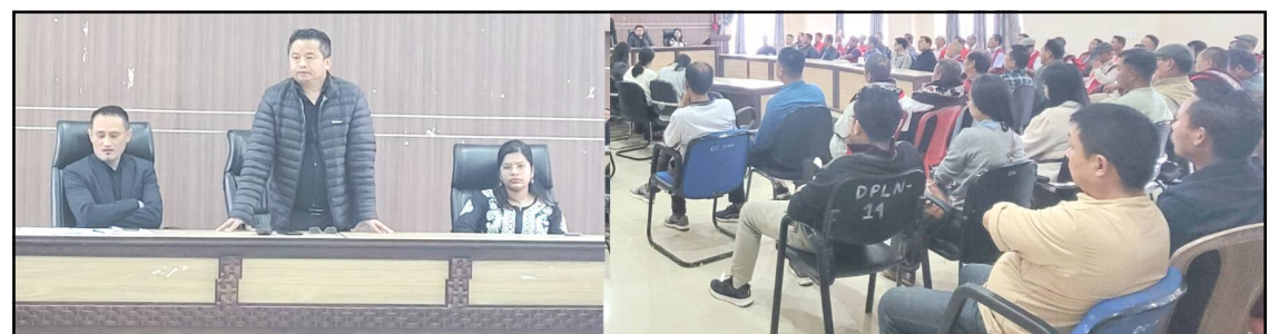
ULB elections dak sendakba ken o jembitsü asoshi ADC & Returning Officer, Mokochung Municipal Council ajanga Deputy Commissioner, Mokochung indang Conference Hall nung June 19, 2024 nü senden ka ayongzüka liasü, kong candidate ajak, party workers, All Ward Union nungi züngsemtem, GBs, Mokochung Town Lanur Telongjem, Sector Magistrates aser Sector Police Officers tem dena liasü.

nokdaksü, nibur asoshi inyaksü aser teti niburtem den alitsü, ta lai nangzüka liasü. La indang symbol "Battery