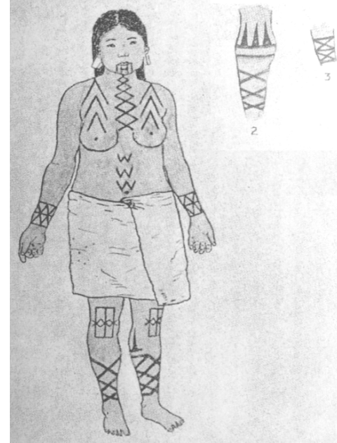
1. TATTOO OF A WOMAN OF THE CHANGKI GROUP 2. BACK OF THE LEG OF THE SAME. 3. ALTERNATIVE PATTERN FOR WRIST