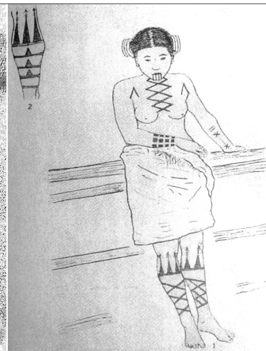
1. TATTOO OF A WOMAN OF THE CHONGLI GROUP. 2. BACK OF THE LEG OF THE SAME.