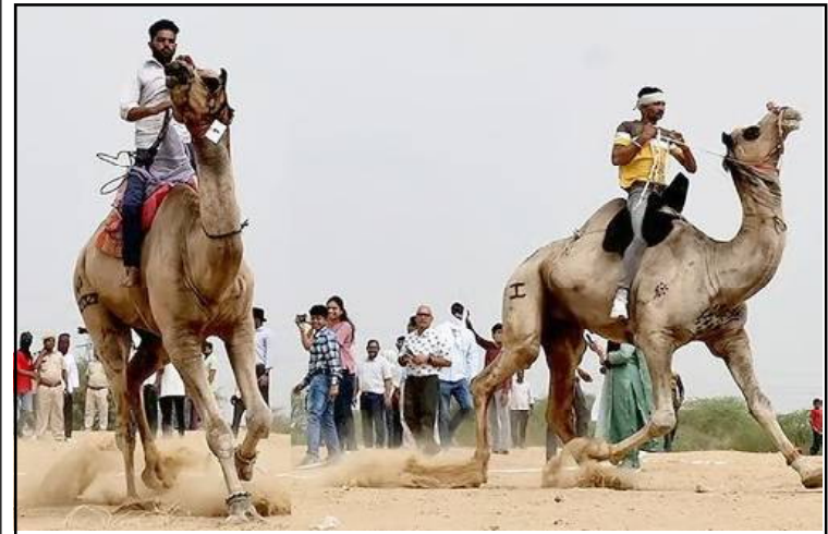
June 22, 2024 nü World Camel Day anogomong nung Bikaner nung aliba ICAR National Research Centre nung Ut nung mener asemtepba noksa nung angur.

Adhir Ranjan Chowdhury-i Baharampur Lok Sabha constituency nung TMC candidate, Yusuf Pathan den toktep saka tamakok angu. Iba jakdangbo Adhir Ranjan Chowdhury-i iba menden nung ponguben tashi takok ngua liasü.