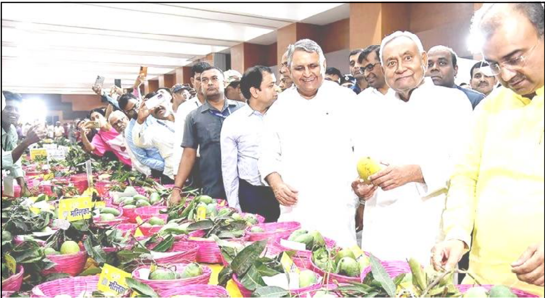
June 22, 2024 nü Bihar yimtiba, Patna nung 'Aam Mahotsav' (titi benjung) nung Bihar Chief Minister Nitish Kumar den tangartem adenba noksa nung angur.

Iba tesem nung joko tensa meraksatsü atema police den Rajasthan Armed Constabulary sepaitem aika yoka lir, ta paisa metetdaksü.