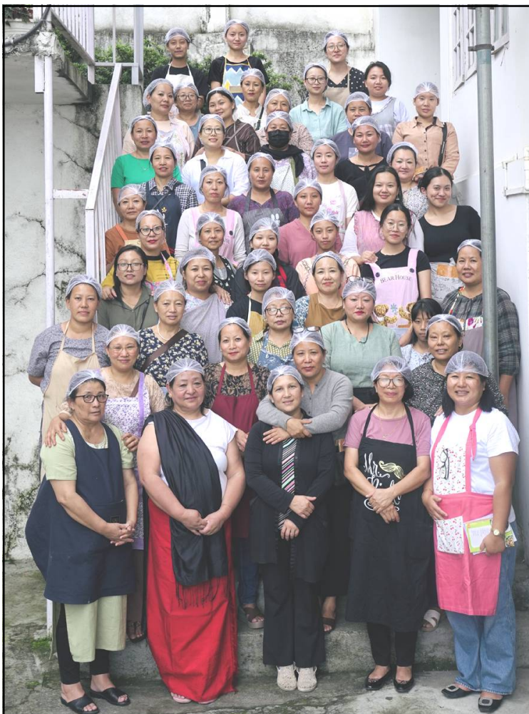
June 22, 2024 nü Zeme Baptist Church, Kohima Women Department-i 'cooking class' ayongzüka agiba sülen tesayurtem aser shilem agirtem külemi tangokba noksa nung angur. Iba sentong nung nisung 50 dak temai shilem agia liasü.

Tsüngrem oi asenok dang mepishia asüngdang kokrabang. Nisung tsüngta meimteptsü, akhümstsubuteptsü, anebaluteptsü, mapa tajung inyaktsü, o tajung jembitsüji mapa tasak masü. Ajak dang temelatiba mapa inyaktsü asoshi Tsungrem oi asenok dang mepishia asüngdang, kechiyong ibaji kotaki aniba lenmang. Adianutem, laishiba nung kokrabang nabo mulumi-i oang ta zülua mangutsü. Saka "naibo ajak den" ta ashibaji tangar ajakji anir Kotak atongtsü merangang ta ashirago yamaji inyaktsü merangdi.