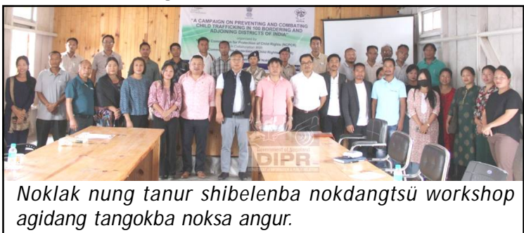
Noklak nung tanur shibelenba nokdangtsü workshop agidang tangokba noksa angur.

Dimapur, Aami/June 22 (TYO): India nung arütsü anasa aliba district 100 nung tanur shibelenba nokdangtsü aser samadaksütsü asoshi campaign shilem ka ama June 21, 2024 nü Deputy Commissioner, Noklak indang Conference Hall nung 'Preventing and Combating Child Trafficking' indang workshop ayongzüka liasü.