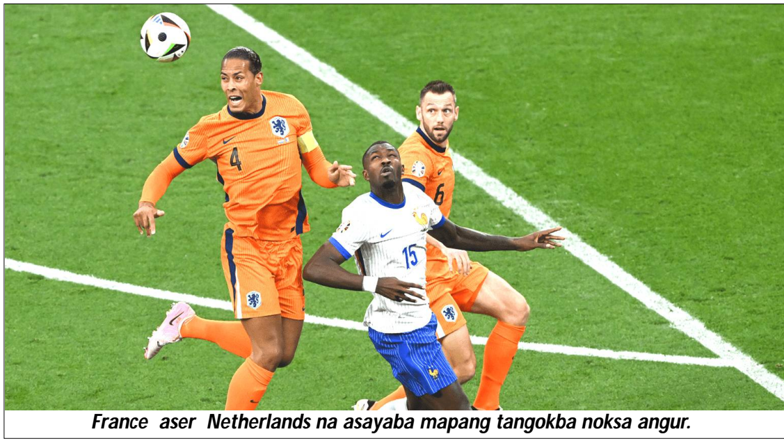
France aser Netherlands na asayaba mapang tangokba noksa angur.