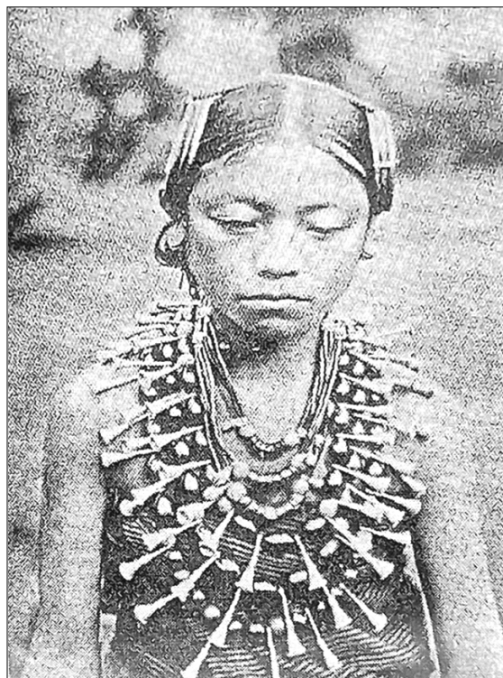
A YOUNG CHONGLI WOMAN OF CHUCHU YIMLANG WEARING "MECHONGCHANGSHI" NECKLACES AND "YONGMEN."