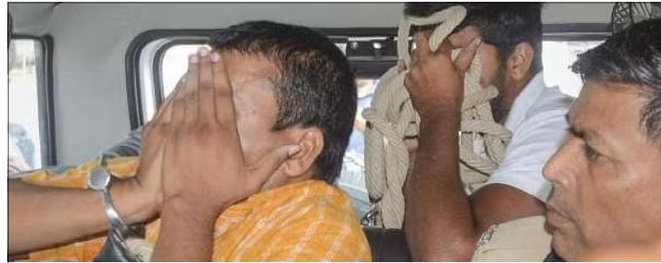
June 23, 2024 nü Economic Offences Unit (EOU) ketdangsürtemi NEET-UG exams 2024 nung tim masüba inyaker ka pur LNJP hospital, Patna-i medical examination atema anir aodang agiba noksa ka angur.

New Delhi, Jun 23, 2024 (Agencies): National Testing Agency (NTA)-i Deobarnü kaketshir 1,563 atema NEET-UG examination indang retest agiogo. State 4 aser Union Territory kübok centre 6 nung kaketshir 1,563 nungi 813-i dang retest agütsü aser kaketshir 750 maru ta NTA-i ashi. Meghalaya, Haryana,