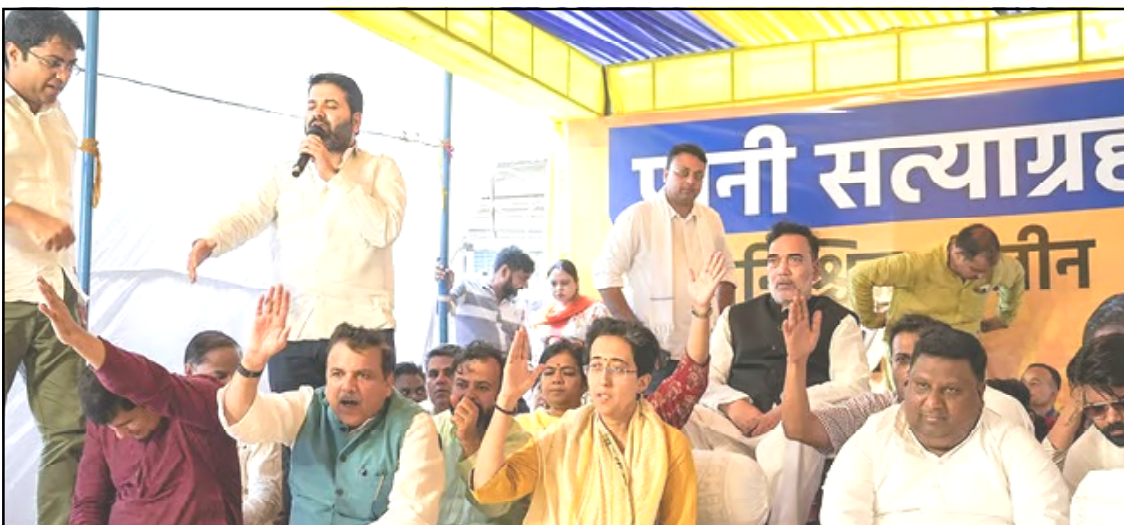
New Delhi, June 23, 2024: New Delhi nung tzü agi anüngba anema Delhi Water Minister aser AAP lenir Atishi Singh den AAP lenirtem- Saurabh Bhardwaj, Sanjay Singh aser Gopal Rai nungeri tasemnübuba lumia longkak aidang tangokba noksa nung angur.

Süngdongji village panchayat li, development authorities li, industrial tesemtem, arem, defence aser railway li aser expressways aser ayongtem meketa atemtsü. Iba dak alia medical aser shisaliok rejutem, sorkar kiojentem aser nija litem nunga atemtsü ajungshir, ta sorkari metetdaksü.