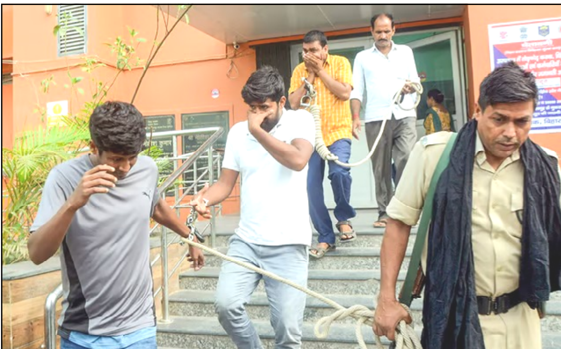
Patna, June 23, 2024: NEET-UG exams 2024 ochimashi ken o nung pua alirtem Amongnü LNJP hospital-i anir oa medical check-up agiba sülen Economic Offences Unit (EOU) sepaitemi parnok meyipa anir aodang tangokba noksa nung angur.