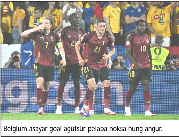
Belgium asayar goal agütsür pelaba noksa nung angur.

Berlin, Aami/June 23 (Agencies): Honibar aonung Portugal-i Türkiye madak 3-0 agi akokba sülen Group F nungi winner ama last 16 tongogo aser Belgium-ia Group E nung par telok asoshi mezüing takok ngua liasü.