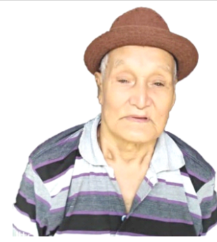
TALIMEREN Lkr (Yaongyimsen Village) 24th June 2023

Obala onok nungi pilar küm 1 ajungba anogo menungraa bilemtetter. Küm süla oaga nai toktsür aoba temeimbatem tanü tashi molong züreper. Ne temeim aser terajem mapa tajung onoki bilemtetdang ozü molong süneper.