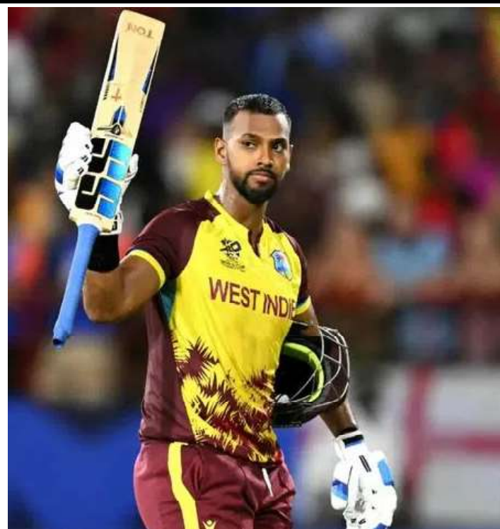
West Indies nunger wicketkeeper-batter Nicholas Pooran-i taoba opener Chris Gayle indang otsü ka ajatetogo. Nicholas Pooran-i T20 World Cup edition ka nung six teimtiba züktokba otsü yanglu aser iba ya USA den asayadang 12-ball nung sixes 3 dena runs 27 yangludang Gayle indang record ajateta liasü.