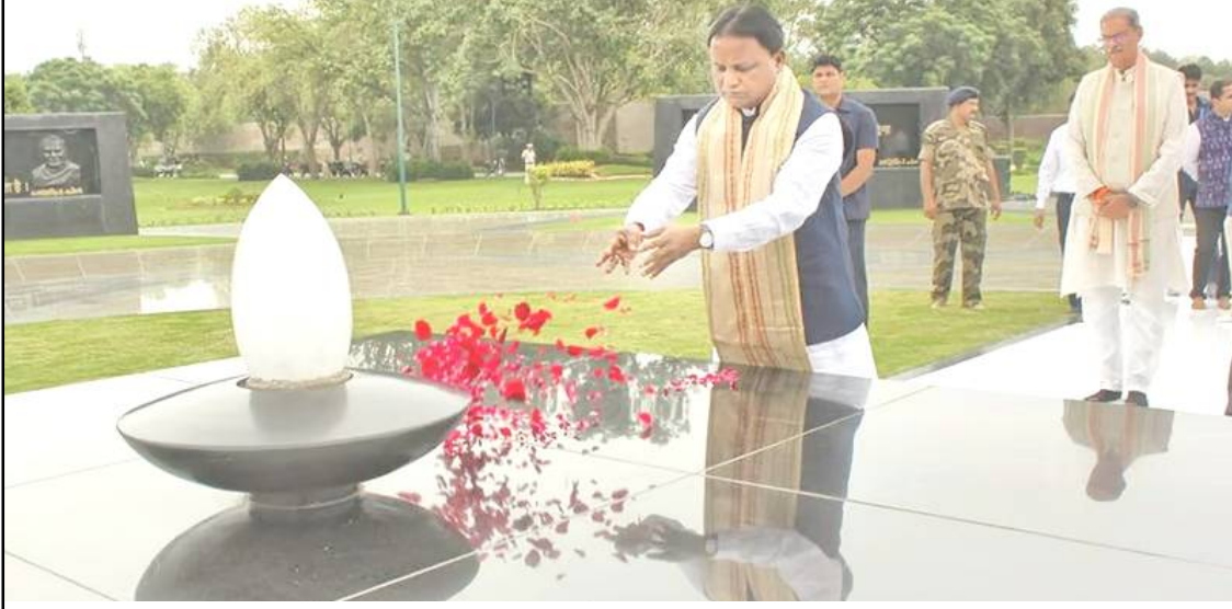
June 29, 2024 nü New Delhi nung Odisha Chief Minister, Mohan Charan Majhi-i taoba mapang Ato kilonser, Atal Bihari Vajpayee indang memorial Sadaiv Atal semdanga asür nem akhüm agütsüdüng tangokba noksa nung angur.

ajanga Soren-i aibelenali ama reprangteter aser pa nem bail agütsüyonga pai ozüng alema meinyaktsü, ta reprangteta court-i pa nem bail agütsü. Ali acre 8.36 ochimashi ken o dak sendakba nung taküm January 31 nü lir Enforcement Directorate (ED)-i Soren pua liasü. Soren-i, BJP-i linük temzüng kübok reju ajunga azüoker, ajisüaka tawa Lok Sabha election nung nüburtemi BJP dang tansütsü lesson ka sayuogo, ta ashi. "Parnoki (BJP) assembly election mapang atsüzüker jelia agitsü sentong yanglur, ta ni osang angazükogo. Ni parnok dang mashie anogo ka nung election ayongzüktü jazüker. BJP-i Jharkhand assembly elections nung takok angutsü mangdang ayubaji pongmang dang asütsü. State aika nung BJP-i tribal lenirtem Chief Minister shimer, ajisüaka parnokji 'rubber stamps' ama dang amshir," ta Soren-isa metetdaksü.