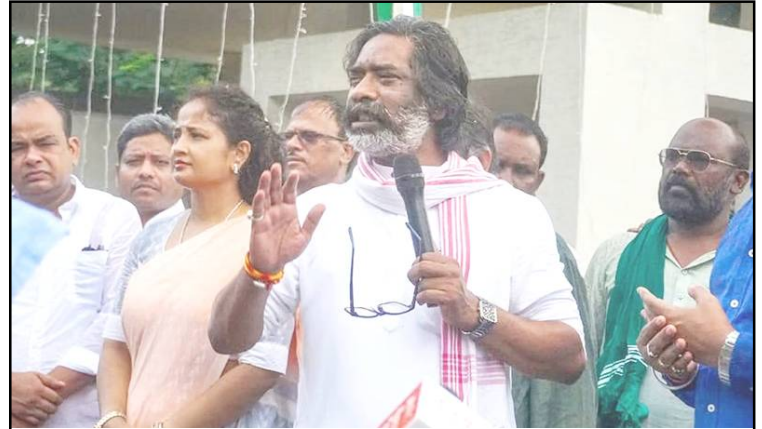
June 29, 2024 nü Ranchi nung taoba mapang Jharkhand chief minister aser JMM lenir, Hemant Soren-i party nung inyakerterem den jembidang tangokba noksa nung angur. Hokolbarnü Jharkhand High Court-i Soren nem bail agütsüba sülen mapang tatsüka tsüngda pa jail nungi chioka liasü.

Ranchi, June 29 (Agencies): Honibarnü taoba mapang Jharkhand nung chief minister inyaksang, Hemant Soren-i, taruba assembly election nung state nung BJP atsüngdoktsü, ta ashi. Honibarnü par kidang JMM party nung inyakerterem den jembidang Hemant Soren-i, "Ni jail nung puoktsü atema ni anema asalentong yanglurtem anema inyaksü aser Jharkhand nung nüburtemi BJP nem tatok magütsüsü," ta ashi. "BJP indang tasü mang süngden nung tatembangbuba kojat angenoktsüsü atema mapang tongogo. Tarutsü anogotem nung Jharkhand nungi BJP atsüngdoktsü," ta JMM executive president, Soren-isa metetdaksü. Ali ochimashi ken o nung ita pongu tejaklen Soren apuba sülen pa Birsa Munda Jail nung puoka liasü. Hokolbarnü Jharkhand high court-i pa nem bail agütsüba sülen ghonda ishika tsüngda pa jail nungi chiok. Mezüng bushisüngdang