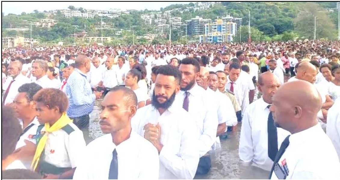
Papua New Guinea nung Seventh-Day Adventist Arogoi ayongzükba baptiba sentong nung tangokba noksa nung angur.

June 29, 2024: Tawa Papua New Guinea nung Seventh-Day Adventist Arogoi nisung 300,000 dak tema baptitsüogo, ta Arogoi metetdaksü.