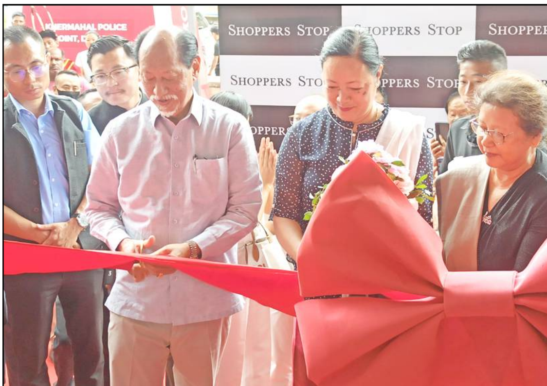
Nagaland CM Neiphiu Rio-i, Dimapur nung Shoppers Stop's First Store lapoktsüba noksa nung angur. (Dimapur, June 29, 2024)

Dimapur, Aami/June 29 (TYO): India's premium fashion, beauty and gifting omnichannel destination Shoppers Stop-i, Khermahal Police Point, Dimapur nung parnok indang mezüngbuba store lapokba sangdongogo.