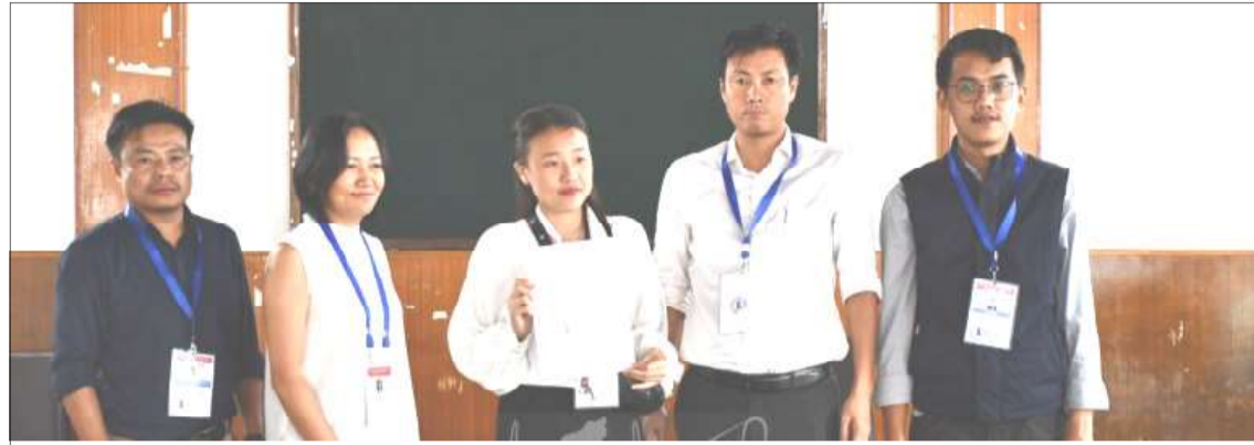
ULB Election, 2024 nung takok angurtem rongnung tanutsüla arishi küm 22 tain Nzanrhoni I. Mozhui-i kulikaket amer ketdangsürtem külemi agiba noksa ka angur.

Kohima, June 29, 2024 (TYO): Nagaland nung taküm Lok Sabha elections nung tamakok anguba sülen Nationalist Democratic Progressive Party (NDPP)-i tawa urban local bodies (ULBs) election nung takok tulu ngutetogo.