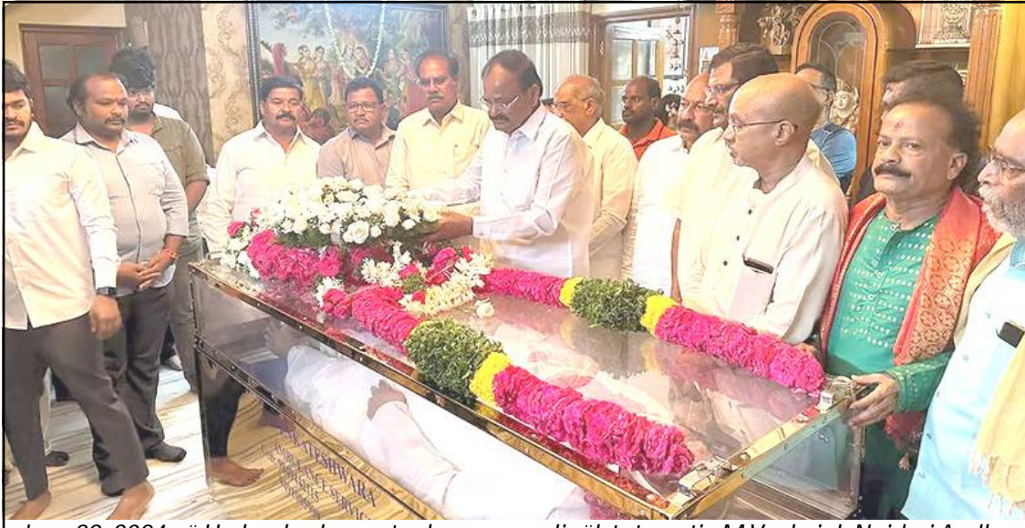
June 29, 2024 nü Hyderabad nung taoba mapang linük tatong tir, M Venkaiah Naidu-i Andhra Pradesh nung taoba mapang minister, asür Dharmapuri Srinivas mangjak nung akhüm agütsüdüng tangokba noksa nung angur.