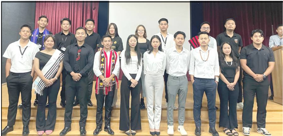
NSUDD nung ketdangpur tasen aser tejentem den election commission külemi tangokba noksa nung angur.

Dimapur, Aami/June 30 (TYO): Naga Students' Union Dehradun lokti senden den külemi ketdangpur tasen shimba sentong ka June 22, 2024 nü Dolphin PG Institute of Biomedical & Natural Sciences nung agia liasü. Lokti lungjemer tejakleni aotsü aser züngsemtem metetpelatsü atema iba lokti senden ya tongtipang sapang ka lir. Iba sentong nung taoba mapang takok anguba, tang tayongzükba balala aliba aser