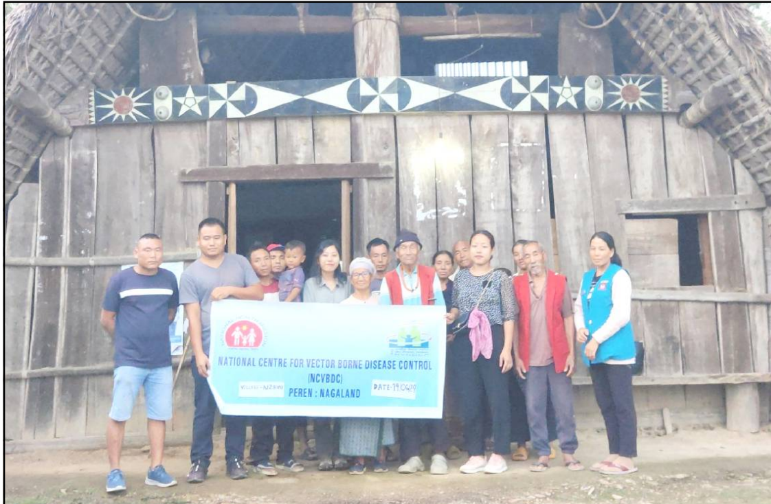
Peren district kübok meta talang nung aliba Nzauna yimtsüng nung Anti Malaria Month amungdang tangokba noksa ka nung ketdangsür aser shilem agirtem angur.

Dimapur, Aami/June 30 (TYO): CMO Peren kübok National Centre for Vector Borne Diseases Control (NCVBDC) ajanga "Accelerating the fight against Malaria for a more Equitable World" omen kübok June 30, 2024 nü Anti Malaria Month mungogo. Ita piyong campaign atema State NCVDC ajanga yimtsüng 12 shimtet aser item yimtsüngtem ya low reach/possible malaria susceptibility/asor atüngsü tasak tesemtem nungi shima liasü. Item nungji ajemdaker Government facilities nung ramen angati tendangtsü aser anepalutsü anguba nung ajemdaker Vector Borne Diseases, Prevention and Control indang IEC/BCC amaparen GMS Samzuiram,