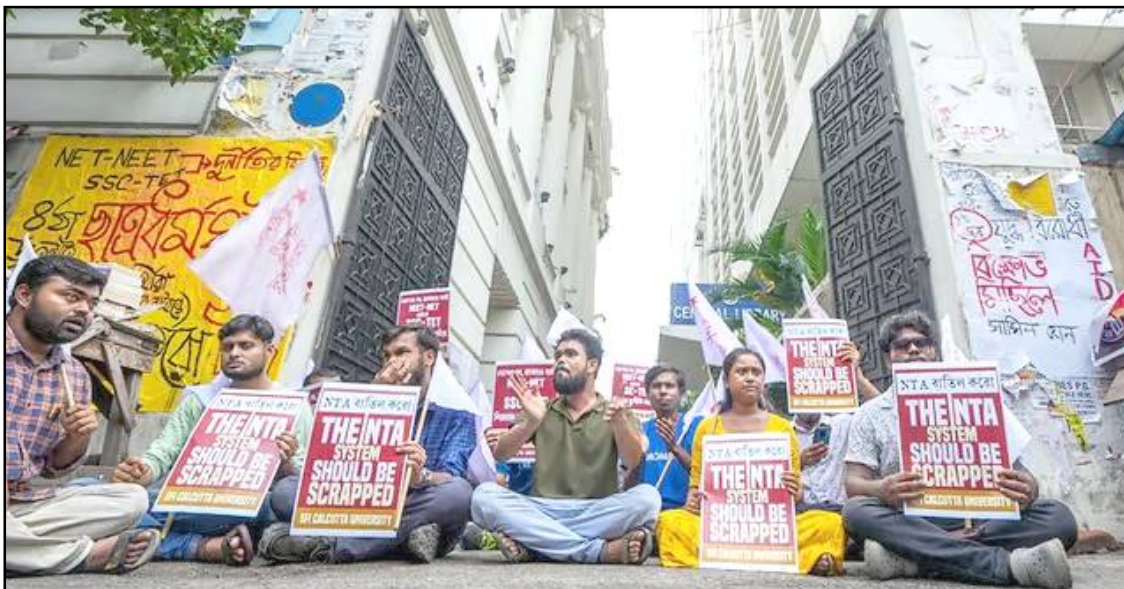
July 04, 2024 nü Kolkata nung Calcutta University kima Students' Federation of India (SFI) züngsemtemi NEET-UG exams nung ochimashi anema longkak aйдang tangokba noksa nung angur.