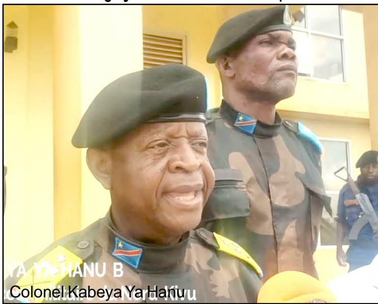
Colonel Kabeya Ya Hanu B

Kinshasa, Chiteni/July 04 (Agencies): Democratic Republic of the Congo (DRC) nung M23 tsökchir den raraba mapang jena ao ta tai tonglokja aliba sepai 25 nem tasüba temerenshi agütsüogo.