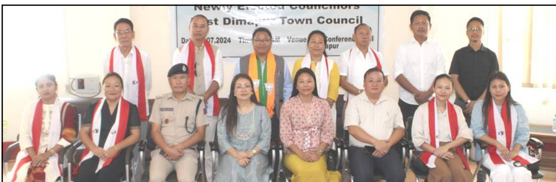
DC Dimapur, Dr. Tinojongshi Chang, advisor, industries & commerce Hekani Jakhalu, aser ADC, Dimapur, Mhalo Humtsoe, nunger den East Dimapur Town Council züngsem/councilor tem July 4 nü DC conference hall, Dimapur nung tenangzüktepba agiba sülen tangokba noksa nung angur.

Dimapur, Chiteni/July 4 (TYO): Dimapur Deputy Commissioner Dr. Tinojongshi Chang, NCS-i achaayanga July 4 nü Nagaland Municipal Act, 2023 Section 60 A dak ajemdaker tawa shimba East Dimapur Town Council züngsem 11 tenangzüktepba agiogo. Iba sentong ya Dimapur Deputy Commissioner indang office nung agia liasü.