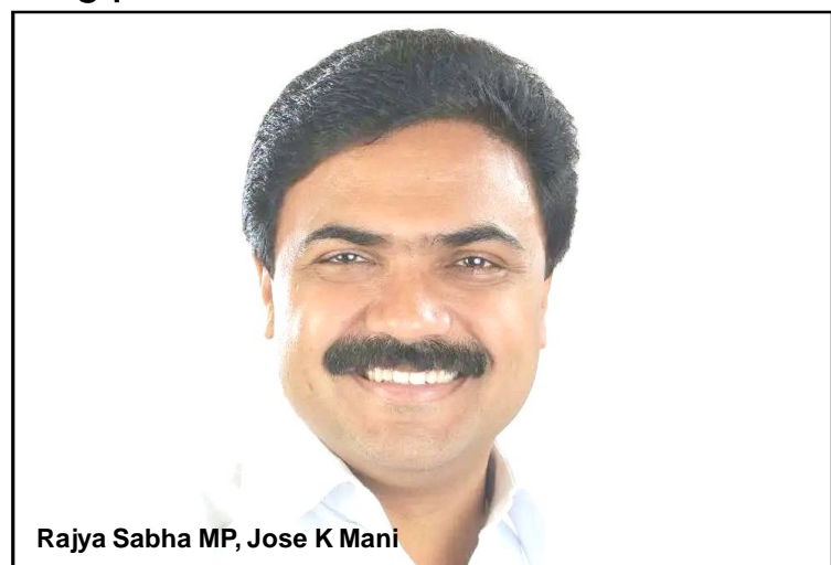
Rajya Sabha MP, Jose K Mani

Mahdya Pradesh kübok Jabalpur district nung May 27