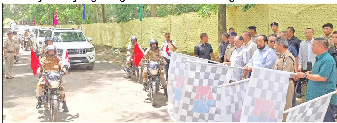
Police Complex, Chümoukedima nung June 4, 2024 nü Nagaland Police atema gari tasen semzüktsüba mapang tangokba noksa ka yangi angur.

Dimapur, Chiteni/July 04 (TYO): State nung police maparen tashi taiiba kumdaktsüsi mechi Chief Minister Neiphu Rio aser Deputy CM aser Home Minister, Y. Patton nati July 4, 2024 nü Police Complex, Chümoukedima nung Nagaland Police atema Bolero 35, bikes 100 aser Mobile Forensic Investigation Van (MFVs) ana semzükja liasü.