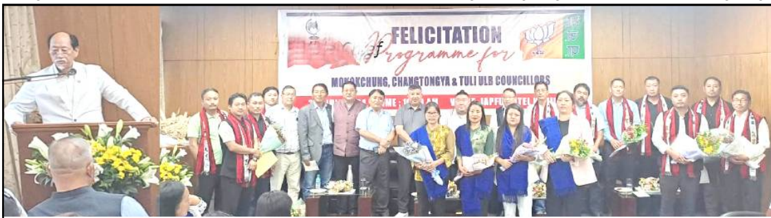
Nagaland Chief Minister Neiphiu Rio-i sentepa aliba lokti den o jembiba mapang tangokba noksa nung angur.

Dimapur, Chiteni/July 4 (TYO): Mokokchung Municipal Council, Tuli Town Council, Changtongya Town Council aser Mangkolemba Town Council nungi NDPP Councilor tem nem tenüngsang agütsüba sentong July 3 nü hotel Jafu Kohima nung agiogo.