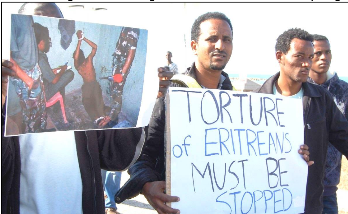
Eritrea nung Khristantem reshikangshiba anema longkak aitdang tangokba noksa nung angur.

July 4, 2024: Africa anüdoklen aliba Eritrea linük ya alima nung Khristantem alitsü majungba linük tamajungtibatam rongnung densema lir.