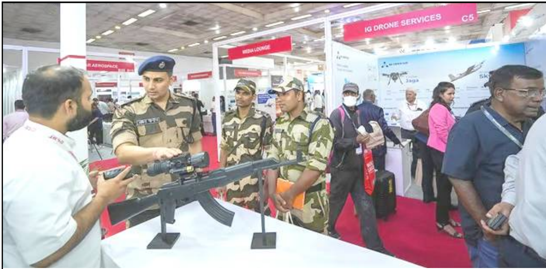
July 04, 2024 nü New Delhi nung International Police Expo 2024 aser Drone International Expo nung sepaitemi raraba hadir balala reprangdang tangokba noksa nung angur.