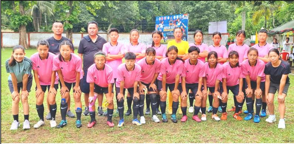
Sentinel North East Cup 2024 nung Nagaland nungi asayartem den coach aser manager külemi tangokba noksa ka yangi angur.

Kohima, Chiteni/July 05 (TYO): Hokulbarnü Nagaland tetsür football asayartemi Sontipur, Assam nung tang tasayadak Women Sentinel's Cup indang league match tatembangba nung Meghalaya madak 5-0 agi akokba sülen semifinals tongogo.