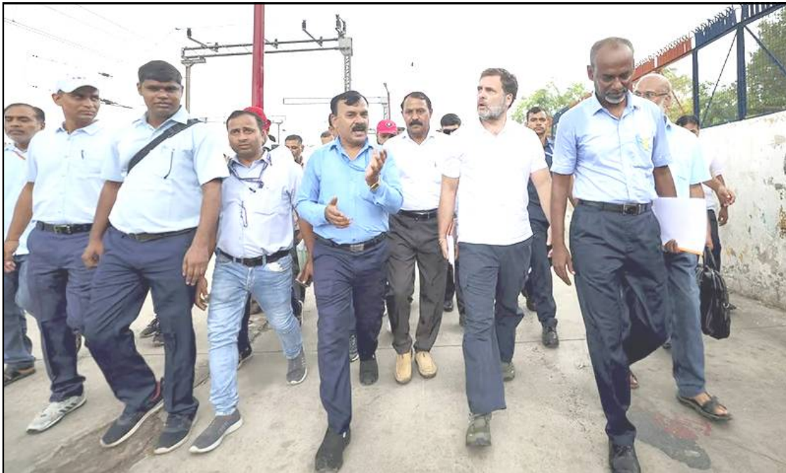
July 05, 2024 nü New Delhi Railway Station nung Opposition Lenir, Rahul Gandhi-i loco pilots ajurudang tangokba noksa nung angur. Train anishirtemi Rahul Gandhi dang, train anir staff tem kanga ajema aliba agi parnok anisungzüksü atema mapang peria mangur, aser ibaji ajanga train lendong-a ajurur, ta metetdaksü.

Lalu Prasad Yadav-i party nung inyakertem dang kanga küküma alitsü aser yimtenren tensa melenshitsü, anungji renema alitsüla, ta ayongzüküa liasü.