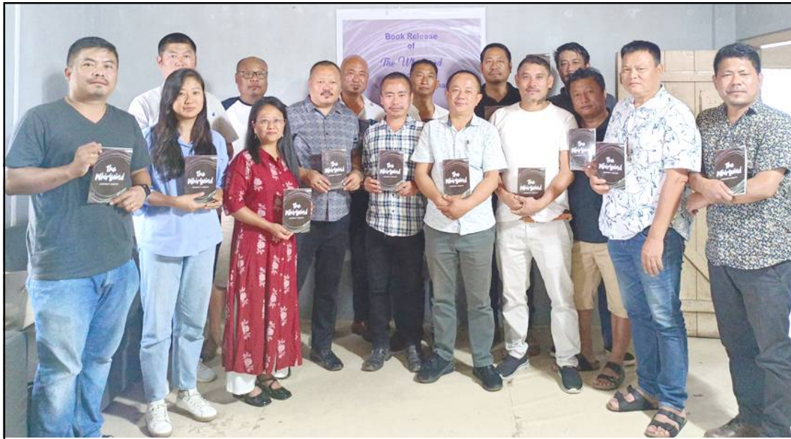
Longrangty Longchar-i züluba "The Whirlwind" kaket tanu Mokokchung Town Lanur Telongjem Kilem nung Wb.Imnaonen Pongen-I meraketa keta sayatsür kelen telok külemi tangokba noksa angur.

Mokokchung, July/Chiteni 08(TYO): Naga nung nungtoko kaketa zülur Longrangty Longchar-i züluba "The Whirlwind" Kaketa tanu Mokokchung Town Lanur Telongjem(MTLT) Kilem nung MTLT Tir Wb.Imnaonen Pongen-i meraketa keta sayatsüogo.