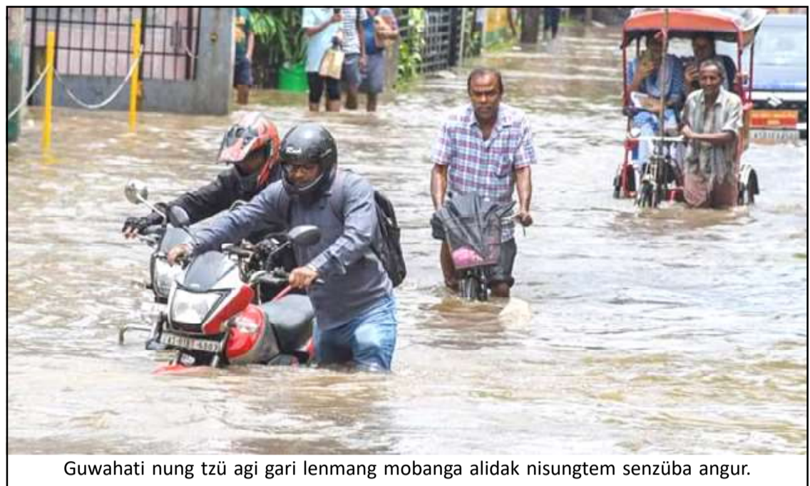
Guwahati nung tzü agi gari lenmang mobanga alidak nisungtem senzüba angur.

Guwahati/Silchar, July 8, 2024 (Agencies): Assam nung tzümetsüng tensa tamajungba akümer aser tang tashi lendong balala nung nisung 66 taküm samaogo.