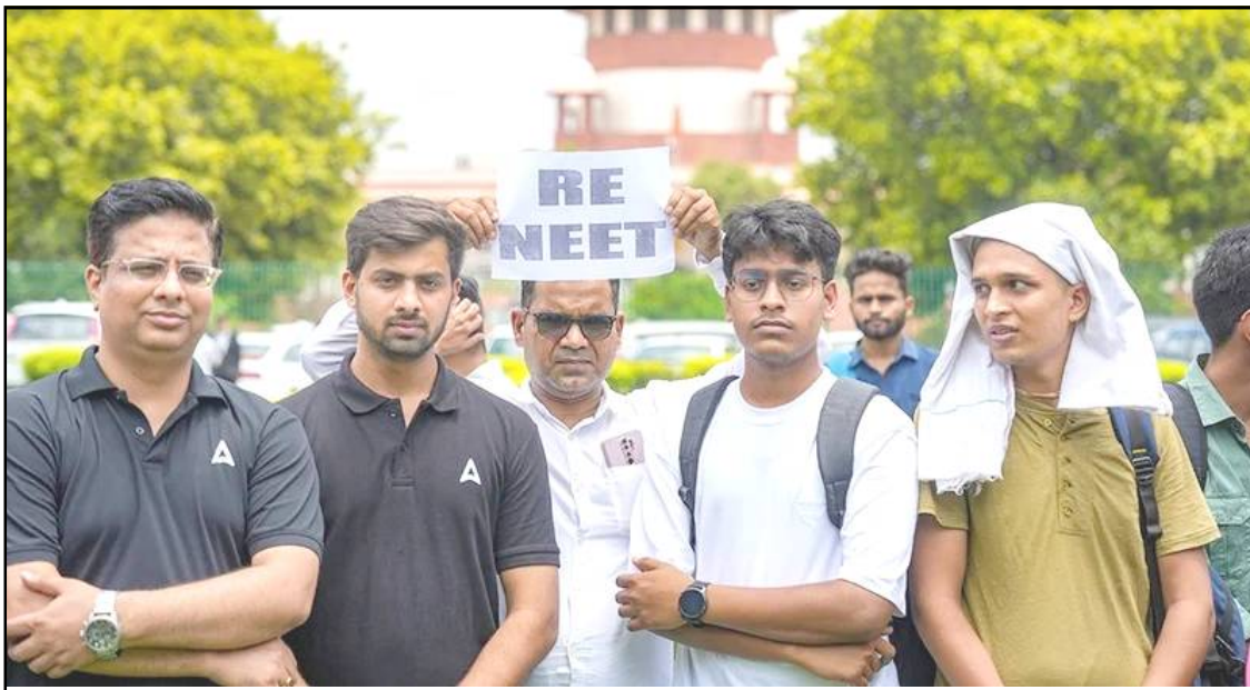
July 08, 2024 nü New Delhi nung Supreme Court kima kaketshirtemi NEET tatidang tanaben agishitsü takhangba agüja longkak aitdang tangokba noksa nung angur. NEET UG 2024 exams nung ochimashi aliba ken o Supreme Court-i angadang tenzükogo.

New Delhi, July 08 (Agencies): Hombarnü Supreme Court nung NEET UG 2024 exams nung ochimashi aliba ken o angadamba mapang nung National Testing Agency (NTA)-i question paper leak asüba nangzükogo, ajisüaka tesem kar nung dang atalok, ta metetdaksü.