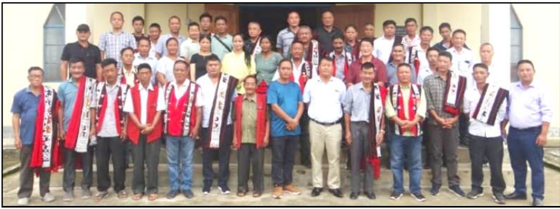
Küm ishika Mopungchuket yimden aser Kelingmen yimden tsünga Enki shia liasü. July 6, 2024 anogo nung tangatettep tajung arua, Enki lapoka yimjung yangluba tepela takok osang sangdonger.