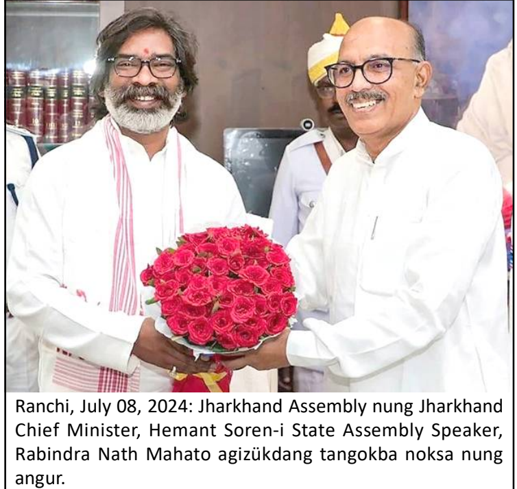
Ranchi, July 08, 2024: Jharkhand Assembly nung Jharkhand Chief Minister, Hemant Soren-i State Assembly Speaker, Rabindra Nath Mahato agizükdang tangokba noksa nung angur.