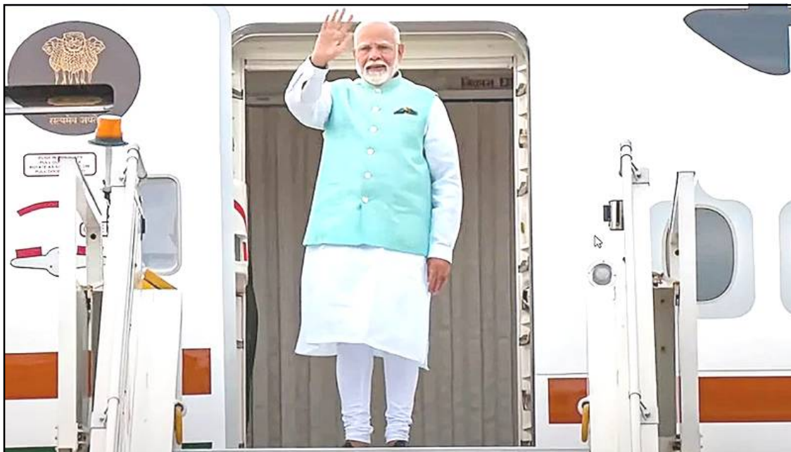
July 08, 2024 nü New Delhi nung Ato kilonser, Narendra Modi tayimtsü nungi Moscow-i apusotsü lia tangokba noksa nung angur.

Viksit Bharat @2047 atema sector 10 tsütsü mangdang renemtsü asoshi 2023 küm Niti Aayog nem mapa nunglokja liasü. Iba vision document nung rongsenketzung tsütsü terenlok, loktiliba tsütsü terenlok aser junga yimsüsübaren densema lenla aika densema lir.