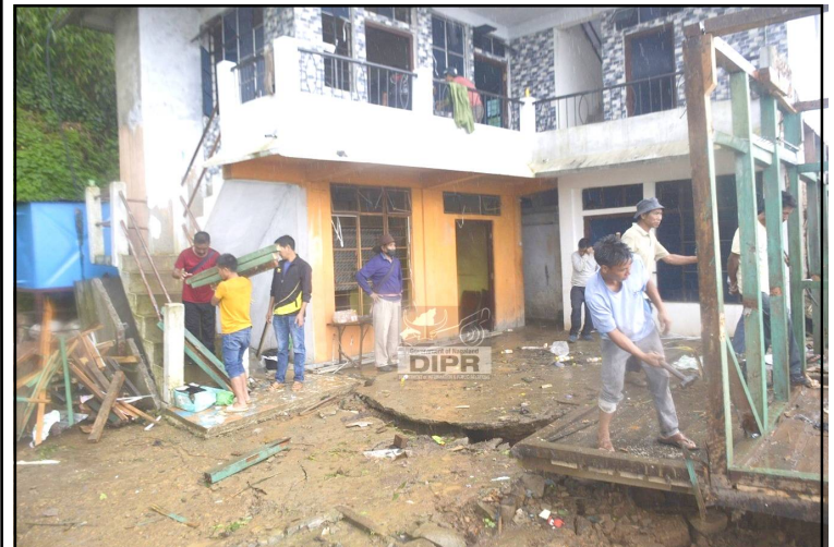
Tzünglu kanga sashia aruba ajanga Alahuto colony, Zunheboto nung ki o jen raksar aliba noksa nung angur.

Dimapur, Chiteni/July 08 (TYO): Tzünglu kanga sashia aser tanen makai aruba ajanga Zunheboto jila kübok Alahuto colony nung ali tuluka anenzüka ao.