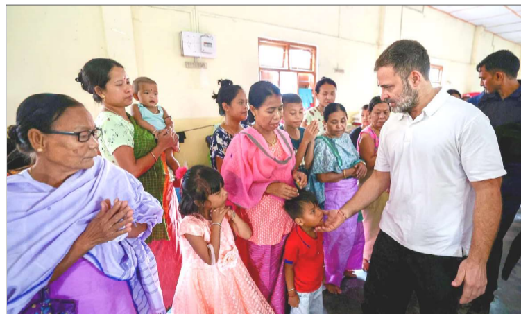
July 8, 2024 nü Congress MP aser Lok Sabha Leader of Opposition Rahul Gandhi-i Manipur nung relief camp ka semdangdang agiba noksa angur.

Imphal, July 8, 2024 (Agencies): Lok Sabha Leader of Opposition aser Congress MP Rahul Gandhi-i July 8 nü Manipur semdangogo. Manipur nung kin o kin tsüngda mepetmesü adokba sülen Rahul-i tan agi tasembenbuba atema Manipur semdang.