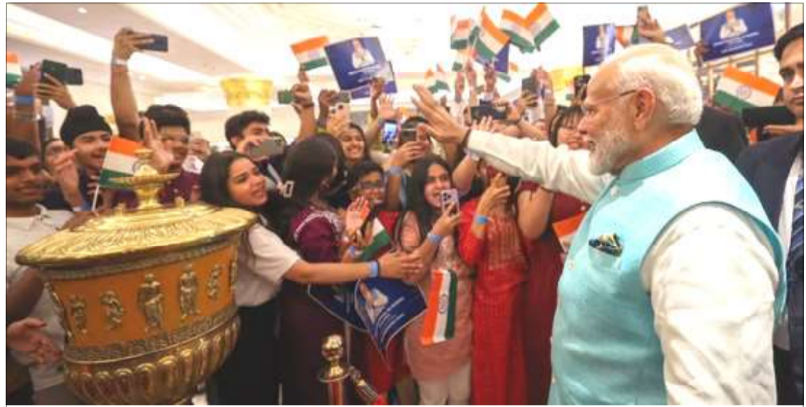
July 8, 2024 nü The Carlton Hotel, Moscow kima nung Russia nung aliba India nungeri Prime Minister Narendra Modi pelashia agizükba angur.

Moscow, July 8, 2024 (Agencies): Prime Minister Narendra Modi-i anogo ananü atema Russia semdang aser Hombarnü pa Moscow tongogo.