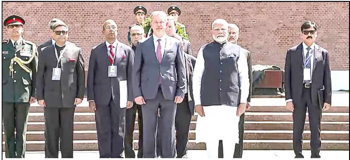
Ato Kilonser Narendra Modi-i Moscow Russia nung sepaitem leper nung aküm tetushi agütsüba noksa nung angur.

New Delhi, Aami/Junr 9 (Agencies): Ato Kilonser Narendra Modi-i anogo ana atema Russia semdangba mapang Mongolbarnü, Russia kübok Kazan aser Yekaterinburg nung consulates tasen ana lapoktsü aliba metetdaksüogo.