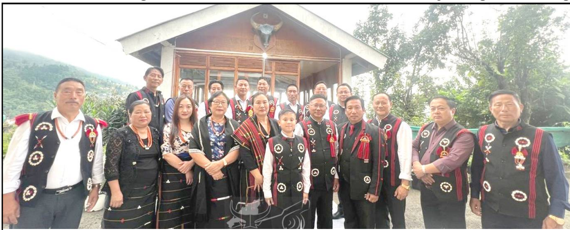
Kohima nung July 8, 2024 nü Tuluni benjong amungba mapang tangokba noksa ka nung Commissioner & Secretary, Y Kikheto Sema aser danga ketdangsürtem angur.

Dimapur, Chiteni/July 09 (TYO): Kohima Sumi Hoho tawabangba kübok Sumi Naga kin asoshi tongtipang benjongmung, Tuluni ya New Ministers' Hill, Kohima nung Y Kikheto Sema'er kidang July 8, 2024 nü munga liasü.