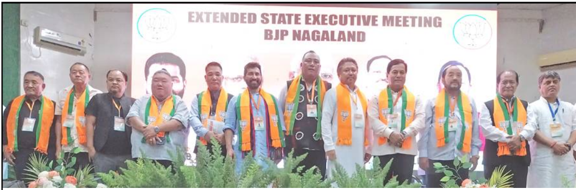
Mongulbarnü IMC Hall, Dimapur nung BJP State Executive meeting alidang tangokba noksa angur. (Dimapur, July 16, 2024)