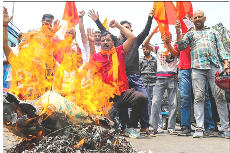
Jammu, July 17, 2024: Jammu & Kashmir kübok Doda district nung kiralongrartemi sepaitem amakba tatalokbatem anema Bodhbarnü Jammu nung Rashtriya Bajrang Dal züngsemtemi longkak aitdang tangokba noksa nung angur.

Tanübo India nung billionaire nisung 21 ket nung aliba rongsenji India nung crore 70 ket nung aliba rongsen dang nungi teimba kümogo, ta pai metetdaktsü.