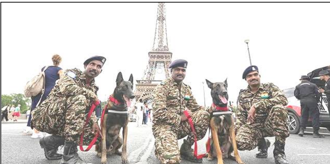
Paris, July 17, 2024: July 26, 2024 nungi Paris Olympics tenzüktsü lia tesem balala nung security agütsütsü atema India nunger CRPF sepaitem indang azü Vast aser Denby den sepaitem tangokba noksa nung angur. India nungi Canine team 10 France tonga ogo.

Taküm April ita nunga Israel den tesendaktep aliba commercial rong 'MSC Aries' nung India nunger 17 Iran sepaitemi pua liasü. India aser Iran ketdangsertem tsüingda tongtepratepa jembiba sülen ang India nungertemji chioka liasü.