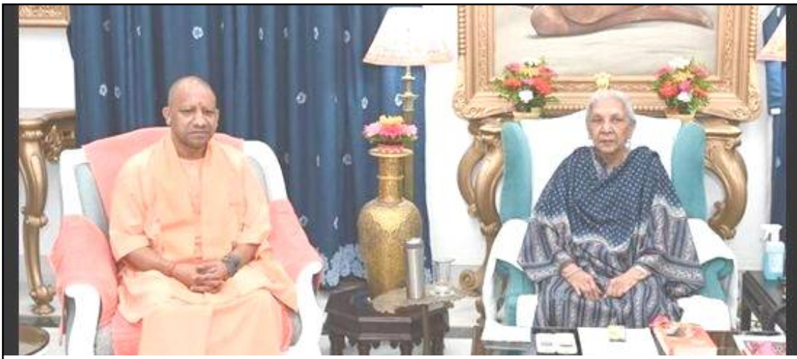
July 17, 2024 nü Lucknow nung Uttar Pradesh Chief Minister, Yogi Adityanath-i state Angh, Anandiben Patel ajurudang tangokba noksa nung angur.

New Delhi, July 17 (Agencies): Tawa Lok Sabha election nung Uttar Pradesh state nung BJP-i menden aika nung tamakok anguba sülen BJP-i voters nem tamang kadaktsütsü atema inyaker.