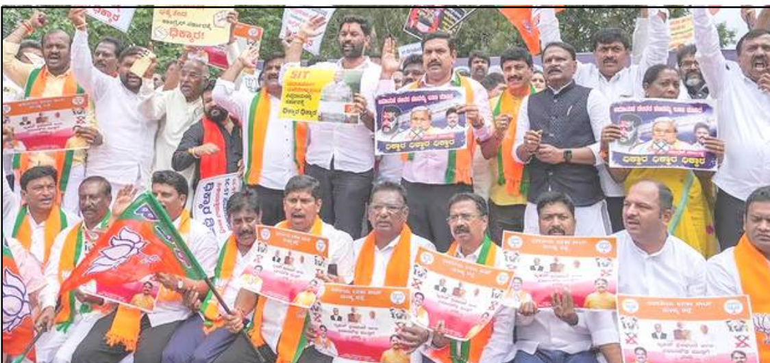
July 18, 2024 nü Bengaluru nung Karnataka BJP Tir, B Y Vijayendra leniba nung party lenirtemi Karnataka Maharshi Valmiki Scheduled Tribes Development Corporation Ltd. nung ochimashi liasü, ta tai tonglokja Chief Minister Siddaramaiah dang menden nungi anentsüla, ta takhangba agüja longkak aitdang tangokba noksa nung angur.

Tesüiba hopta ishika Jammu and Kashmir nung kiralongra tatalokba kanga bulba sülen sepaitemi tesem aika nung kiralongrartem mita odar. July 14 nüa Indian Army-i Kupwara district kübok Line of Control (LoC) nung kiralongrar asem khaset aser July 6 nüa Kulgam district nung sepaitemi kiralongrar trok khasetogo.