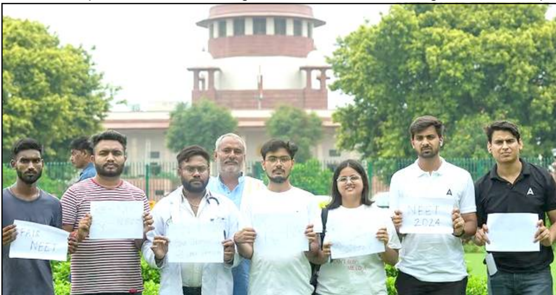
July 18, 2024 nü New Delhi nung Supreme Court-i NEET paper leak ken o angadanga mapang nung kaketshirtemi longkak aitdang tangokba noksa nung angur.

New Delhi, July 18 (Agencies): NEET-UG question paper leak asüba ken o dak sendakba nung Brihostibarnü Central Bureau Of Investigation (CBI)-i AIIMS Patna nungi MBBS student pezü puogo, ta ketdangsertemi metetdaksü.