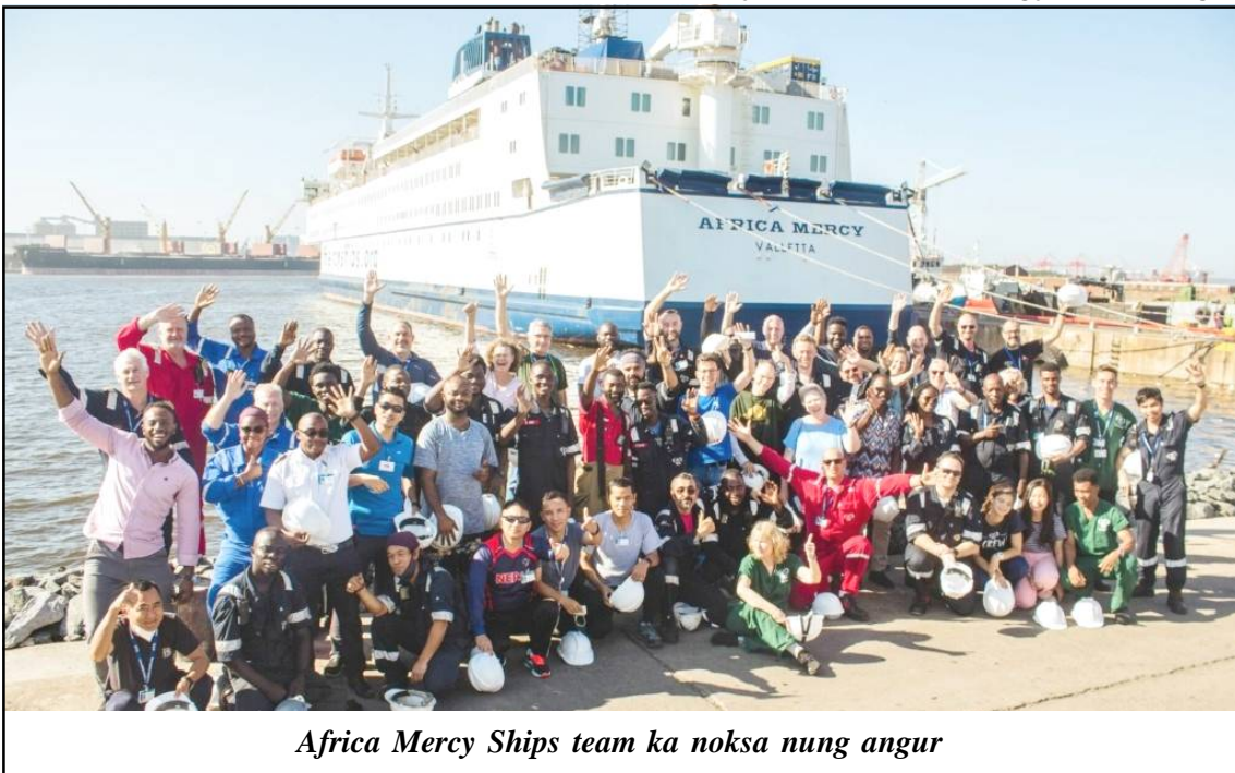
Africa Mercy Ships team ka noksa nung angur

July 18, 2024: Tawa Khristan medical charity telok ana-Mercy Ships aser Mission Aviation Fellowship (MAF) nati maneni longjemmer inyaksü asoshi tezüngzüktep tasen ka agishiba ajanga Africa tesem aika nung timtemertemi medical teyari angutsü.