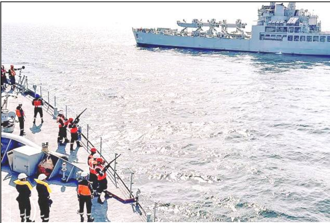
July 19, 2024 nü Kochi nung Royal Saudi Naval Forces (RSNF) indang King Fahd Naval Academy nung training agirtemi Indian Navy indang First Training Squadron (1TS) nung Afloat Training Course agidang tangokba noksa nung angur.