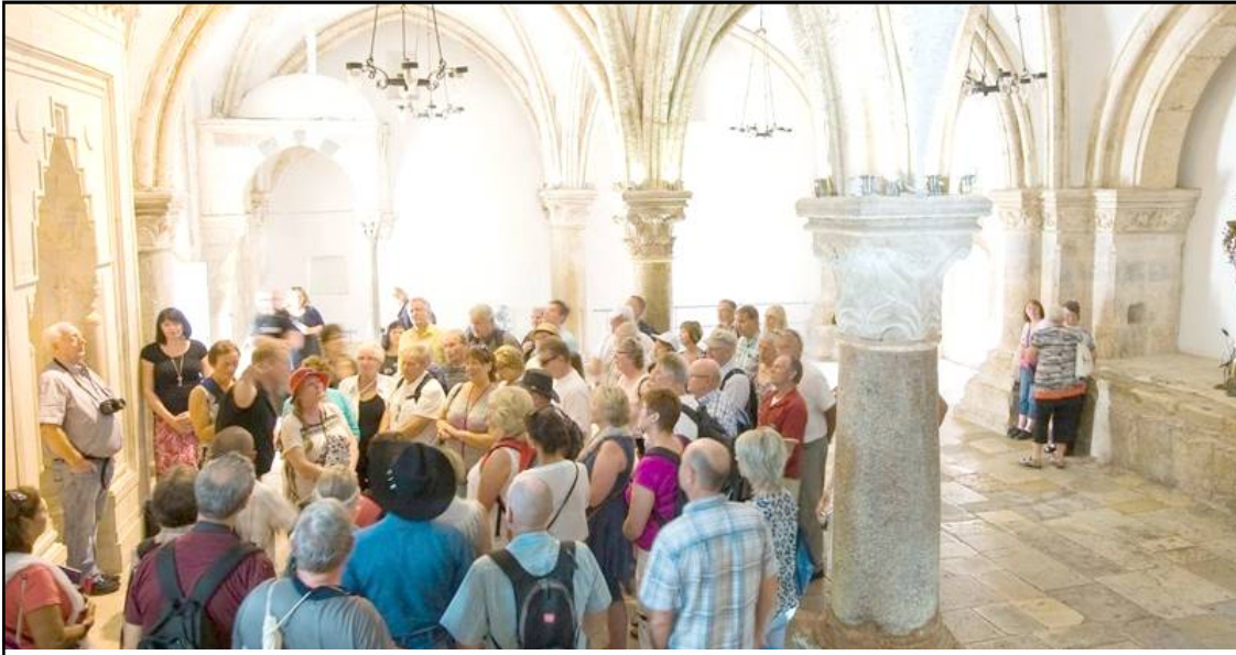
Khristantemi Cenacle semdangba mapang tangokba noksa ka angur.

Jerusalem, July 19 (Agencies): Yisu Khristai Pa nütüngtem den tatembangbuba chiyungba Kibuba Benjung agiba ya Laishiba otsü nung kanga tongtibang otsü ka lir.