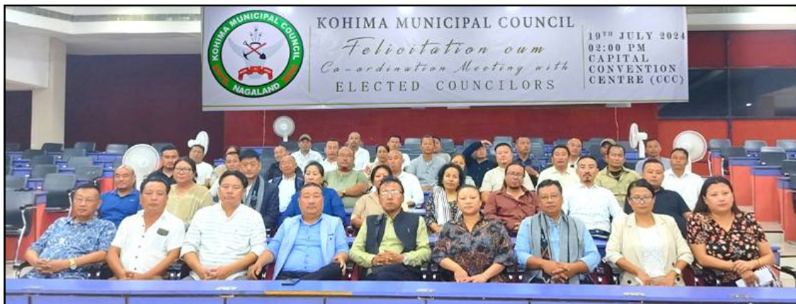
Kohima Municipal Council (KMC) indang Councillors aser staff tem nem tenüngsang agütsüba aser shisadokden senden ka Capital Convention Centre, Kohima nung July 19, 2024 nü agia liasü.

Dimapur, Chiteni/July 19 (TYO): Kohima Municipal Council (KMC) indang Councillors aser staff tem nem tenüngsang agütsüba aser shisadokden senden ka Capital Convention Centre, Kohima nung July 19, 2024 nü mena liasü.