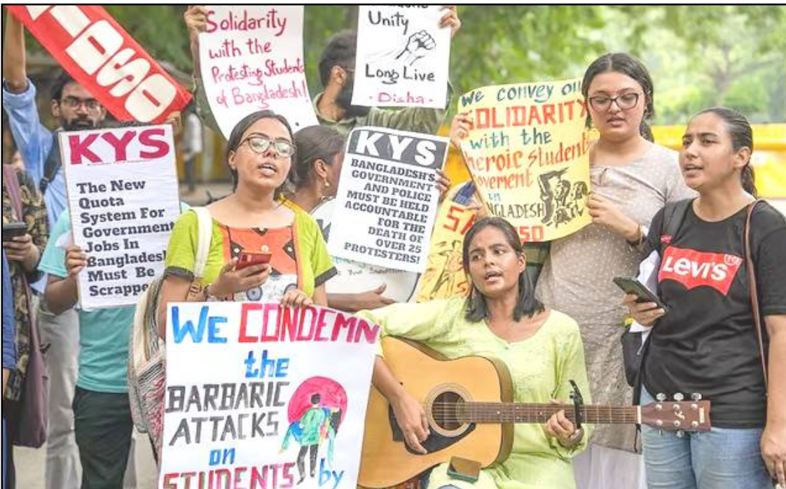
New Delhi, July 19, 2024: Bangladesh nung longkak aiter kaketshirtem madak sepaitemi tashiyim amshiba anema Hokolbarnü New Delhi nung kaketshirtemi longkak aitba noksa nung angur.

benokra Karnataka nung aliba business aika Tamil Nadu aser Kerala ama kidanger state temi belener aotsü, ta ashi. Haryana nunga tamalen sorkar kati iba ama ozüing benoktsü meranga liasü saka Supreme Court-i magizük, ta paisa metetdaksü. Hombarnü Karnataka state Cabinet-i "Karnataka State Employment of Local Candidates in Industries, Factories, and Other Establishments Bill, 2024" agizüka liasü, aser iba ozüing kübok nija company tem nung mapa balala Kannadiga nungertem atema mekazüktsütsü. Iba ozüing kübok industry, factory mesüra nija establishments-i management categories nung candidate shilem 50 bo lisopurtem (Karnataka nunger) shimsüla aser non-management categories nung candidates shilem 70 lisopurtem shimsüla. Iba ozüing aija industry lenirtem aikati, iba ama ozüing ya benokra Bengaluru nung alir mapa nung mongintem aika samatsü, ta aija liasü. Tech company NASSCOM-ia parnoki Karnataka nungi company belentsü ta ashiba den külemi industry balalai aitsüba sülen state sorkari iba bill mapa küma mebenoki alitsü lemtetogo.