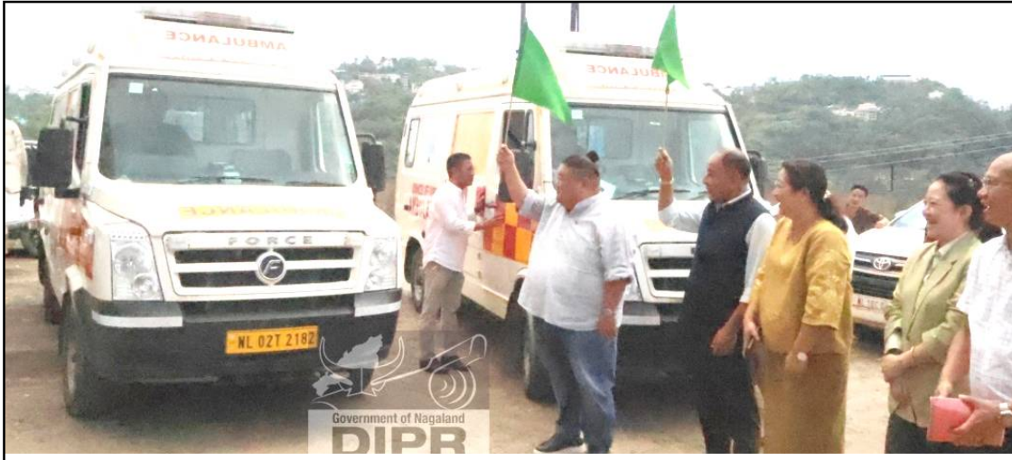
Temjen Imna Along-i Primary Health Centre atema Ambulance ana tenzüksüba noksa nung angur.

Dimapur, Chiteni/July 20 (TYO): Ministry of Tribal Affairs-i senotsü teyari agüja Tribal Affairs Department, Nagaland-i, Primary Health Centre (PHC) Mangolemba Sub-Division atema Ambulance ana tenzüksüba sentong July 19 nü Directorate of Tribal Affairs nung agiogo.