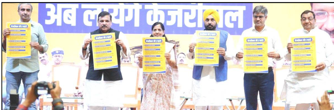
July 20, 2024 nü Haryana kübok Panchkula nung Kejriwal tenangzükba pongu sangdongba sentong nung Delhi Chief Minister kinüngtsü, Sunita Kejriwal, Punjab Chief Minister Bhagwant Mann na den Aam Aadmi Party (AAP) lenirtem- Sanjay Singh aser Sandeep Pathak nunger tangokba noksa nung angur.

New Delhi, July 20 (Agencies): Haryana assembly election atema Honibarnü Delhi Chief Minister Arvind Kejriwal kinüngtsü, Sunita Kejriwal-i "Kejriwal tenangzükbatem" pongu metetdaksü.