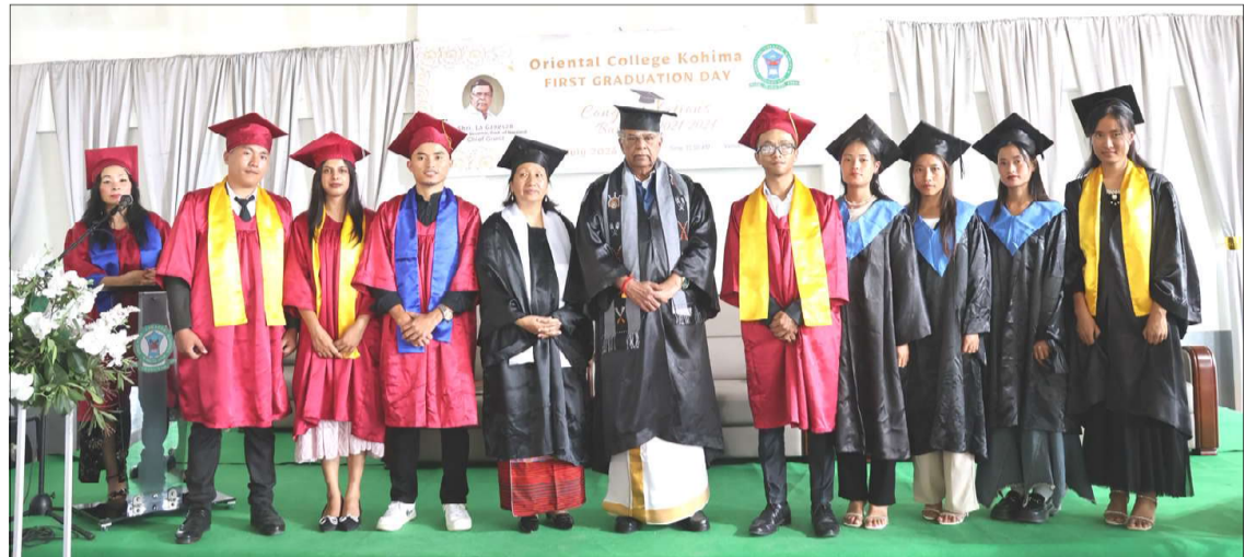
Nagaland Governor La Ganesan-i Oriental College Kohima mezüngbuba Graduation Day nung adendang agiba noksa ka angur.

Kohima, July 20, 2024 (TYO): Shisaliok ya kija dang takok angutsü atema dang masü saka loktiliba tajungba akümtsü hadir ka lir ta Nagaland Governor La Ganesan-i ashi. Honibarnü Oriental College Kohima nung mezüngbuba Graduation Day amongdang Ganesan-i graduates 91 dang iba ya ashi. "Nenok tanü nungi mera tasen agia aodang, shisaliok ya nija takok angutsü atema dang masü saka loktiliba tajungba akümtsü asoshi lir. Nenoki akangakanga noktakba, ochishiba aser aria bilemba ajanga nenok taküm aser wadang jangjatsütsü" ta pai ashi. Alima nung khuret aser tayongzükbatem ajurur anungji asenok tangatetba nung