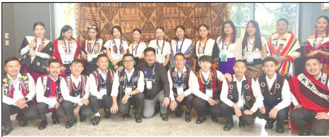
Nagaland Madrigal choir

Dimapur, Chiteni/July 21 (TYO): 13buba World Choir Games 2024 nung Nagaland nungi Madrigal Choir-i gold medal ang ngua India nem kongnang tetushi bener arutsüogo. Iba tetoktepba ya New Zealand nung agia liasü. Parnoki takok tajung anguba sülen Nagaland Chief Minister Neiphiu Rio-i X ajanga parnok nem tenüngsang agütsüogo. "13th World Choir Games 2024, New Zealand nung India atema Gold Medal ana ngutsüba atema Nagaland Madrigal Choir nungi kentenertem nem tenüngsang agütsür. Linük nem konang tetushi bener aruja nenoki onok tejangraba ataloktsüogo aser onok ajak kanga nema dangdaktsüogo. Tarutsü