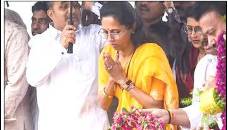
July 21, 2024 nü Satara district nung NCP (SP) Working President, Supriya Sule aser tangartemi Maharashtra nung mezüngbuba chief minister inyaksang, asür Yashwantrao Chavan nem akhüm agütsüdang tangokba noksa nung angur.

Abhishek-i, West Bengal Lok Sabha election nung BJP-i tamakok mejungi angu, kechiyong parnoki takok angutsü atema central agencies aser sen tashi dak metaloker, ta ashi.