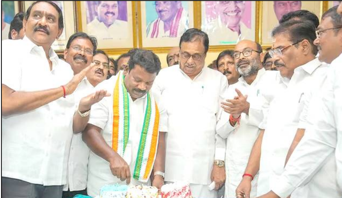
July 21, 2024 nü Chennai nung Tamil Nadu Congress Committee Tir, K. Selvaperunthagai den party lenirtemi Congress National Tir, Mallikarjun Kharge asoba anogomong amongdang tangokba noksa nung angur. Amongnü Kharge arrshi küm 82 jungogo.

Mongolbarnü Union Finance minister, Nirmala Sitharaman-i Union Budget benoktsü aser Hombarnü Economic Survey benoktsü.