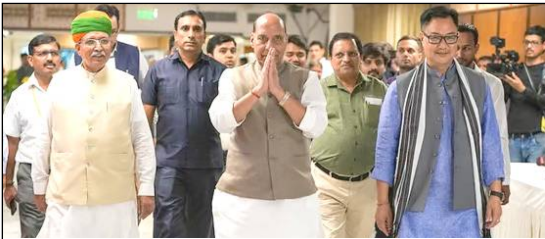
July 21, 2024 nü New Delhi nung Union Defence Minister Rajnath Singh, Union Minister for Parliamentary Affairs Kiren Rijiju aser Union Minister of State for Parliamentary Affairs, Arjun Ram Meghwal nung party ajak senden nung adentsü atema aodang tangokba noksa nung angur. Tzüngluruwa mongpu Parliament senden tenzüksü anogo ka lia sorkari party ajak senden ka ayongzüka menogo.

New Delhi, July 21 (Agencies): Tzüngluruwa mongpu Parliament senden tenzüksü jelia Amongnü sorkari party ajak senden ka ayongzüka amen aser iba senden nung mendenbubaji Union defence minister, Rajnath Singh liasü.