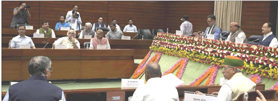
Parliament budget session tenzüksü lia July 21, 2024 nü all-party senden ka ayonga amendang agiba noksa angur.

Ajisüaka, Andhra Pradesh nung BJP den yariteper aser YSRCP den tokteper Telugu Desam Party (TDP)-ibo onük atema ola kecha madok ta Congress lennir Jairam Ramesh-i ashi.