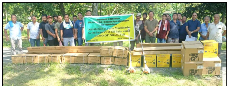
Agriculture Department ajanga Tuli area nung palm oil lu ayimer nem osettsüset lema agütsüba mapang tangokba noksa nung angur.

Dimapur, Chiteni/July 22 (TYO): Agriculture Department ajanga Tuli area nung palm oil lu ayimer nem July 19, 2024 nü Brush cutter, water pump, oil palm cutter, harvesting machine aser aluyimer nüngdakba oset aika lema agütsü.