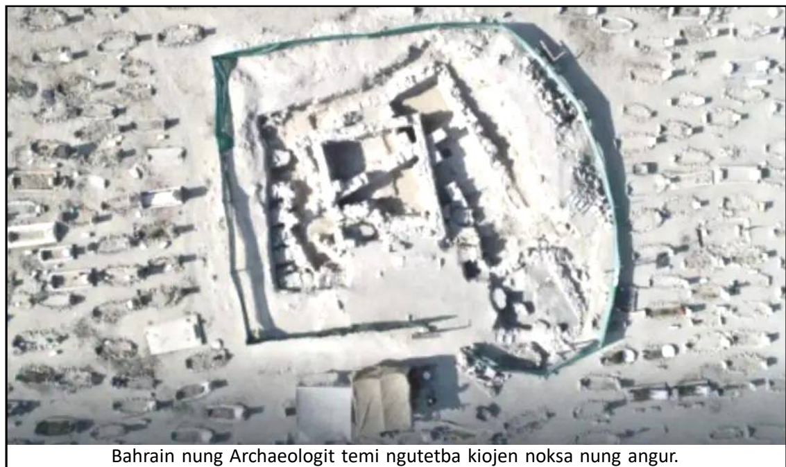
Bahrain nung Archaeologit temi ngutetba kiojen noksa nung angur.

July 22, 2024: Archaeologist temi Arabian Gulf nung akhidang asüba Khristan kiojen ka ngutetogo, aser ibaji ajanga Aso 7buba mapang Islam yimsü meprokdangyonga iba tesem nungji Khristantem liasü ta jangjar, ta osang ka ajanga metetdaktsü.