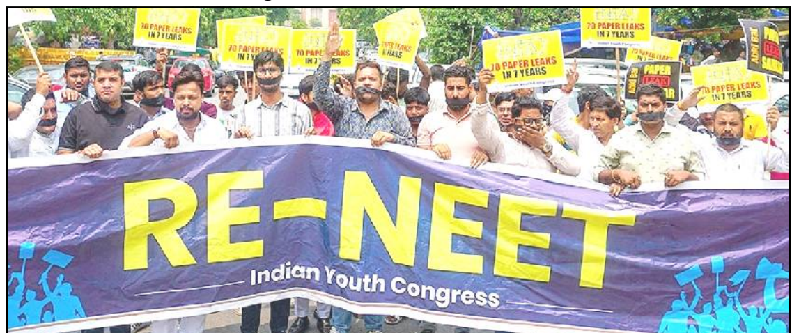
July 22, 2024 nü New Delhi nung Indian Youth Congress (IYC) züngsemtemi NEET exam agishitsü takhangba agüja longkak aitdang tangokba noksa nung angur.

New Delhi, Chiteni/July 22 (Agencies): NEET-UG mangatettep ken o dak sendakba nung Centre sorkari mimshitsüsa kecha mali, ta Hombarnü Union education minister, Dharmendra Pradhan-i Parliament nung metetdaksü.