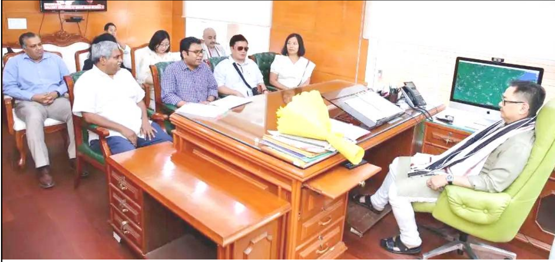
July 20, 2024 nü New Delhi nung Khristan lenirtem telok kati Minority Affairs Minister, Kiren Rijiju ajurudang tangokba noksa nung angur.

New Delhi, Chiteni/July 22 (Agencies): July 20, 2024 nü India nung Khristan lenirtem telok kati Centre sorkar dang tang state 11 nung benoka aliba anti-conversion ozüngtem agienang, ta takhangba agütsüogo.