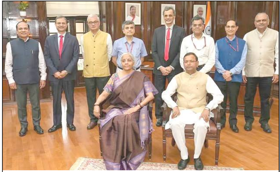
July 22, 2024 nü New Delhi nung Union Finance Minister, Nirmala Sitharaman leniba nung budget team-i Union Budget renemba sülen tangokba noksa nung angur.

Aluyimer lenirtem ajururtem rongnung Shiromani Akali Dal nungi Harsimrat Kaur Badal, Congress nungi Amarinder Singh Raja Warring aser Sukhjinder Singh Randhawa na aser AAP nungi Malvinder Singh Kang nung densema liasü.