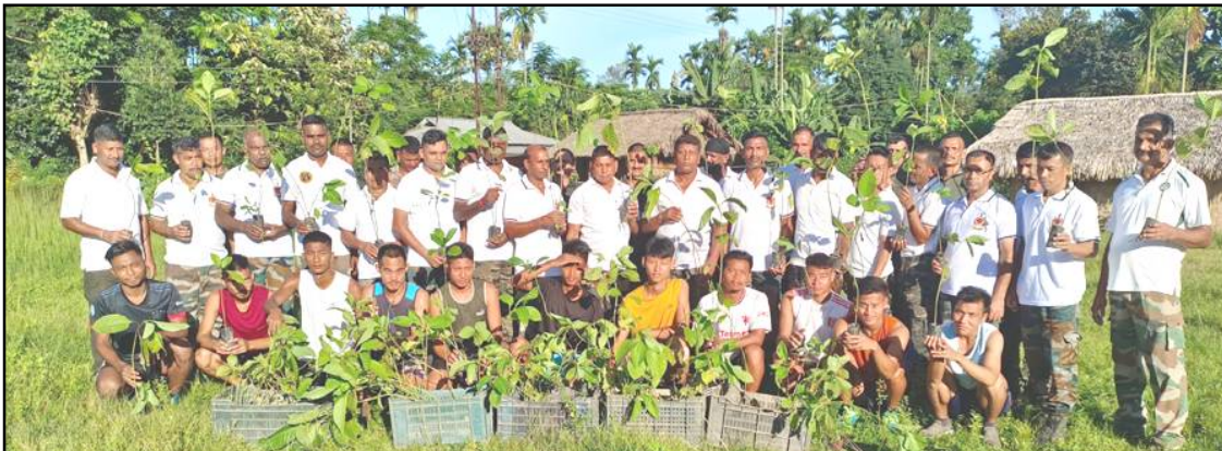
Süngdong-lidongji tongtipang aser jenjang tulutiba sempet libajen wazüka ayutsü nungdaker ta angatetdaksütsü nukjidong nung Assam Rifles temi July 28, 2024 nü süngdong atemba sentong ayongzüka liasü. Hopta piyong süngdong atemba maparen inyaka aruba nung shilem ka ama aser Assam Rifles temi region nung takumsangnu lirumedema lidaksütsü asoshi yimya balala amshiba den lirumedema iba sentong ya ayongzüka liasü. Iba anogo tesem balala nung süngdong 550 shi atem.

liasü. Mahanta-i kaket tajung aika zülua lir aser item rongnung "Confronting the State: ULFA's quest for Sovereignty" aser "Citizenship Debate over NRC and CAA" dena lir.