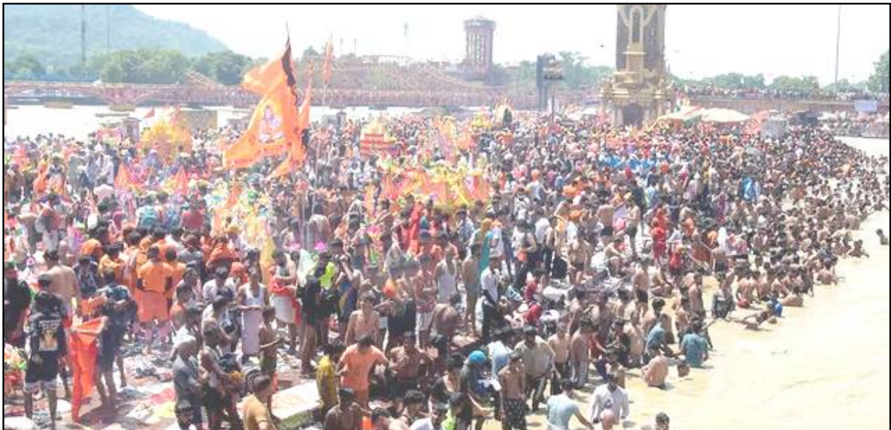
Haridwar, July 28, 2024: Hindu nung temeshi ita ‘Shraavan’ nung temeshi aini aoertemi Haridwar nung aliba Ganga ayong nungi temeshi tzü atadang tangokba noksa nung angur.