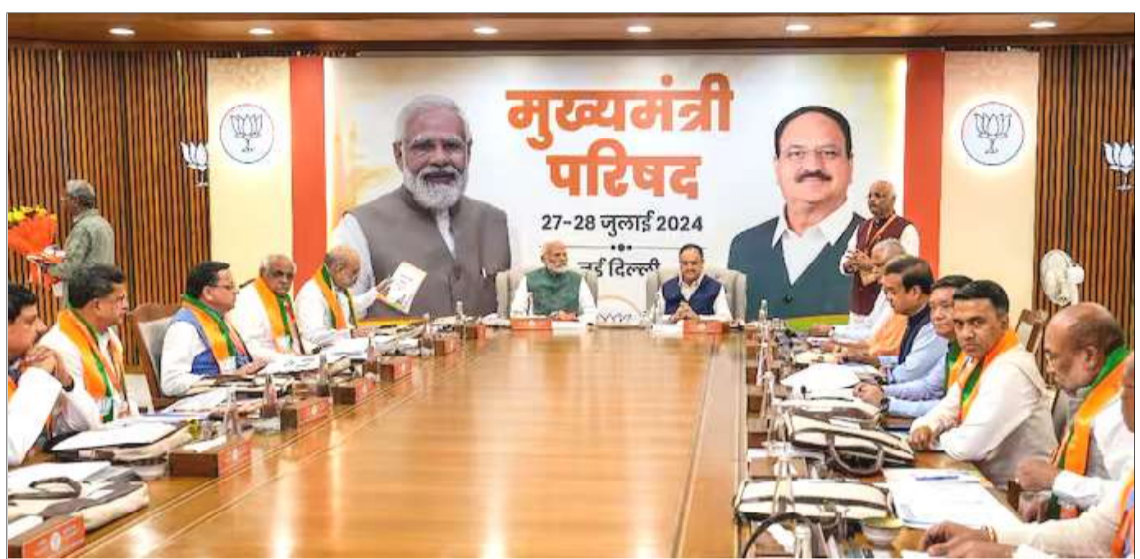
BJP headquarters, New Delhi nung Prime Minister Narendra Modi den Union Home Minister Amit Shah aser BJP National President JP Nadda nungeri NDA-i sorkar yimsü asüba state tem nungi chief minister tem den senden amenba angur.

New Delhi July 28, 2024 (Agencies): Prime Minister Narendra Modi-i BJP sorkar aliba state nung chief minister tem dang central government schemes mapa küma inyaktsü tetuyuba agütsüogo.