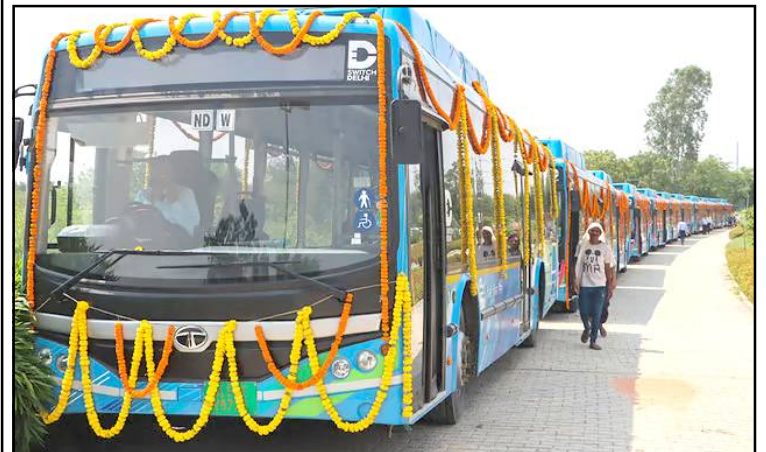
New Delhi nung Sarai Kale Khan anasa Bansera nung battery agi inyaksangshiba bus tem tenzüksüba mapang tangokba noksa nung angur. Lt Governor VK Saxena-i, battery bus 350 tenzüksüogo.

Osangbenertem den sensaksemba mapang Adhikari-i ashiba agi, Speaker-i constitutional provisions tem anema inyaker. “Pa Speaker menden nung mener political party ka tenüng nung inyaksangshir. Pai opposition ola remseptsütsü meranger. Pai tongtibang ken o tem nung House nung jembitsü memelar. Anungji onoki pa anema no-confidence motion ka Assembly secretary nem agütsüogo,” ta Adhikari-i ashi.