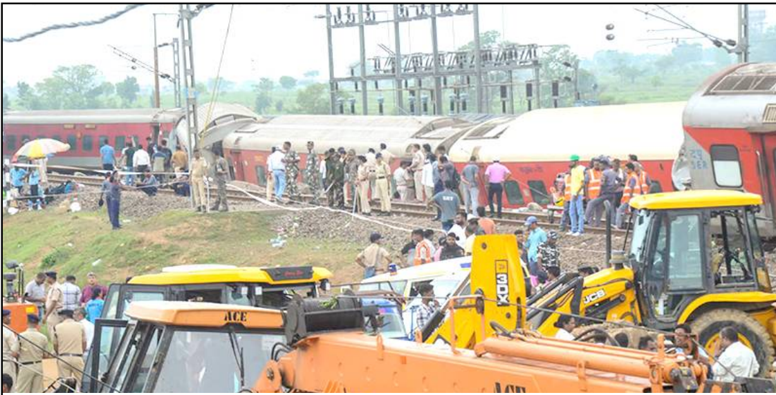
Jharkhand nung Seraikela-Kharsawan district kübok Badabamboo anasa Howrah-Mumbai Mail train tsükokba sülen tekümzükba maparen balala inyakba noksa nung angur. Iba lendong nung nisung ana asü aser nisung 20 yirua liasü.