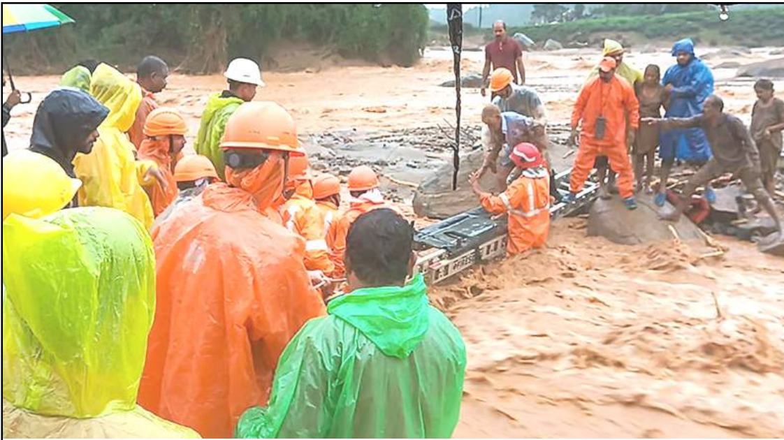
Kerala kübok Wayanad district nung Mongolbar anepdang anentsüh tulu ka aluba sülen NDRF personnel temi nürburtem kümzüksü atema jenjang agiba noksa nung angur. Indian Army, Air Force, NDRF asertanga sorkar agency tem yoka tekümzükba maparen inyakdar.