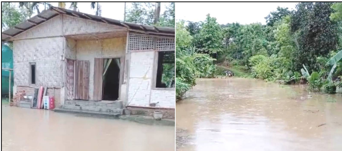
Tuli nung tzünglu kanga sashia aruba sülen Aopenzu nung tzümetsüng adoka aliba noksa nung angur. Tuli Sub-division kübok Aopenzu yimdam Mongulbarnep nungi tzümetsüng adoka lir. Iba tzümetsüng ajanga tzülü 10-15 tsüngta raksatsüogo aser yimtsüngi aoba lenmang aser ki kar tera raksatsü, saka tia ka nisung asü-amababo mali.

Aluyimer tem yaria parnok takum tanaben ajungketja aluyimba maparen nung asendenshija yaritsü kanga tongtipang lir. Anungji sorkari tekeratiba nung parnok den akokba lenmang agi yariteptsü ajungshir, ta Western Sümi Hoho ajangasa ashi.