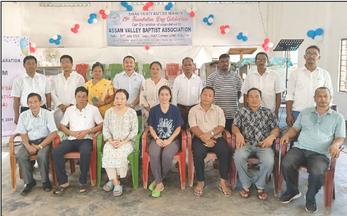
Nakachari, July 31, 2024: Bodhbarnü Nakachari nung Assam Valley Baptist Mission (AVBM) 19buba Foundation Day anogomong sentong nung adener kar tangokba noksa nung angur.

Nakachari, July 31 (TYO): Day anogomong sentongji 2005 kum tentetba Assam Valley Baptist Mission (AVBM) agi kasa nungja nung Association inoksema "Assam Valley Baptist Association (AVBA)" kumogo. July 31, 2024 nü AVBM 19buba Foundation Day anogomong nung Association kumogo. AVBM indang Foundation