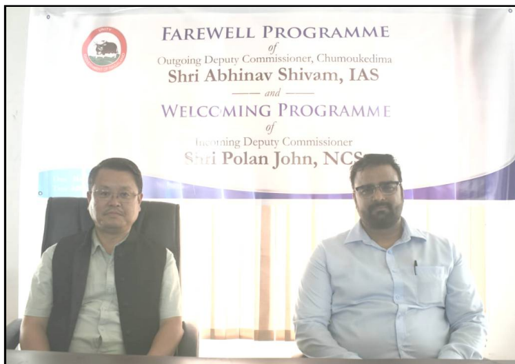
DPDB Hall, DC Office, Chümoukedima nung July 31, 2024 nü Deputy Commissioner, Chümoukedima, Abhinav Shivam, IAS den tepila sentong agiba mapang tangokba noksa ka nung pa den DC tasenba Polan John, NCS angur.

Dimapur, Chiteni/July 31 (TYO): Chümoukedima indang Deputy Commissioner menden yutsür aosang Abhinav Shivam, IAS nem akum agüja tepila sentong ka July 31, 2024 nü DPDB Hall, DC Office, Chümoukedima nung agia liasü. Deputy Commissioner, Chümoukedima, Abhinav Shivam, IAS ajanga iba sentong nung tepila o jembidang pai mapa nung ajangshibatem lemsatapa liasü.