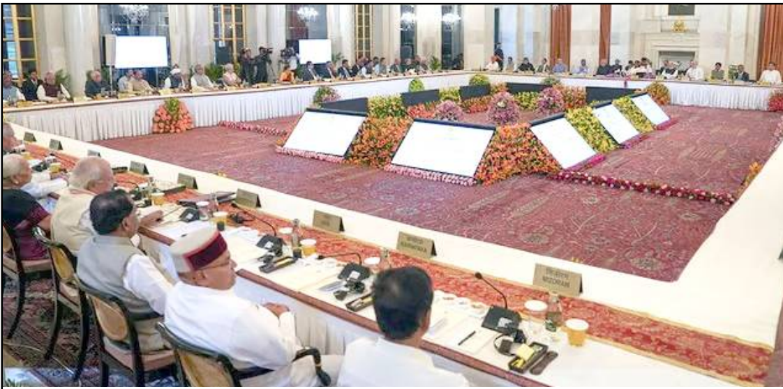
August 02, 2024 nü Rashtrapati Bhavan nung anogo ananü Governor tem senden tetenzük sentong nung linük Tir Droupadi Murmu, tatong tir Jagdeep Dhankhar, Ato kilonser Narendra Modi, Union Home Minister Amit Shah, Union Ministers- Dharmendra Pradhan, Ashwini Vaishnaw, Mansukh L. Mandaviya aser National Security Advisor, Ajit Doval nung den state balala nungi Governor tem adenba noksa nung angur.