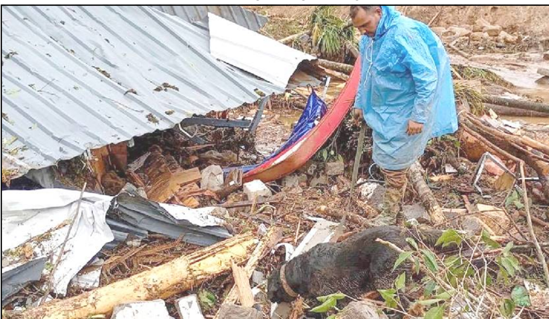
August 02, 2024 nü Wayanad district nung anentsüh lendong tulu atalokba tesem nung Army temi azü amshia tasü mang bushidang tangokba noksa nung angur.