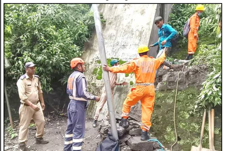
August 2, 2024 nü Rudraprayag nung tzunglu kanga aruba ajanga gari lenmang aika tzu agi ponger aoba sülen NDRF sepaitemi temeshi aini aoertem kümzükba noksa nung angur.

Central Sector Scheme kübok AIIMS tasen 22 agizükogo aser iba nungjagi AIIMS 19 nungbo undergraduate courses tenzükadokogo, ta lai metetdaksü.