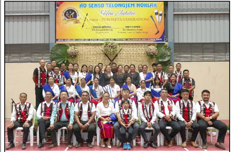
Hokulbarnü Multi Discipline Sports Stadium, Noklak nung Ao Senso Telongjem Noklak Hon Jubilee amungdang tangokba lokti noksa ka yangi angur.

Dimapur, Luroi/August 02 (TYO): Züroketa (Veneration) omen nung ajemdaker Ao Senso Telongjem Noklak Hon Jubilee mung sentong August 2, 2024 nü Multi Discipline Sports Stadium, Noklak nung anepdang 11:00 ako nungi agia liasü.