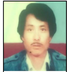
ASO : 07/05/1945 ASU : 04/08/1999