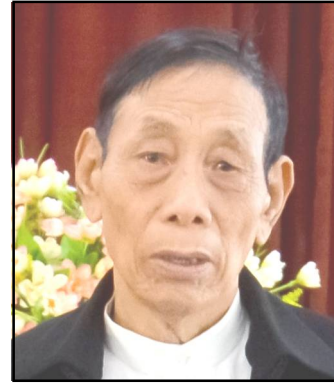
Tasüba anogo - 28 July 2024

Onoki teti meima aliba tsürabur asür I. Moea Pongener (Ungma), ajungbena alima nungi piladang shirnokisa mangyim jashi lemsatepa sarasadem, nübu, rongsen aser tesünep o agi onok mulung süngzüka yariogo, nenok ajak dang kanga pelaba lemsateper. Onoki nenok nem meyipa agütsütsü kecha maka, saka Tulusang Tsüngremi nenok taküm aser kibong tali moajangma.