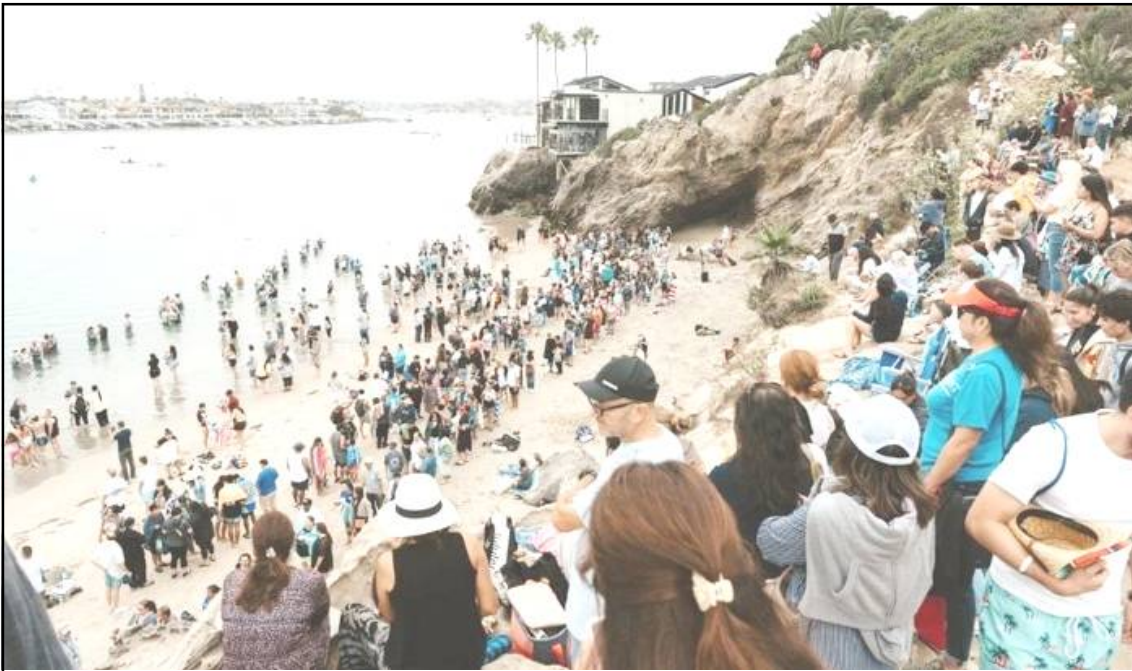
Corona Del Mar, California nung aliba Pirate's Cove Beach nung Jesus Revolution Baptism agidang tangokba noksa nung angur.

August 03, 2024: Sayutsingir Greg Laurie indang 2024 Harvest Crusade nung nisung meyrjang aika adenba sülen July 27, 2024 nü Corona Del Mar, California nung aliba Pirate's Cove Beach nung Jesus Revolution Baptism tanabuba sentong nung nisung 2,000 shi baptiogo.