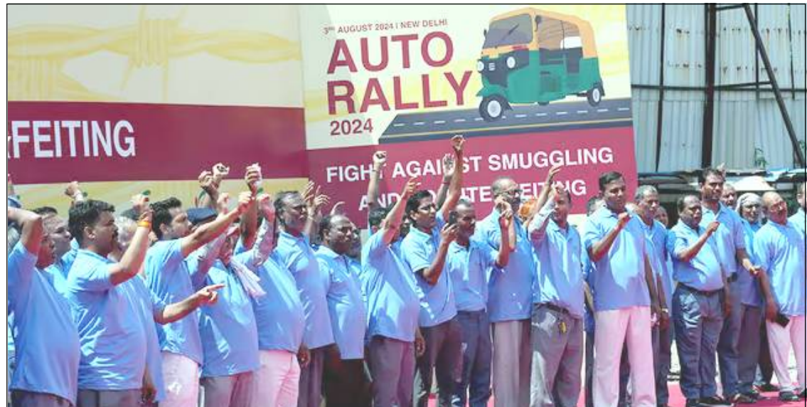
August 03, 2024 nü New Delhi nung Auto Rally nung shilem agirtem noksa nung angur. Sen taila amshiba aser ozüing alema shibelenba anema awareness agütsütsü nükjidong nung ayongzükba sentong ya BJP MP, Praveen Khandelwal-i tenzüksü.

Iba conference nükjidong ya research agiba institutes aser universities longjemdaksütsü, national aser international level nung mapatong balala renemtsü, India nungeri aluyimba nung ajangzüktebatem sayatsü aser digital agriculture aser sustainable agri-food systems sayatsü nükjidong nung ayongzük.