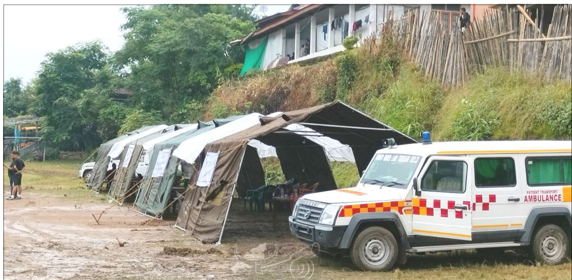
Tuensang District Disaster Management Authority-i August 3, 2024 nü Tuensang Village, C/ Khel Local ground nung relief camp ka lapokba angur. Tuensang kübok Phenjang sector aser NST Sector nung anentsüh ajanga nisung 768 dak kongshirtem asoshi iba relief camp lapoktsü aser mezüng anogo nung nisung 64 tashi aruogo ta osang angazüker. Külen, anentsüh nung yirur kibong ka Tuensang District Hospital nung anioka anepaludar.

Minister Amit Shah aser Union Minister Kiren Rijiju nunger dang pelaba metetdaksü. Phangnon Konyak ya Nagaland nungi mezüngbuba Rajya Sabha MP lir aser Centre sorkar committee nung la shimokba ya northeast atema kanga tongtipang lir. Iba committee ajanga India nung scheduled castes aser scheduled tribes atema inyaker.