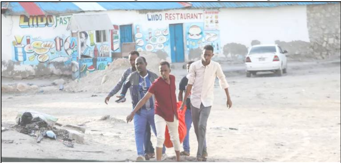
Somalia yimtiba Mogadishu kübok Lido Beach nung pei temang nung bomb alenoker pokdaktsür kati bomb pokdaktsüba sülen nüburtemi tetsür ka tasümgang bener aoba noksa nung angur.

Mogadishu, Luroi/August 3 (Agencies): Somalia yimtiba, Mogadishu kübok nungtugu tzüküm ka pei temang nung bomb aneloker pokdaktsürtem aser prangbong amshia amakba sülen nisung 32 süogo aser aika yiruogo.