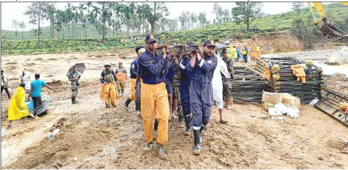
August 03, 2024 nü Wayanad district nung anentsüh lendong atalokba tesem nung tasumang bushidang tangokba noksa nung angur. Anentsüh lendong atalokba sülen tanü agi anogo pongunübuba kümzükba maparen inyakdar.