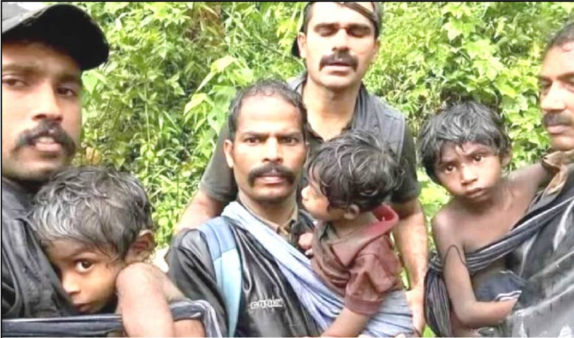
August 04, 2024 nü Wayanad district nung Kalpetta Range forest sepaitemi anentsüh lendong atalokba tesem nungi kümzükba tanurtem ajunger aliba noksa nung angur. Wayanad anentsüh lendong nung nisung 300 dak tema süogo.