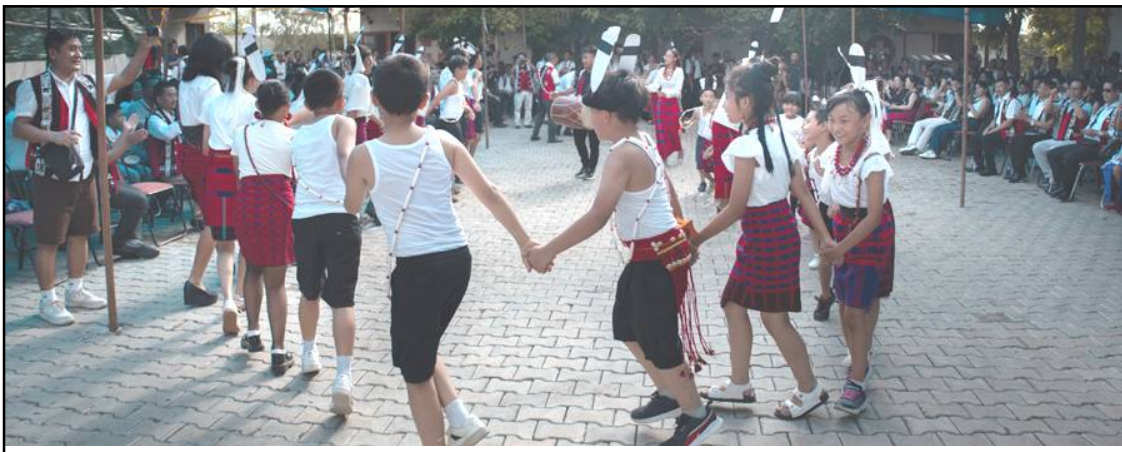
Delhi Ao Senso Telongjem-i Tsüngremmong benjong ayongzük amungdang tanurtemi yartsüngsangba noksa angur.

Dimapur, Luroi/August 04 (TYO): Pei tasoli nungi pilar süaka temelenshi aliba tensa mapang ka nung sobaliba wazüka ayutsü nükjidong nung Delhi Ao Senso Telongjem (DAST) ajanga August 3, 2024 nü Tsüngremmong munga liasü.