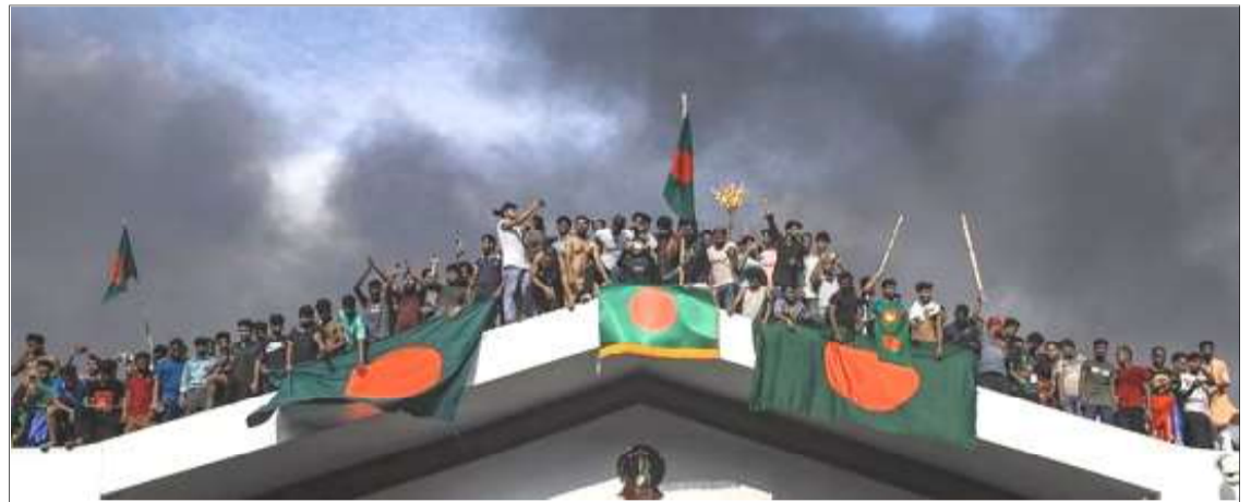
Bangladesh prime minister Sheikh Hasina-i menden yutsüba sülen August 5, 2024 nü Kolkata nung India nung jenoka aliba Bangladeshi nungertem benjungtepba noksa nung angur.

New Delhi, August 5, 2024 (Agencies): Sheikh Hasina-i Hombarnü Bangladesh Prime Minister menden nungi sodi agi aser linük toktsür jena arur India nung jenoka lir.