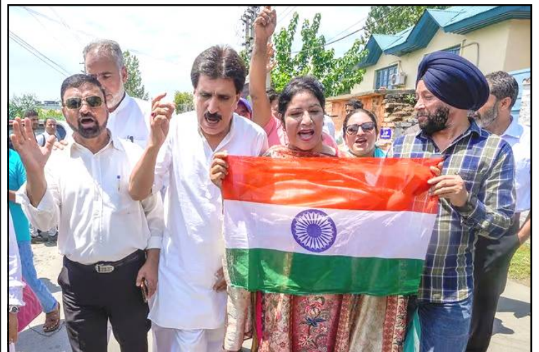
Srinagar, August 05, 2024: Jammu & Kashmir nung Arrla 370 agienba sülen küm 5 ajungba anogomong nung Srinagar nung BJP züngsemtem benjungtepba noksa nung angur.

Kerala state sorkari Wayanad district kübok Mundakkai region nung anentsüh lendong nungi kümzükertem atema jila tasen ka tentetsütsü, ta metetdaktüogo.