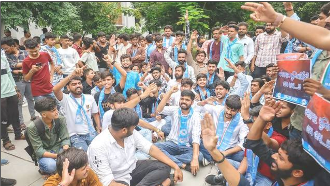
Ahmedabad University nung BA-BCom atema fee sen lakh 4.60 meshiba anema August 5, 2024 nü Ahmedabad nung National Students Union of India (NSUI) züngsemtemi longkak aitba noksa nung angur.

Paisa, "August 5 anogo ya temzüng alema aser ozü ng alema lir. August 5, 2019 nü BJP-i Jammu & Kashmir nüburtem ashioktü. Temzüng sendokba ajanga BJP-i temzüng tenü ng menü ktsü aser J&K den tesendaktep raksa," ta metetdaktü.