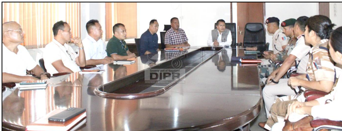
Chümoukedima nung Independence Day anogomung atema August 5, 2024 nü senden amendang tangokba noksa nung angur.

Dimapur, Luroi/August 05 (TYO): Tan ita Independence Day amungtsü aliba dak sendakba nung senden ka Deputy Commissioner, Chümoukedima indang Conference Hall nung August 5, 2024 nü senden ka mena liasü.