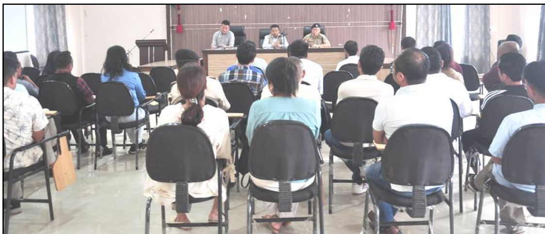
78 buba Indian Independence Day anogomung atema Deputy Commissioner, Mokokchung indang Conference Hall nung August 5, 2024 nü mapalem aser shisadokden senden ka nung Deputy Commissioner Mokokchung, Thsuvisie Phoji-i jembiba noksa nung angur.

Dimapur, Luroi/August 05 (TYO): Aruya aliba 78 buba Indian Independence Day mera keta amungtsü nükjidong nung shisadokden aser mapa alemba senden ka Deputy Commissioner, Mokokchung indang Conference Hall nung August 5, 2024 nü mena liasü. Iba senden ya SDO (C) Shelly Kaitry lenisüba kübok agi, kong Deputy Commissioner Mokokchung, Thsuvisie Phoji aser Superintendent of Police, Mokokchung, Vesupra Kezo