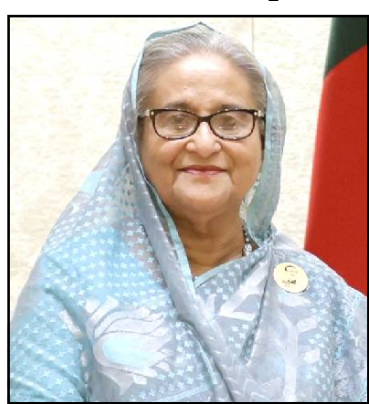
Dhaka-i aotsü ayongzüka liasü.

Hombarnü yimti-yimtung nung sepaitem senzüa liasü. Ajisüaka longkak aiter tem tekong meranga nokdak aser