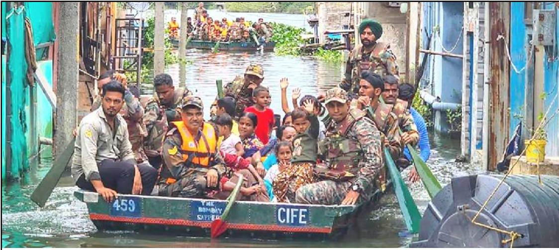
August 05, 2024 nü Maharashtra kübok Sangli district nung sepaitemi tzümetsüng lendong nungi nisungtem kümzüka anir aodang tangokba noksa nung angur.