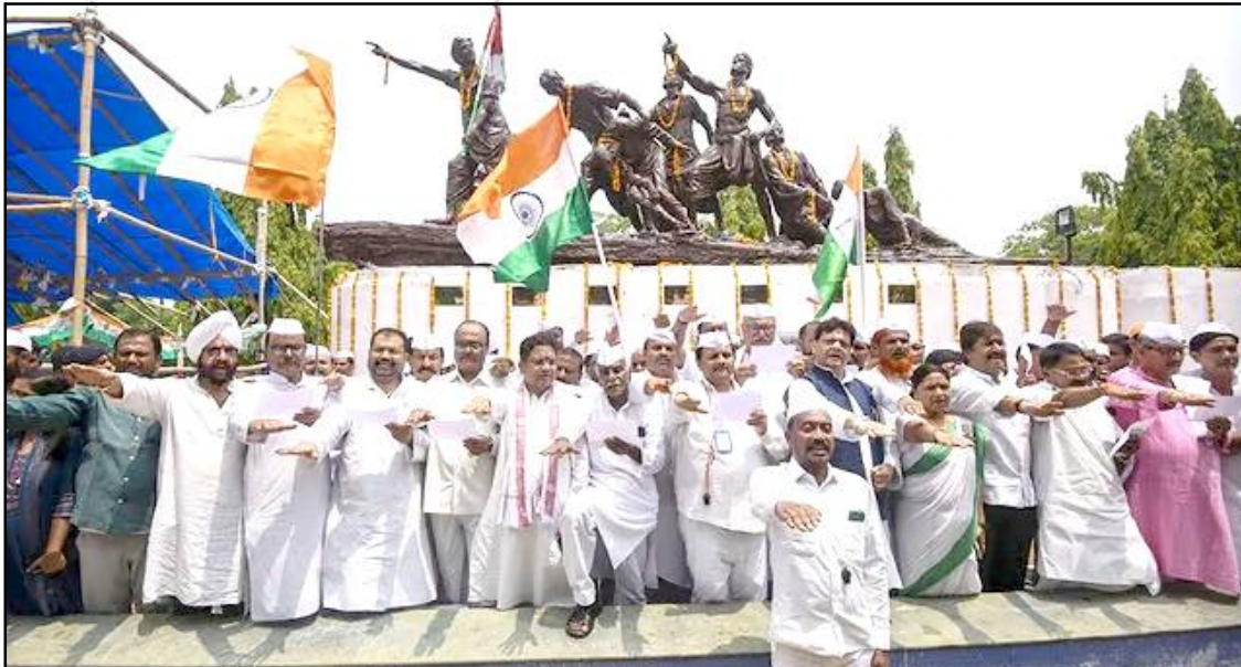
August 09, 2024 nü Kranti Diwas (Quit India Movement) anogomong nung Patna nung Bihar Congress lenirtemi Martyrs' Memorial nung tenangzükba agidang tangokba noksa nung angur.

Russia Tir, Putin-i Ato kilonser Modi dang Russian army nung aliba India nunger ajak anentsütsü aser chioktsü ta nangzükogo, ta Jaishankar-isa metetdaksü.