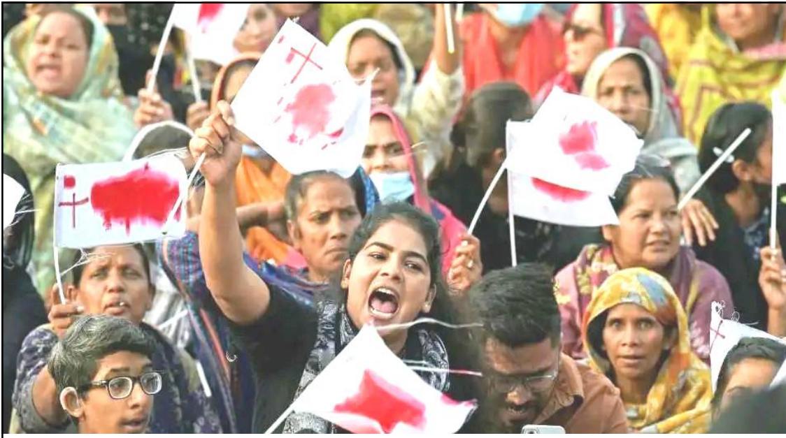
Yaküm August 19 nü Pakistan kübok Jaranwalla nung Tenla ki aika rongdoktsüba sülen anogo asemnü lir Khristantemi longkak aitdang tangokba noksa nung angur.

August 09, 2024: Pakistan nung Khristan tetsür anati Tsüngrem mezüngmeshiogo ta Muslim nunger kari tai tongloktsüba sülen Pakistan nung meimchir temeden atema inyakba telok kati ibaji sashia aitsüba den külemi sorkar ketdangsertem dang linük nung Khristantem densema minorities kümzüksü mepishi.