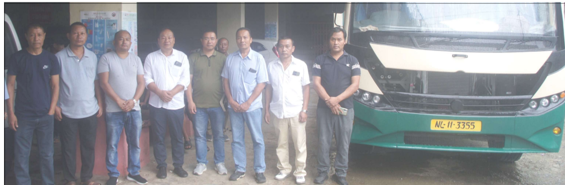
NST bus tasen ka meshitetba den Mokochung - Dimapur NST night bus service tenzükshiba sentong nung shilem agia adenertem külemi tangokba noksa nung angur. (Mokochung, 10th August, 2024)

Mokokchung, 10th Aug (TYO): Timtem kar aliba ajanga Mokochung nungi Dimapur aonung senzüba NST bus night service taküm January nungi anener liasüba Aug 10, 2024 aonung nungi tanaben asendenshia tenzükshigo. Iba mapa taneben tenzükshiba ajanga nüburtem jenti tajangzük angutsü imlar.