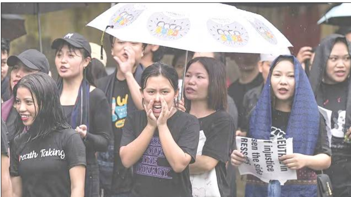
New Delhi, August 10, 2024: Centre sorkari Manipur nungi Assam Rifles sepaitem anitetsü telemtetba agiba anema Honibarnü New Delhi nung Kuki Students' Organization-i longkak aiddang tangokba noksa nung angur.