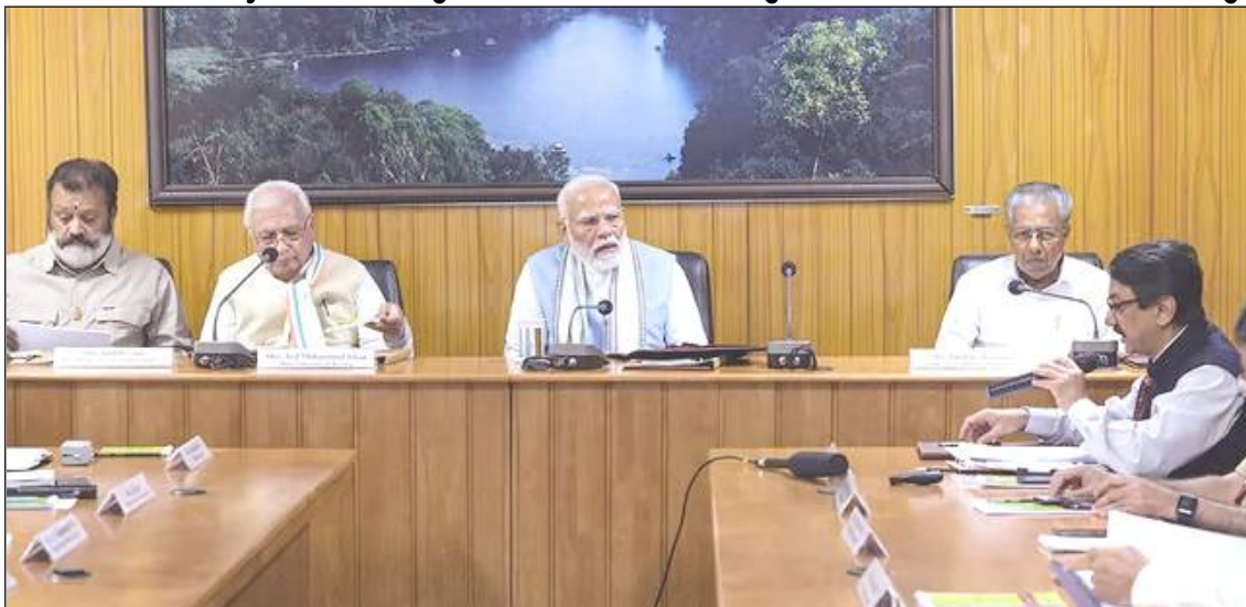
August 10, 2024 nü Ato kilonser Narendra Modi-i Wayanad district nung anentsüh lendong atalokba tesem semdangba sülen pai ketdangsertem den senden amendang tangokba noksa nung angur. Noksa nung Minister of State, Suresh Gopi, Kerala Governor Arif Mohammed Khan aser Kerala Chief Minister, Pinarayi Vijayan nungera angur.