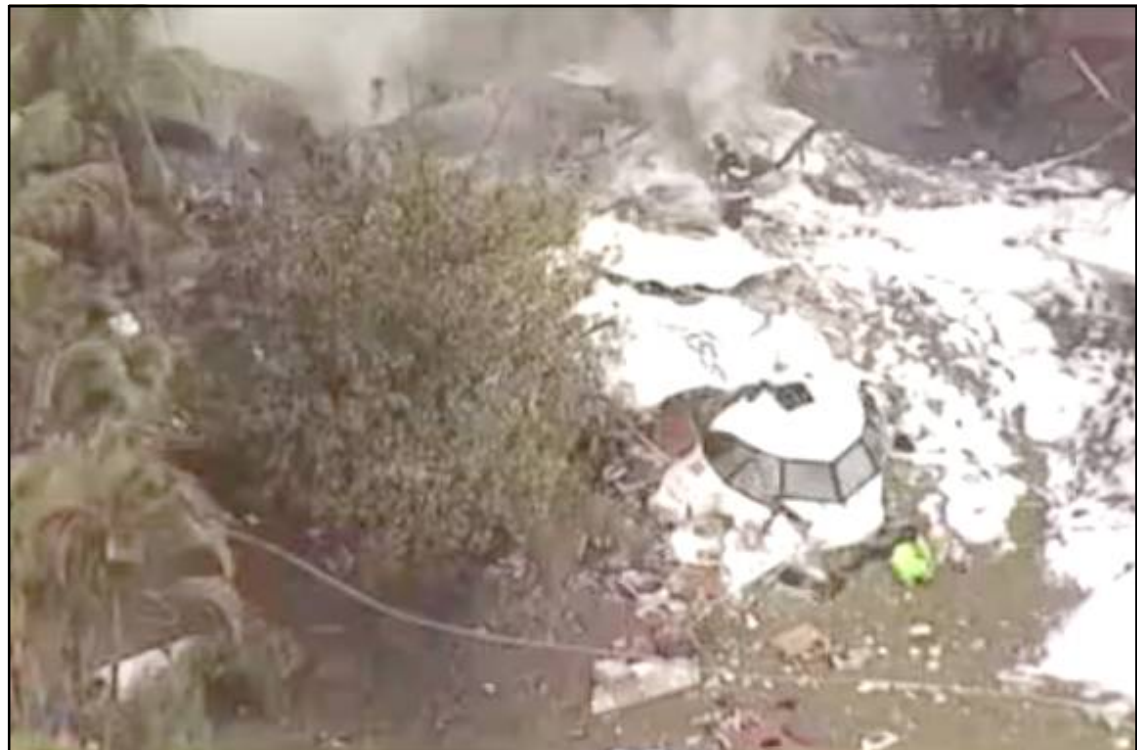
Hokolbarnü Vinhedo, São Paulo nung tayimtsü ka tsükokba sülen tayimtsü nung mena alir 62 prongla süogo. Voepass meyong tayimtsü ya Cascavel, Paraná, nungi São Paulo kübok Guarulhos International Airport-i oya aliba mapang 1:30 ako shi nung tsükoka liasü.

Yunus-i, Brehostibarnü caretaker administration indang "chief adviser" mapa agizükogo. Pai ita ishika tsüngda election aginer ta shiogo.