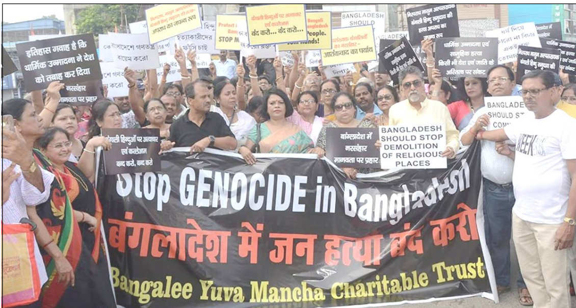
August 11, 2024 nü Ranchi nung Bangalee Yuva Mancha Charitable Trust (BYMCT) züngsemtemi Bangladesh nung Muslim nungertemi Hindu nungertem amakba anema longkak aيتدang tangokba noksa nung angur.