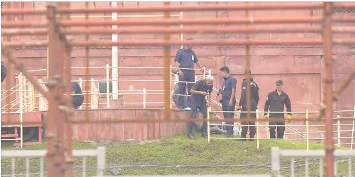
Independence Day atongtsü anogo ishika dang lia August 11, 2024 nü Red Fort, New Delhi nung iba anogomong sentong atema sabang yangludang tangokba noksa nung angur.

August 5 nü Hasina-i aniba sorkar chirepba sülen Bangladesh nung district 52 nung Hindu aser Khristantem densema minorities anema inyakba tatalokba 205 lir.