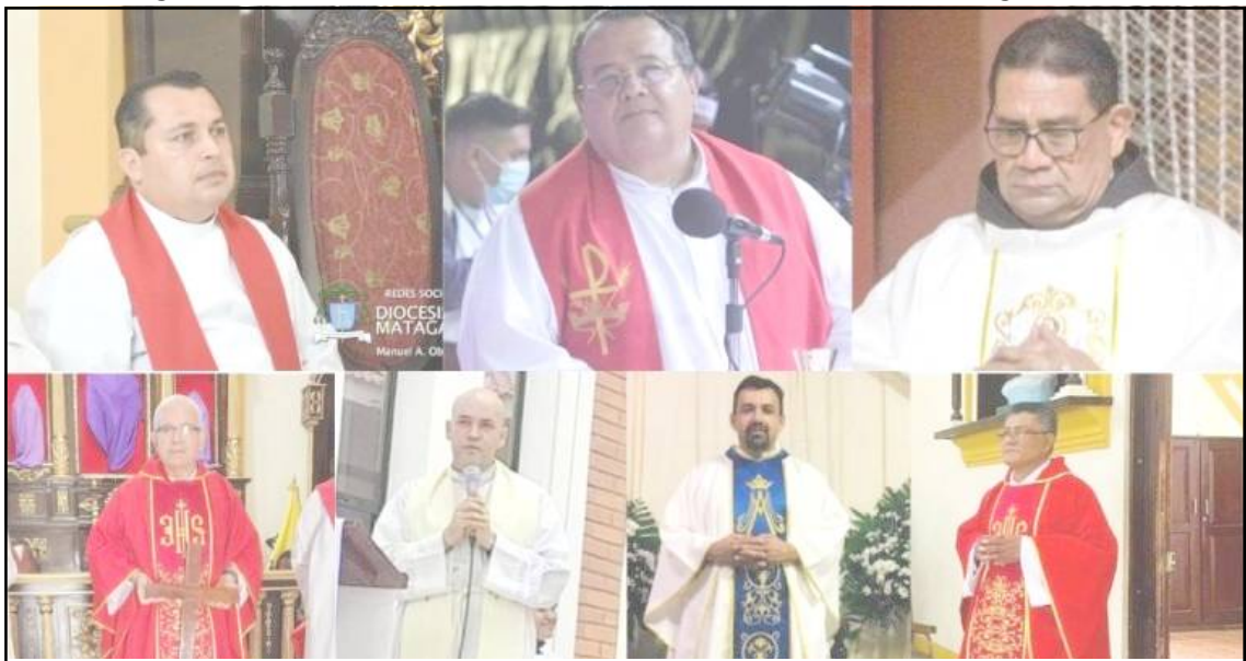
Taküm July 26 nungi August 5 anogo tashi nung Nicaragua nung ketdangsertemi apuba Khristan putir tenet noksa nung angur. Parnok ajak linük nungi meindoka Vatican-i yokogo.

August 11, 2024: Tawa Nicaragua linük nung apuba Khristan putir tenet linük nungi meindoka Rome-i yokogo; iba linük nung Tir, Daniel Ortega yimsüsüba kübok ketdangsertemi Arogo aser Arogo nung lenirtem anema inyaker.