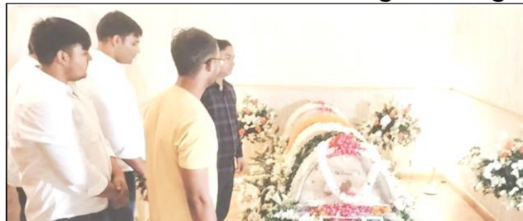
August 11, 2024 nü New Delhi nung taoba mapang Union Minister, K. Natwar Singh mangjak nung kinüngertemi asür nem akhüm agütsüadang tangokba noksa nung angur. Natwar Singh mapang talangka shiranga aruba sülen Honibar aonung süogo.

New Delhi, August 11 (Agencies): Taoba mapang External Affairs Minister, K Natwar Singh mapang talangka shiranga aruba sülen Honibar aonung alima nungi pilaogo, ta par kinüngertemi metetdaksü. Pa arshi kum 93 liasü.