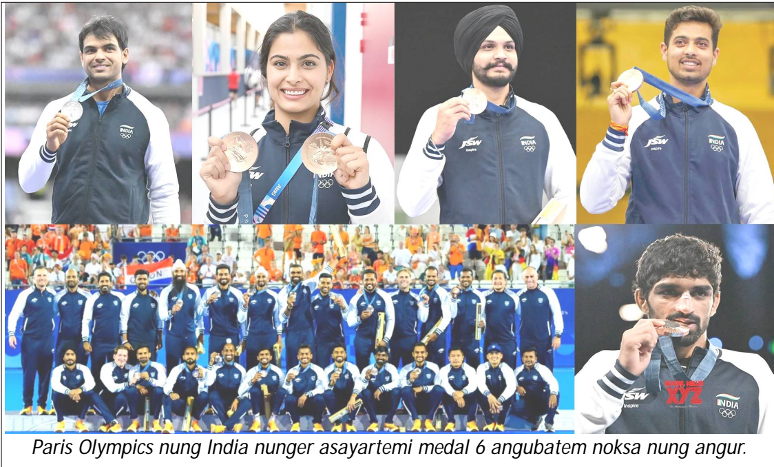
Paris Olympics nung India nunger asayartemi medal 6 angubatem noksa nung angur.

Luroi/August 11, 2024 (Agencies): 2024 Paris Olympics nung India nunger asayartemi medal trok ngur tembangogo. Parnoki silver ka aser bronze medal pongu ngua liasü.