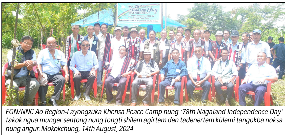
FGN/NNC Ao Region-i ayongzüka Khensa Peace Camp nung '78th Nagaland Independence Day' takok ngua mungter sentong nung tongti shilem agirtem den tadenertem külemi tangokba noksa nung angur. Mokokchung, 14th August, 2024

Alima kin ana nüchiso temeten indang jembidang, tongpang tulu