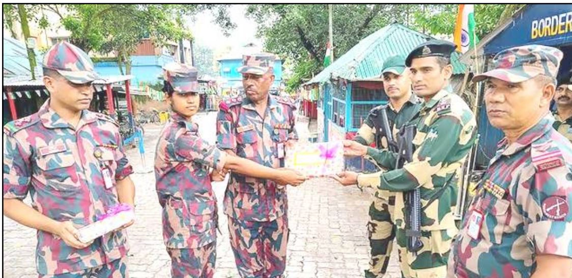
August 15, 2024 nü India nung Independence Day anogomong nung Dakshin Dinajpur district kübok Indo-Bangladesh Border checkpost nung Border Security Force (BSF) sepaitemi Border Guard of Bangladesh (BGB) sepaitem nem nanglong agütsüdang tangokba noksa nung angur.

June 26 nüa Doda district kübok Gandoh area kübok kiralongrartem den raradang Pakistan nung amenoka aliba Jaish-e-Mohammad (JeM) kiralongrar telok nungi nisung asem khaset.