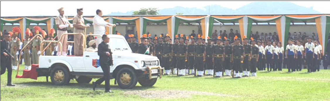
Nagaland Chief Minister Neiphiu Rio-i August 15, 2024 nü Civil Secretariat Plaza, Kohima nung 78th Independence Day mapang parade contingents semdangba noksa nung angur.

1997 nungi ceasefire nung lir aser 2015 küm Framework Agreement ya zülutep. Ano 2017 nungi GoI aser Naga nung telok tenet aliba Working Committee of Naga National Political Groups tsünga jembishinü balaka tenzüka 2017 küm Agreed Position zülutepa liasü.