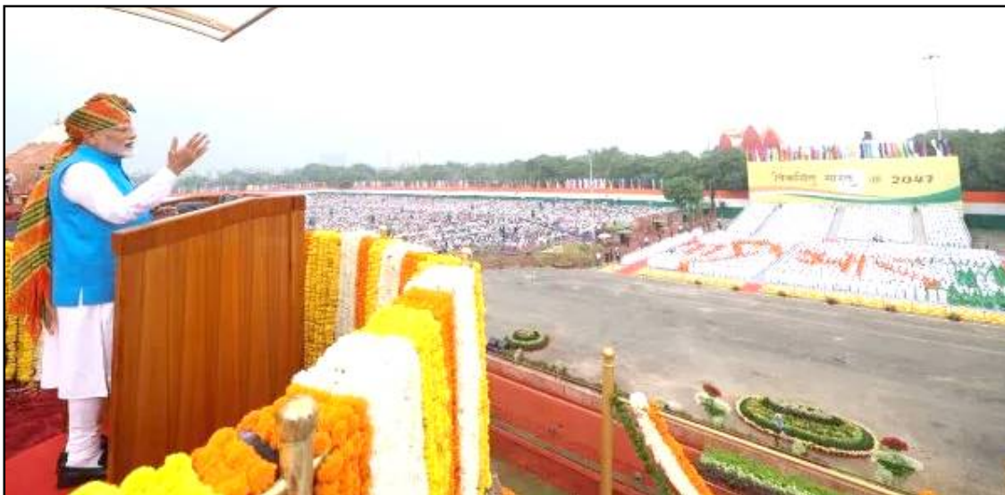
New Delhi, August 15, 2024: Brihostibarnü Independence Day anogomong sentong nung Ato kilonser, Narendra Modi-i jembidang tangokba noksa nung angur.

New Delhi, Luroi/August 15 (Agencies): Brihostibarnü Independence Day anogomong nung Delhi nung aliba Red Fort nung tongti sentong nung jembidang Ato kilonser Narendra Modi-i linük nung uniform civil code ka- "secular civil code" nungdak, ta metetdaksü.