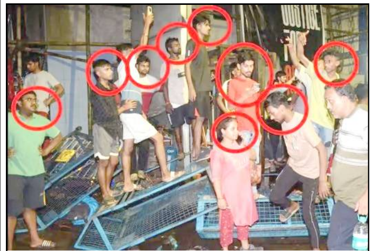
Kolkata police-i tang tashi nung pua aliba nisung 9 noksa nung angur.

Kolkata, August 15 (Agencies): Bodhbar ayaterm nung nisung kari Kolkata nung aliba sorkar hospital- RG Kar Medical College Hospital raksatsüba sülen anogo ka dang lir Brihostibarnü Kolkata police-i nisung 9 puogo.