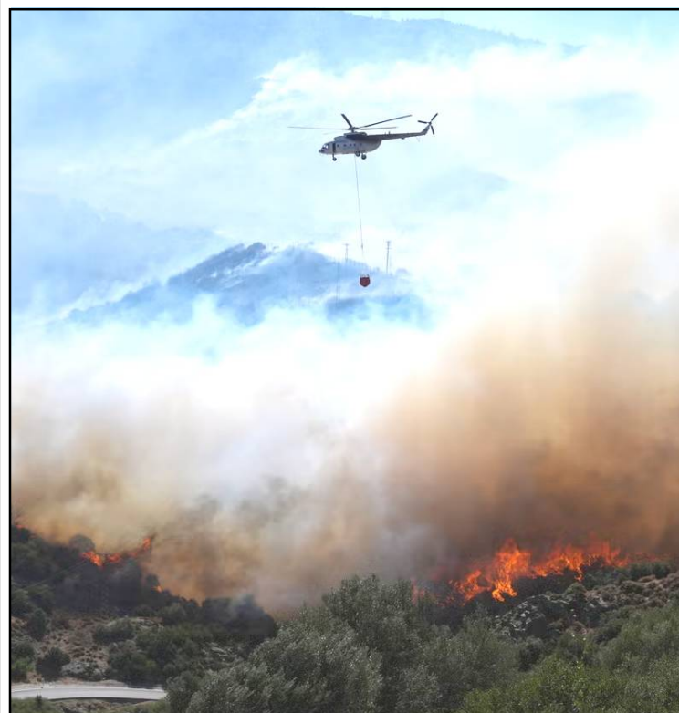
Helicopter ajanga tzü enloksüba noksa nung angur.

Ankara, Luroi/August 17 (Agencies): Turkey anüolen tesem balala nung mirok mi tesashi adokba sülen nisung 4000 dak tema aninogo, ta disaster management agency-i metetdaksü.