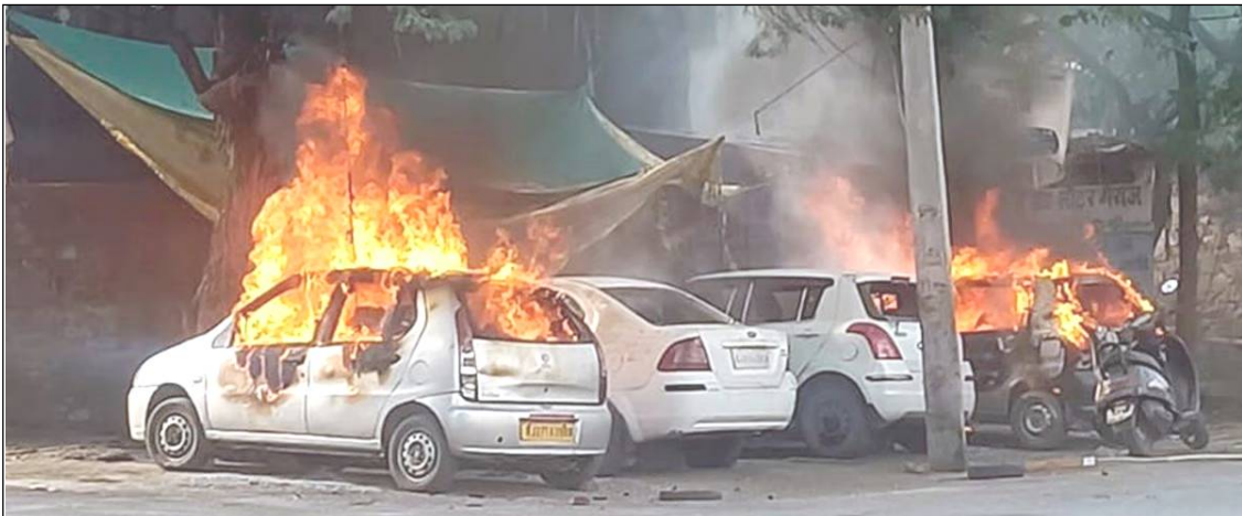
Udaipur, August 17, 2024: Rajasthan kübok Udaipur nung aliba sorkar school ka nung tanur kati tanur ka dak kotari agi tsüngoktsüba sülen rara adokdang nisung kari gari nung mi senoktsür arondang tangokba noksa nung angur.