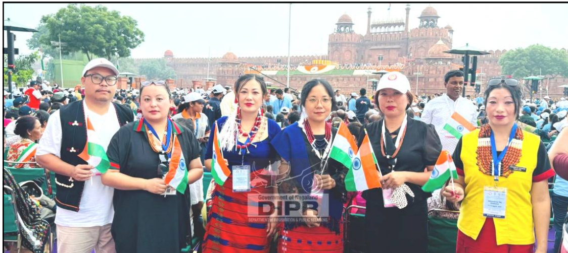
Social Welfare dept kübok mission aseme Independence Day nung shilem agirtem noksa nung angur. (New Delhi, August 15, 2024)

Dimapur, Luroi/August 17 (TYO): Ministry of Women & Child Development, Government of India-i jaokba sülen Social Welfare Department, Government of Nagaland kübok Mission Shakti, Mission Vatsalya aser Mission Saksham Anganwadi & Poshan 2.0 ta mission asem Nagaland tenung nung August 15 nü Red Fort, Delhi nung 78buba Independence Day amungba mapang alakteta jaoker ama shilem agiogo.