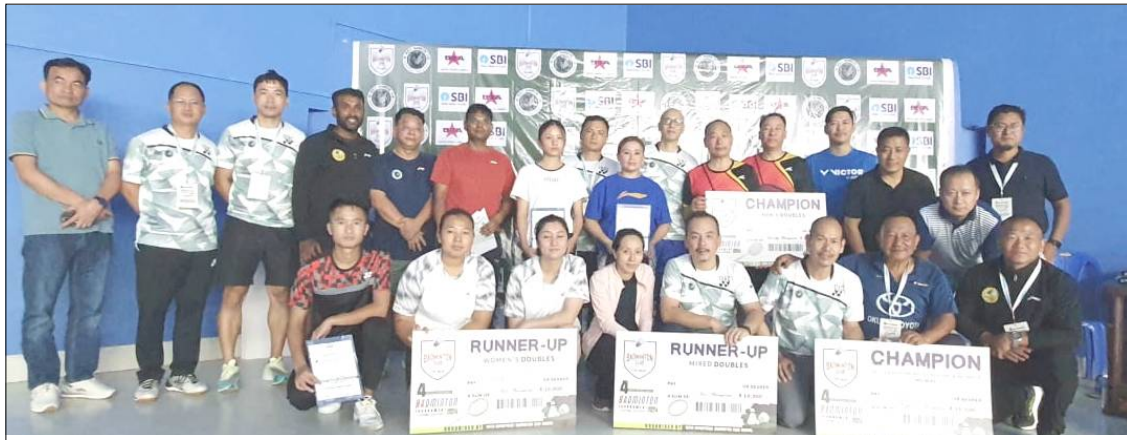
4buba Inter Department Badminton asayamung nung takoker aser ketdangsertem külemi tangokba noksa angur. (Kohima, Aug. 17, 2024)

Kohima, Luroi/August 17 (TYO): Inter Department Badminton Club (IDBC) Kohima-i ayongzükba 4buba Inter Department Badminton Tournament Kohima edition Honibarnü Nagaland Legislative Assembly Stadium nung tembangogo.