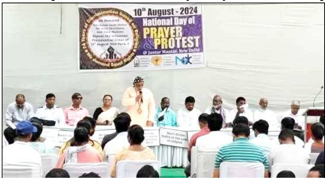
August 10, 2024 nü New Delhi nung Khristantemi National Day of Prayer & Protest amongdang tangokba noksa nung angur.

August 17, 2024: August 10, 2024 nü India tesem ajaklen Khristantemi National Day of Prayer & Protest among; iba anogomong nung Khristantemi India nung Dalit Khristantem aser Dalit Muslim nungertem nem-a kasa temeden agüjang, ta takhangba agütsü.