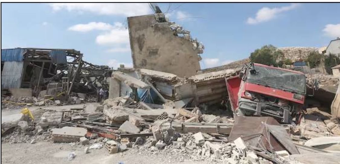
Southern Lebanon kübok Nabatieh tesem Israel-i anüing ajanga maka raksatsür aliba noksa nung angur.

Beirut, Luroi/August 17 (Agencies): Israel-i anüing ajanga southern Lebanon amakba sülen nisung 10 tepsetogo, ta Lebanon indang Ministry of Health-i ashi. Kasa mapang nung Israel military-ia parnoki Hezbollah pur prangbong injang aser hadir balala bendena ayuba tesem ka makogo, ta shiogo.