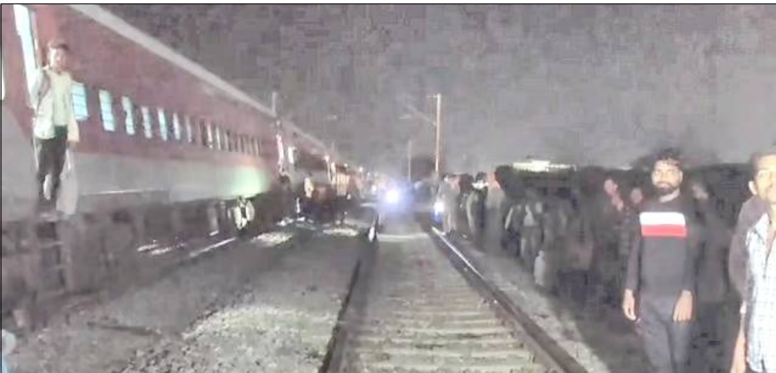
August 17, 2024 nü Uttar Pradesh kübok Kanpur aser Bhimsen station na tsüngda Sabarmati Express passenger train tsükokba sülen tangokba noksa nung angur.

metetdaksü. State sorkari iba lendong nung asürtem kibongtem nem sen lakh pezüzü teyari agütsütsü, ta sangdongogo. Iba osang angashia Chief Minister Vishnu Deo Sai-i X ajanga, "Jashpur district nung tsüngi lendong nung tetsür asem asüba aser aika yiruba osang tamajung angashiogo. Yirua alirtem tajungtiba nung yariang, ta district administration dang tuyuogo," ta metetdaksü. CM-isa iba lendong nung asür kibongtem den mangyim jashi lemsatop. Tawa Uttar Pradesh nunga tsüngi lendong nung nisung 30 dak tema süogo aser Bihar nunga tsüngi lendong nung nisung 40 shi süogo. Tsüngi lendong nung asürtemji teimbaka tzülu nung mapa inyakdang, kiset shiruru chiyimdaksüdang mesüra tzünglu nungi süngdong akhüm nung jenoka alidang tsüngi yalokja asürtem liasü.