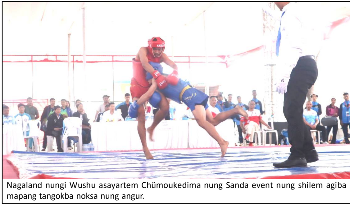
Nagaland nungi Wushu asayartem Chümoukedima nung Sanda event nung shilem agiba mapang tangokba noksa nung angur.

Kohima, Luroi/August 19 (TYO): Taruba 33buba National Wushu Championship 2024 atema Nagaland Wushu Association-i ayongzüka state level selection trial ka August 30 nü agitsü.