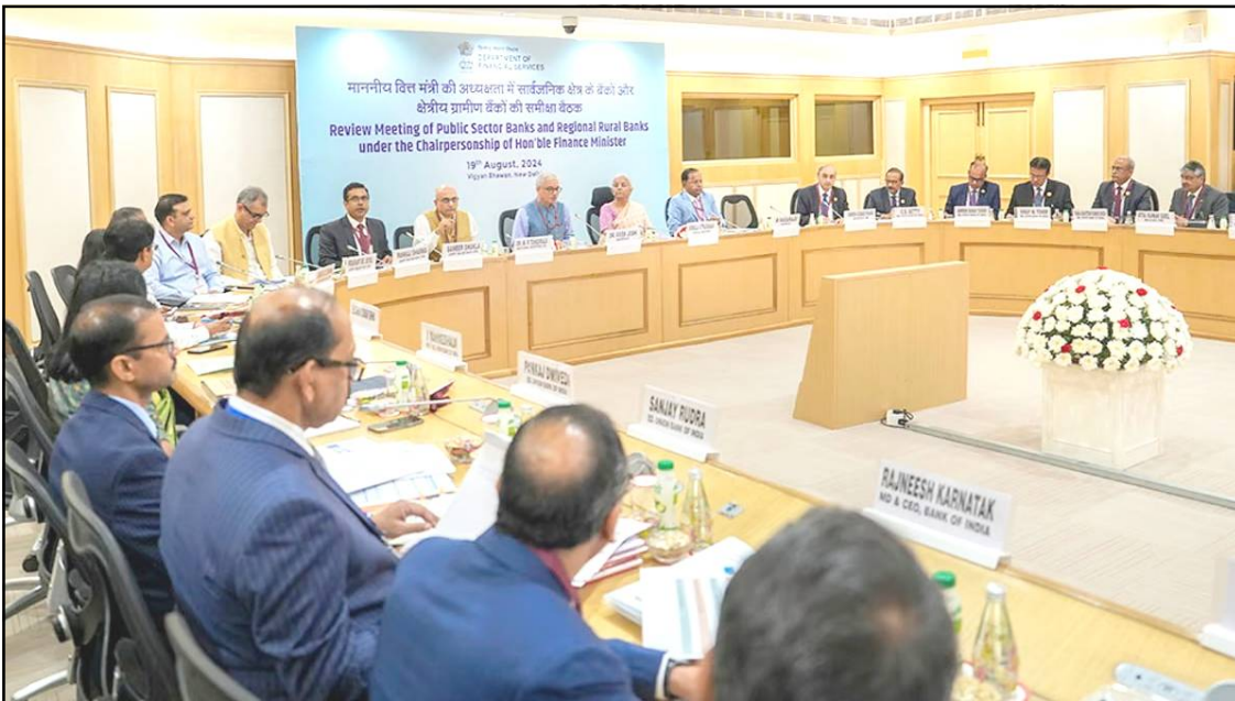
August 19, 2024 nü New Delhi nung Union Finance Minister, Nirmala Sitharaman leniba nung Public Sector Banks nungi tongti ketdangsertem den senden amendang tangokba noksa nung angur.