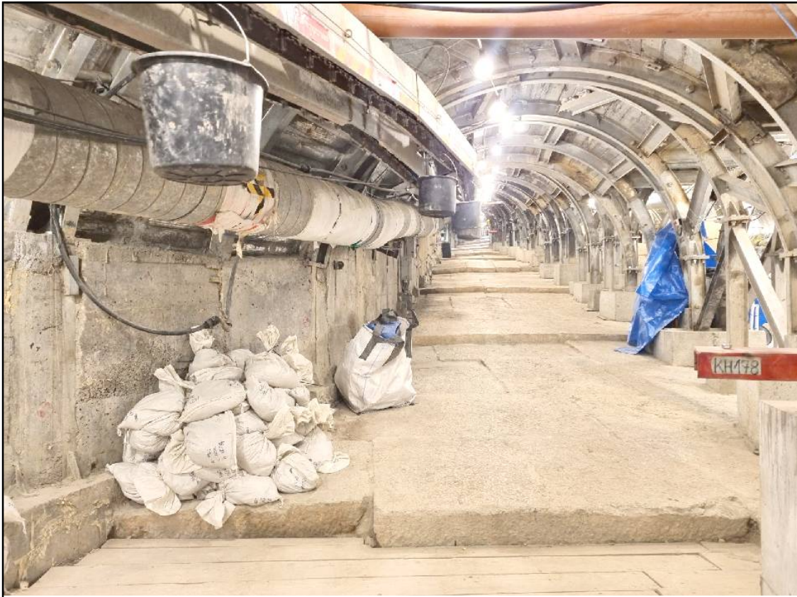
Yirusalem nung Yisu Khrista jajaba lenmang 'Pilgrim's Road' noksa nung angur.

August 19, 2024: Yirusalem nung archaeologist temi lung tutetba tesem ka ngutetogo; iba tesem nungi tutetba lungtemji Yisu Khrista mapang shia jajaba lenmang nung alem südi, ta parnoki metetdaksü.