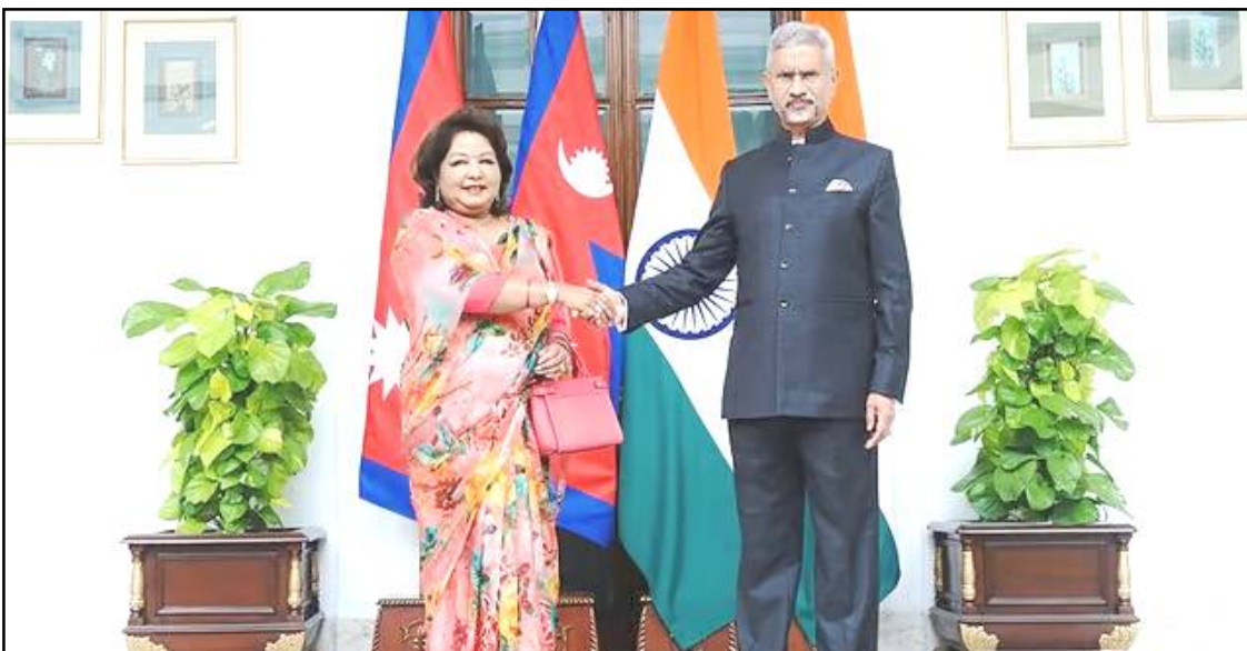
August 19, 2024 nü New Delhi nung Nepal Foreign Minister, Dr. Arzu Rana Deuba aser External Affairs Minister, S Jaishankar na senden amenba sülen tangokba noksa nung angur.

Ukraine nung rara tenzükba sülen anüolen aliba linüktemi India dang Russia den tesendaktep tajung mayutsü ajangshia liasü.