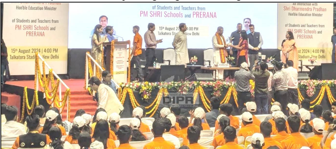
PM SHRI GMS Showuba Old nungi kaketshir Yimjila-i Education Minister tushiba mapang tangokba noksa ka angur.

Dimapur, Luroi/August 19 (TYO): PM SHRI (Prime Minister's Schools for Rising India) ya Government of India ajanga September 7, 2022 nung tenzük aser iba scheme kübok linük tesem ajunga nungi school 14,500 dak tema PM SHRI Schools nung züngoktsü aser item nung NEP 2020 mapa kuma inyaka tatishitsü tajung aketba kaket reju kumdaktsütsü.