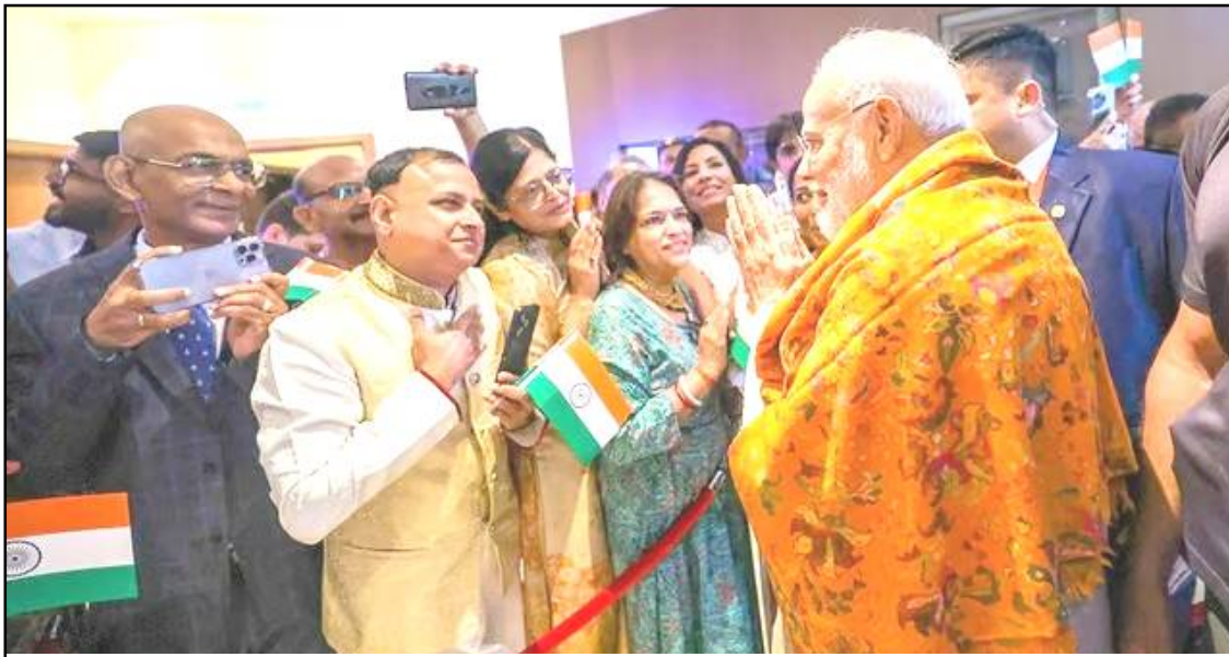
August 23, 2024 nü Ukraine yimtiba, Kyiv nung India nungertemi Ato kilonser, Narendra Modi agizükdang tangokba noksa nung angur.

New Delhi, August 23 (Agencies): Hokolbarnü Ato kilonser, Narendra Modi Ukraine yimtiba, Kyiv tonga ao; pa Poland nungi train nung ghonda ter jajaba sülen Kyiv tonga ao. Ukraine Tir, Volodymyr Zelenskyy-i jaokba nung ajemdaker Modi-i Ukraine semdang. Train station nung Ato kilonser Modi agizükba sülen pa Hyatt Hotel-i ao. Ato kilonser Modi-i Ukraine National Museum nung