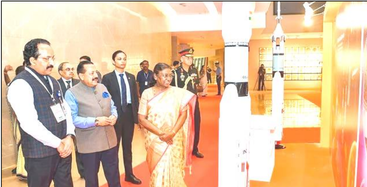
August 23, 2024 nü New Delhi nung National Space Day anogomong dak sendakba sentong ka nung linük Tir Droupadi Murmu, Union Minister of State for Science & Technology, Jitendra Singh aser ISRO chairman, S Somanath nunger exhibition semdangba mapang tangokba noksa nung angur.

Abhishek Singhvi-i, temepishiba ken o ka anema dang CBI-i affidavit agüja lir aser ibaji Brihostibar aonung 8:00 ako nung ang parnok nem agütsü, ta metetdaksü. Assistant Solicitor General, SV Raju-i, parnoki ano tanügba temepishiba ken o ka anema hopta ka tsükdang affidavit agütsütsü, ta metetdaksü. Iba sülen bench-i iba ken o ya maneni September 5 nü angadangtsü lemetet. August 14, 2024 nü Supreme Court-i iba ken o nung Kejriwal nem interim bail agütsütsü memelung aser CBI dang nungi telangzüba meshia liasü. Delhi excise policy ken o nung taküm March ita nung Kejrival apu, aser kasa ken o dak sendakba nung CBI-i taküm June 26 nü Kejrival apu.