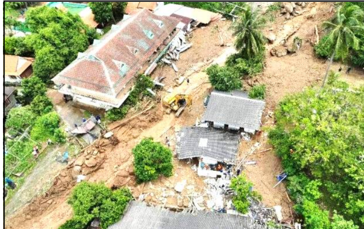
Thailand kübok nüngutug asetkong Phuket nung anentsüh lendong nung asür nisung 10 jungogo, ta ketdangsürtemi Honibarnü metetdaksü. Hokolbarnü anentsüh aliba sülen nisung asem tang tashi monguteti lir aser nisung 19 yiruogo.

- Temeim chirnur, semchisemnur aser anükapangtem.