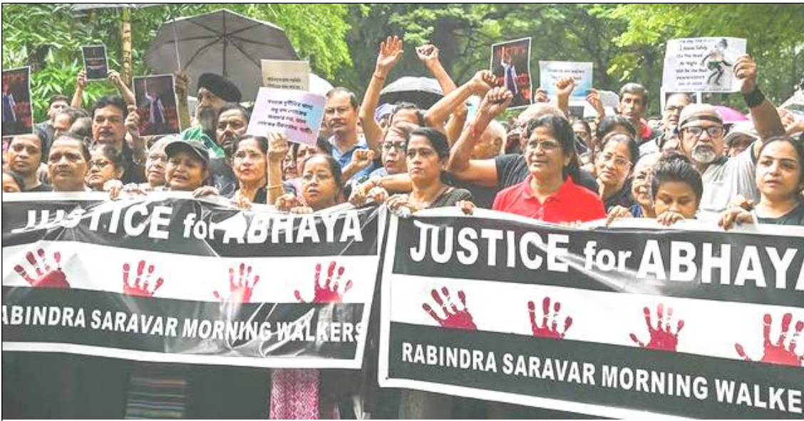
Tawa Kolkata nung aliba Hospital ka nung doctor ka tashiyim amshia raksatsür tepsetba anema August 24 anepdang züngia jajazüa senzürtem telok 'Rabindra Sarovar' züngsemtemi longkak aítang tangokba noksa nung angur.