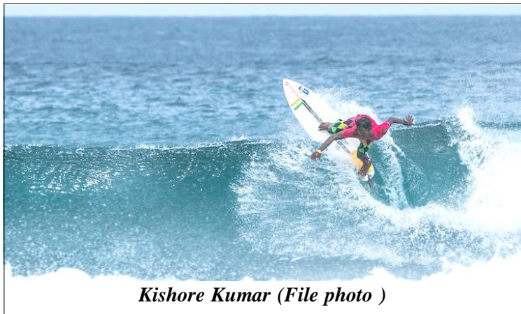
Kishore Kumar (File photo)

Luroi/August 24, 2024 (Agencies): India-i tang mezüngbuba 2026 Asian Games nung surfing tetoktepba atema quota ngutetogo. Iba asayamung ya Aichi-Nagoya, Japan nung asayatsü aser tetsür aser tebur team napronglai quota kaka ngutetogo.