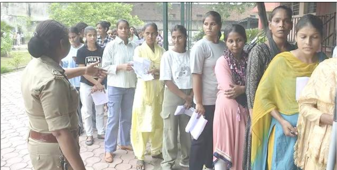
August 24, 2024 nü Mathura nung tetsürtemi Uttar Pradesh Police Constable Recruitment Exam agütsütsü atema tarensena nokdaka alidang tangokba noksa nung angur.

Maparen teladak asütsü atema senji tetsürtem indang Aadhaar-enabled single-holder (DBT) bank account nung Aadhaar Payment Bridge System (APBS) ajanga indangindanga inoktsütsü. Iba dak alia tetsürtemi Subhadra Debit Card kaka angutsü.