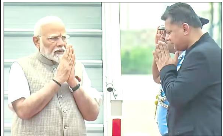
Ato kilonser Narendra Modi-i Poland aser Ukraine na semdangba sülen August 24 nü Delhi tonga arudang tangokba noksa nung angur.

Yaküm Chhattisgarh assembly elections nung BJP-i takok anguba sülen nungi state nung Maoists anema raraba tesashiba kümogo. Taküm küm tenzüker tang tashi nung state nung security sepaitemi Maoists 142 tepsetogo.