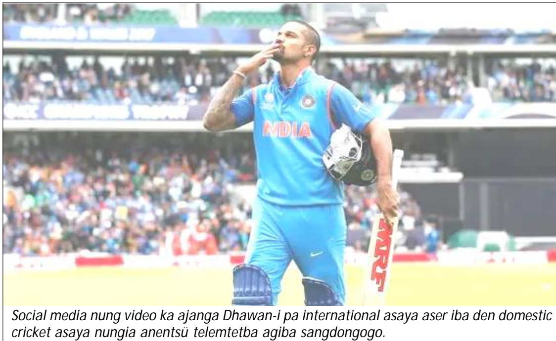
Social media nung video ka ajanga Dhawan-i pa international asaya aser iba den domestic cricket asaya nungia anentsü telemtetba agiba sangdongogo.

Luroi/August 24, 2024 (Agencies): India nunger nungtugu opener Shikhar Dhawan-i Honibarnü pa international cricket asaya nungia anenba sangdongogo.