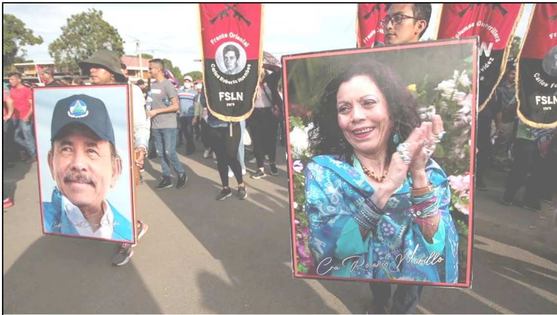
Nicaragua linük nung rally ka nung shilem agirtemi linük Tir, Daniel Ortega aser tatong Tir, Rosario Murillo na noksa amer jajadang tangokba noksa nung angur.

August 24, 2024: Tawa Nicaragua nung sorkari Arogo aser melungtet telok 1,500 anentsüba sülen maneni parnoki Arogo dang ter shilem (10-%) nungi saru meshir, ta osang ka ajanga metetdaksü.