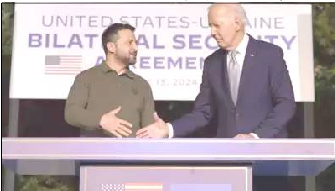
Tir Joe Biden (Achiji) aser Ukraine tir Volodymyr Zelenskyy (Abelen) na bilateral security agreement nung shigen asüba sülen tangokba noksa nung angur (File photo)

Washington, Luroi/August 24 (Agencies): Ukraine tir Volodymyr Zelenskyy aser US tir Joe Biden na phone ajanga sensaksemba sülen United States-i, Ukraine nem ano military teyari talila agütsütsü ta sangdongogo.