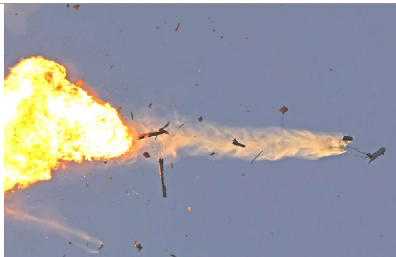
August 25, 2024 nü Lebanon nungi Hezbollah-i Israel tsütsü yokba drone (abelen) aser Israel jet fighter ajanga drone poksaktsüba (achiji) nung angur.

New Delhi, August 25, 2024 (Agencies): Lebanese nung telungpur telok Hezbollah-i Deobarnü rockets 320 tema Israel tsütsü khaloktsüogo. Taoba ita parnok commander Faud Shukr tepsetba tayang küpzüka Israel amak ta Hezbollah-i metetdaksü.