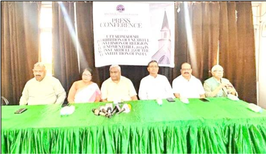
August 19, 2024 nü Uttar Pradesh yimtiba, Lucknow nung United Christian Forum (UCF)-i osangbenertem senden nung jembidang tangokba noksa nung angur.

August 25, 2024: New Delhi nung amenoka aliba United Christian Forum (UCF)-i Lucknow yimti nung Uttar Pradesh Angh, Anandiben Patel nem temepishiba shidi ka agüja Uttar Pradesh Prohibition of Unlawful Conversion of Religion (Amendment) Bill, 2024 atema tebilemstü akaba lemsatepogo. UCF-i, iba özüng tasenba ajanga tamangba yimsü meyipdaksüba atema ano tesashiba inyaksü aser Khristantem densema minorities taliba amokmerentsü mesüra reshikangshitsü, ta metetdaksü.