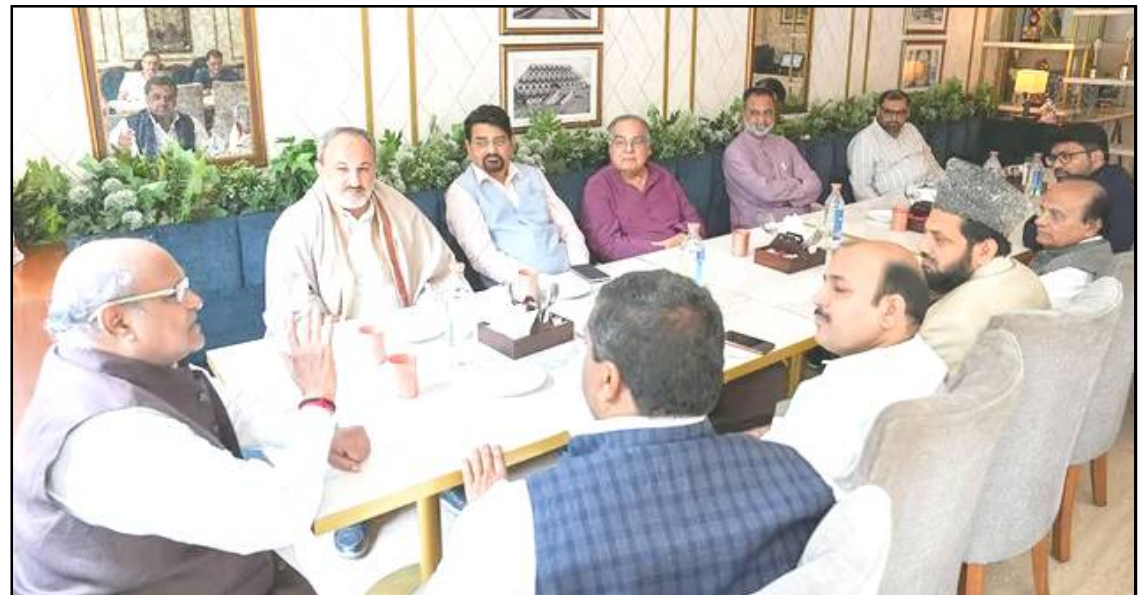
August 25, 2024 nü New Delhi nung Congress, Samajwadi Party, AAP aser JD(U) densema party balala nungi lenirtemi Palestine nung pusemba senden ka nung adendang tangokba noksa nung angur.

Singh-isa, Karnataka nung Congress sorkari tang tashi state caste census mesangdonger, süra kechiba Rahul Gandhi-i linük nung caste census agitsü maneni akhanger?, ta asüngdang.