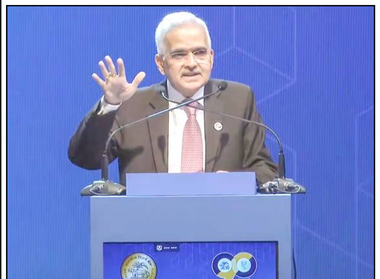
August 26, 2024 nü Bengaluru nung 'Global Conference on DPI and Emerging Technologies' sentong nung RBI Governor, Shaktikanta Das-i jembidang tangokba noksa nung angur.

BJP lenir Ranaut-i, sorkari mera agia meinyak asübo aluyimertemi longkak aitba ya ajanga Bangladesh nung atalokba tensa ama ataloker lila, ta jembia liasü.