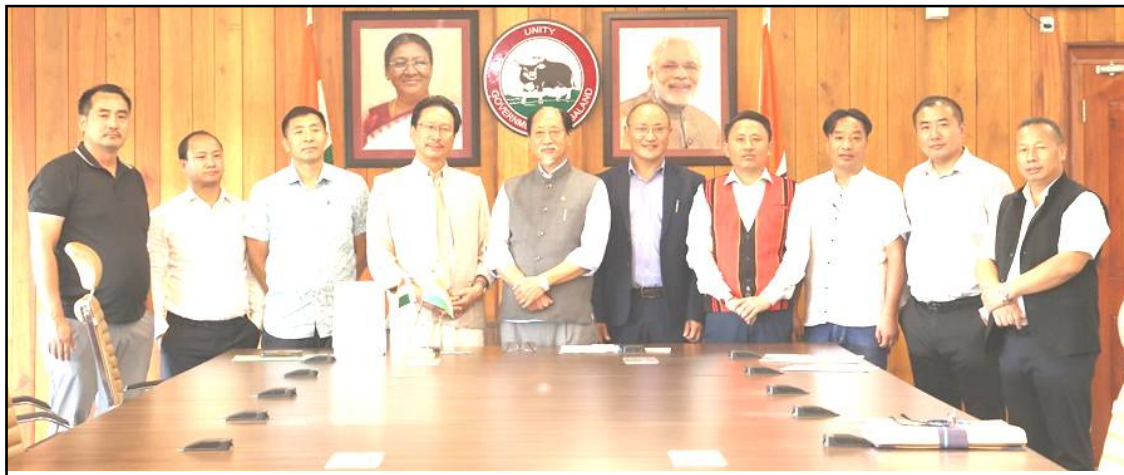
NWA kedingang Chief Minister den pa indang Official Residential Office nung tangokba noksa nung angur.

Kohima, Luroi/August 26 (TYO): Nagaland Wrestling Association (NWA)-i August 26 nü Nagaland Chief Minister Neiphi-u Rio den pa indang Official Residential Office nung ajurutepa, NWA sentongtem aser inyakyimtem indang metetdaksüba den state aser state adena or wrestling asaya ajungkettsü atema teka amteper inyaksü aser nongita yaritsü pa dang mepeshia liasü.