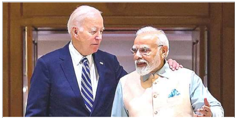
Joe Biden aser Narendra Modi (file)

New Delhi, August 26, 2024 (Agencies): Hombarnü Prime Minister Narendra Modi-i United States President Joe Biden den phone ajanga jembidang Bangladesh aser Ukraine tebilemstütem den tanga onük kar lemsatepogo.