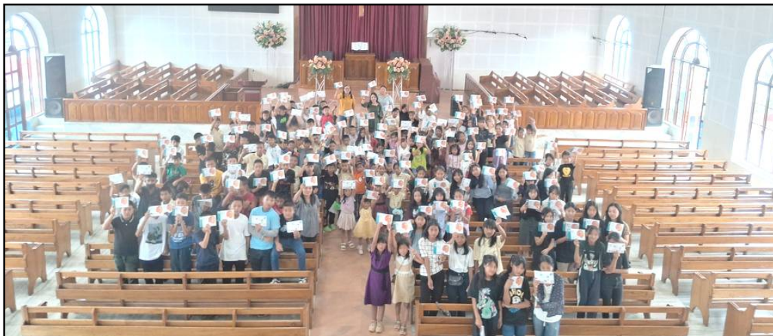
Nagaland nung mezüng süa Kumlong Baptist Arogo Christian Education Ministry-i ayonga "My Body is My Body" ta sür International sentong ka Deobarnü KBA tenla kidang akaba mapang telok külemi tangokba noksa nung angur. Iba ya tanurtem pei temang kümzüka ayuba den tanur dak tim mesüi beshiba (child abuses) aser tashiyim mapa balala nungi koda kümzüka alitsü iba indang tesayuba agütsüba sentong ka lir.

"China-i 1951 Convention nung 'Status of Refugees' alema inyakba atema United Nations-i China anema kecha meinyaker. Iba Convention kübok sign süa aliba linüktemi pei linük nung refugee tem meyipa meyoktsüla. Communist Chinese Party (CCP)-i iba temzüng anema inyakba atema UN-i China aitsütsüla. CCP aser PRC (Peoples Republic of China)-i North Korea nung refugee tem anema inyakba atema UN-i aitsütsüla," ta kasa shidi ajanga metetdaksü.