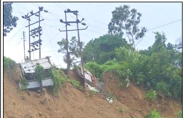
Ungma nung Natural Park tesem nung electrical line tongtiba raksaba ajanga mapang tatsüka atema power aotsüsa akum. Iba yagi Mokokchung Town densema tesem balala nung electricity supply nung kongshir, ta Sub Divisional Officer (SDO), Mokokchung Electrical Sub-Division ajanga ashi. Iba electrical line ya August 27, 2024 nü yanglushitsü sentong lir.

Dimapur, Luroi/August 26 (TYO): Traffic Control Dimapur ajanga August 25, 2024 nikongdang 2:45 ako meta telephone nungi nisung tasümang ka flyover bridge tsünglanglen lir ta osang agüja liasü. Iba osang nung ajemdaker East Police Station duty party tem iba tesem bushia ao aser non-local tebur arishi küm 55-60 shi below flyover bridge, Dimapur nung tasü mejanga aliba ngutet. Iba tasümang meita reprangba mapang tim masüba mapa inyakba kecha mongutet aser anasa alirtemi iba nisungba ya yasa-tzüra agi asüba südi ta shia liasü. Ozüng agi melaba maparen ajak renema inyakba sülen tasümang ya post-mortem examination/identification atema District Hospital morgue nung yua lir. Nisungba ya long pang sentsü tanen aser tula masem liasü. Kibur/kinunger/tembar temi Officer-in-Charge, East Police Station, Dimapur den Mobile No. 7085055020 ajanga tongteprateptsü akok, ta Dimapur Police sangdong ka ajanga ashi.