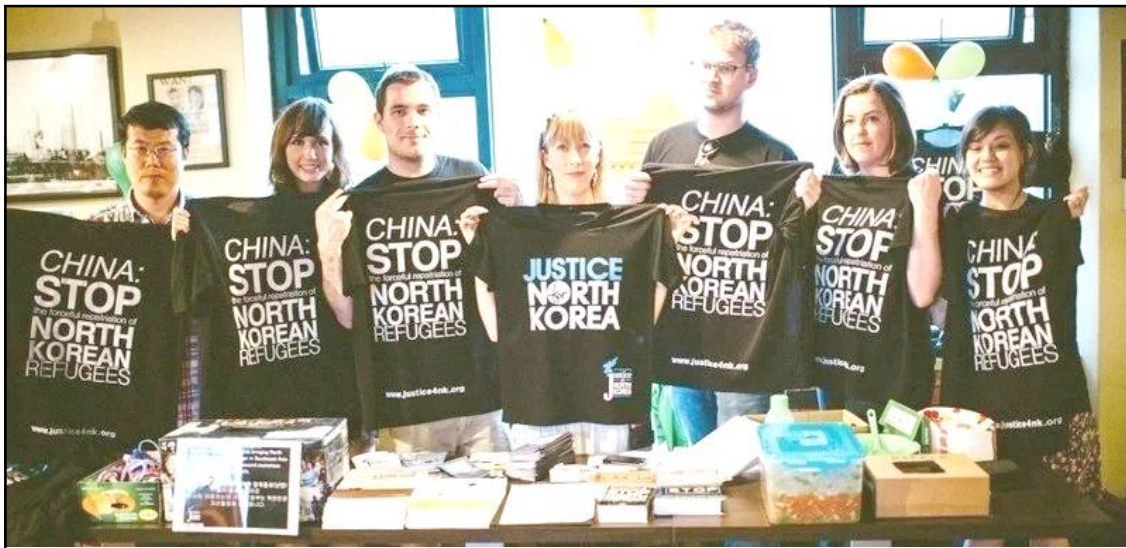
China-i North Korea nungi jena arur refugees tanaben North Korea-i meyipa yokba anema meimchir temeden atema inyaker teloki longkak aitdang tangokba noksa nung angur.