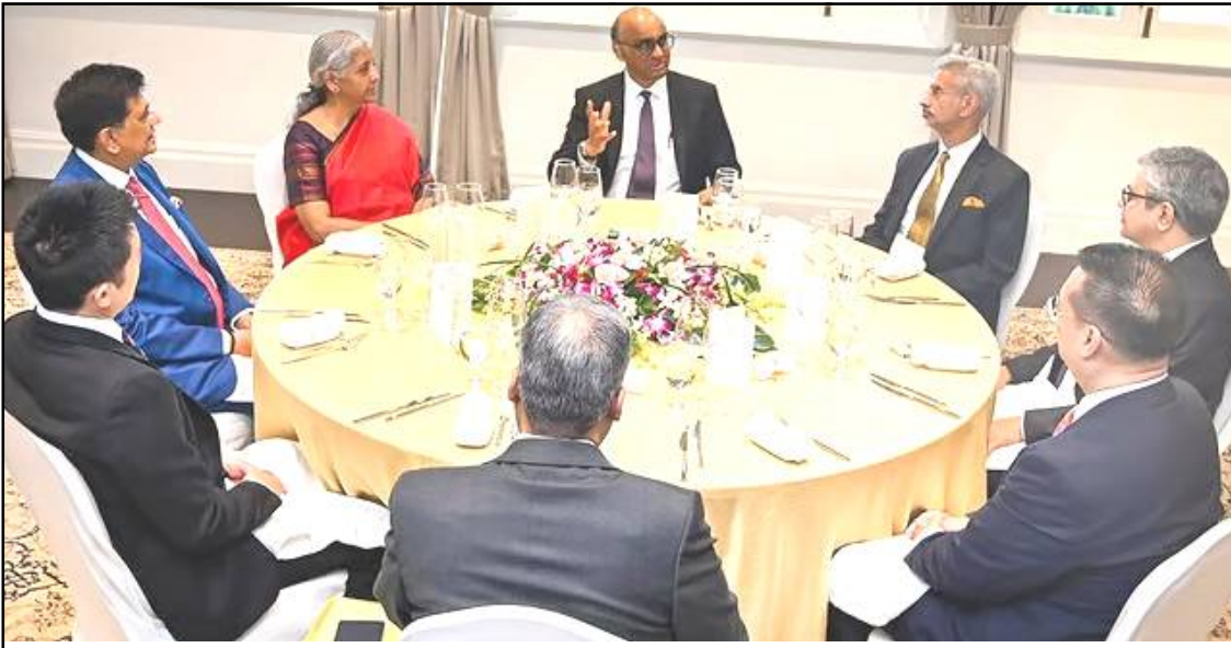
August 26, 2024 nü Singapore nung India nunger Union Ministers- S. Jaishankar, Nirmala Sitharaman, Piyush Goyal aser Ashwini Vaishnaw nungeri Singapore Tir, Tharman Shanmugaratnam den senden amendang tangokba noksa nung angur.