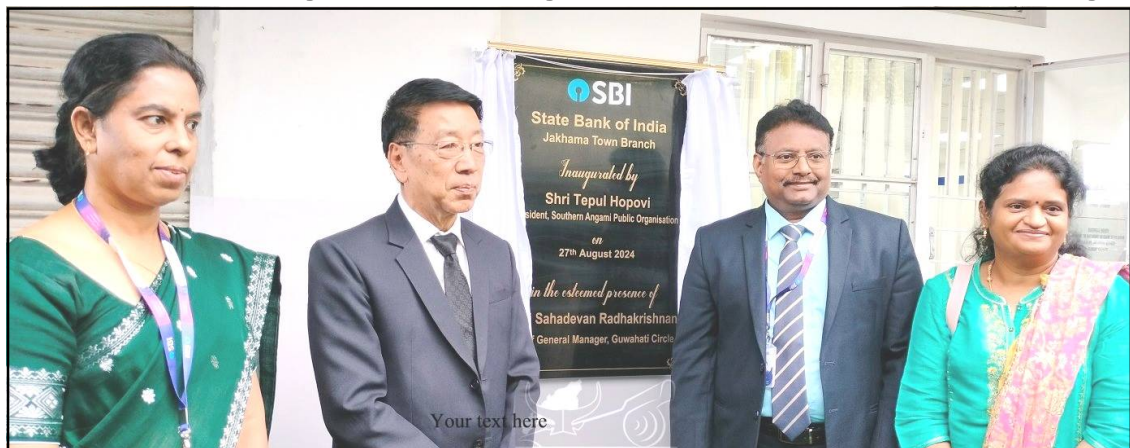
Jakhama nung SBI indang branch office ka lapokba sentong nung ketdangsertem tangokba noksa angur.

Dimapur, Luroi/August 27 (TYO): State Bank of India (SBI) ajanga Jakhama Town nung August 27, 2024 nü branch office ka semzüka liasü.