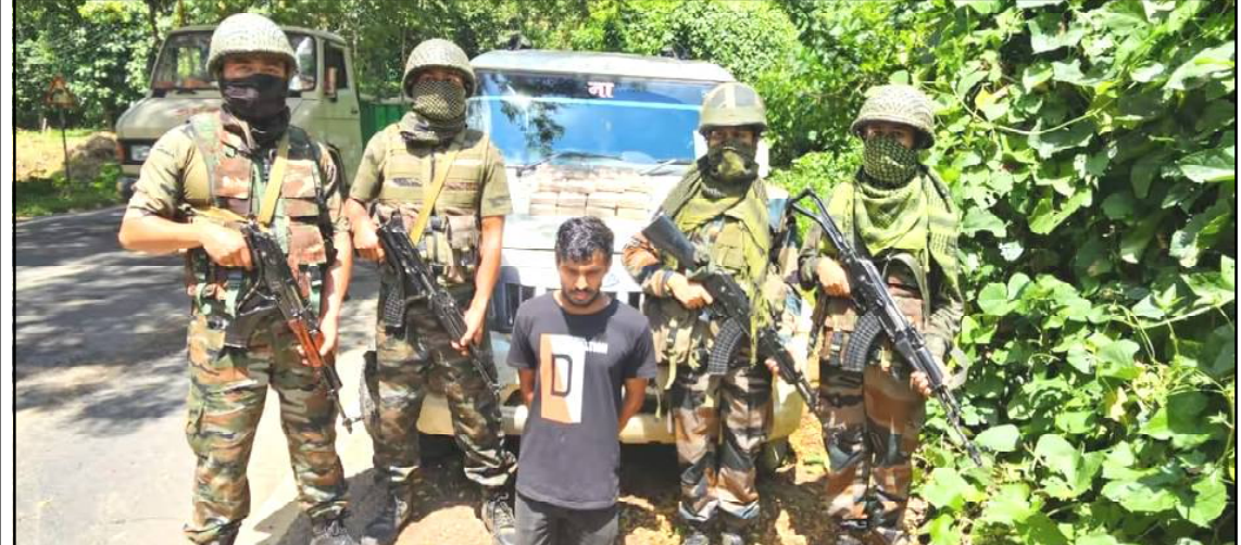
Assam Rifles-i Agartala kübok Salbagan nung nisung ka ket nungi Rs 19.2 crore alang Yaba süngjang 1,20,000 apuba sülen agiba noksa angur. Osang tejangja ka angazükba nung ajemdaker Assam Rifles-i mita odang Bolero gari ka nung mozü bena aliba apu. Parnoki apuba nisung den mozü aser gari ajak Tripura Police ket nung agütsüogo.

bungalows yanglushiba nung sen aika endokba magizük ta shia liasü" ta Jongte-i metetdaksü. "ZPM-i year of consolidation ta sangdonger sen aangtsü mapa inyakba mapang ka nung Speaker-i par bungalow yanglushiba nung Rs 23 lakhs tema endokba atema sasaa bilemer. Tanga Minister aser MLA temia parnok bungalow yanglushidar" ta paisa shisem. "ZPM party-i par Minister aser MLA tem asoshi sen aika endoker saka state nung senotsü maliba ajanga lenmangtem anepalu mesüteter" ta MNF tanishir Lallenmawia Jongte-isa ashi.