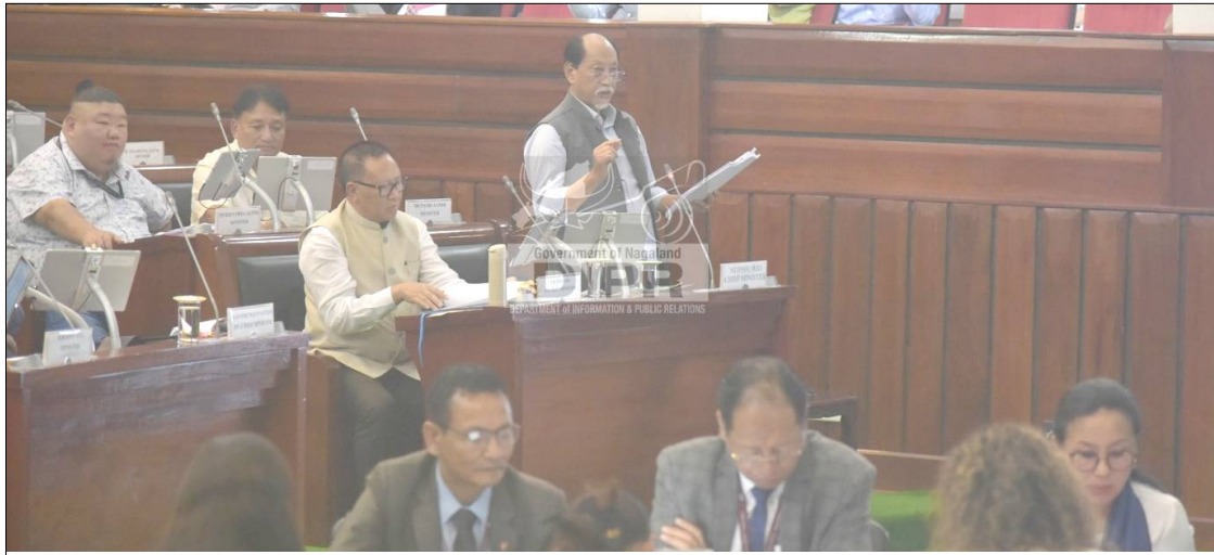
August 27, 2024 nü Nagaland Legislative Assembly (NLA) monsoon session tenzükba anogo nung Chief Minister Neiphiu Rio-i o jembiba angur.

"Iba Act ajanga nübortem asoshi khuret ang adokdaksü aser iba nung ozüing alema yi shibelena ayokba aser yi tamajung ayokba