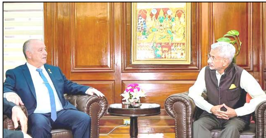
August 29, 2024 nü New Delhi nung External Affairs Minister S Jaishankar aser Israel Foreign Affairs Ministry Director-General, Yaakov Blitshtein na senden amendang tangokba noksa nung angur.

India nung Maoists telungpurtemi timatem agütsüba state temji Andhra Pradesh, Bihar, Chhattisgarh, Jharkhand, Madhya Pradesh, Maharashtra, Odisha, Telangana aser West Bengal lir.