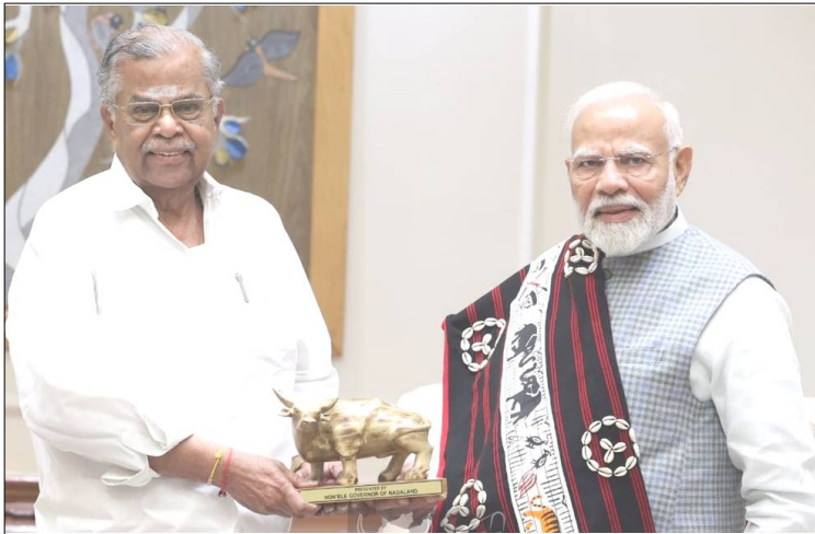
Nagaland Angh La Ganesan-i August 29, 2024 nü India Ato Kilonser Narendra Modi den par kidang ajurutepa Nagaland state dak sendakba ken o balala jembia liasü.