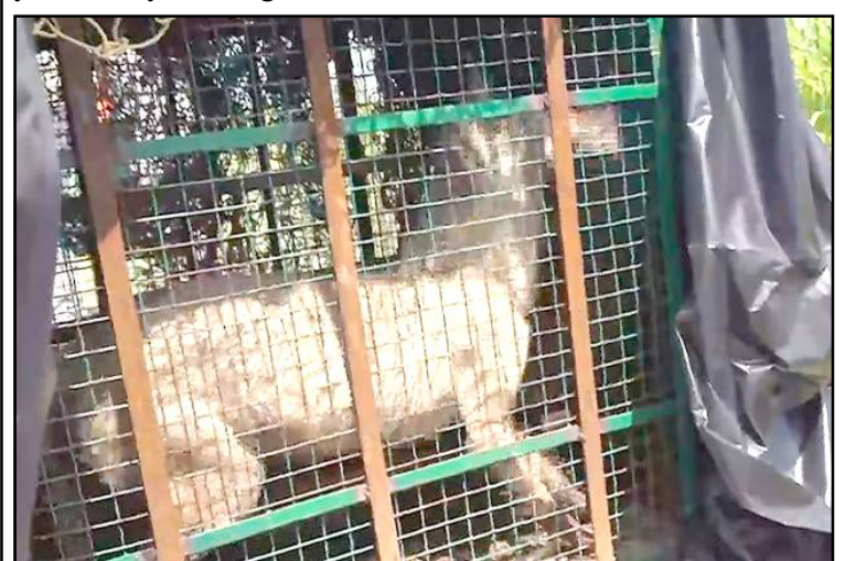
August 29, 2024 nü Uttar Pradesh kübok Bahraich district nung tsünü ka puer aoba noksa nung angur. Tesüiba anogo 40 tsüngda iba district kübok yim balala nung tsünü telok kati tanur 9 ngusetba sülen Uttar Pradesh sorkari 'Operation Bhediya' tenzüka liasü aser tang tashi nung tsünü trok nungjagi pezübo puogo.