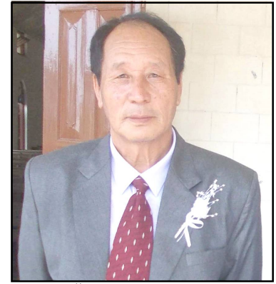
ASÜR MARMANGYANG Tasüba Anogo: 01.09.2022

Pungmang ka amai dang bilemer saka asangsang nung nai onok toktsür oer tanü aki küm ana (2) abensar, saka onok mulungjang nung na teti alir.