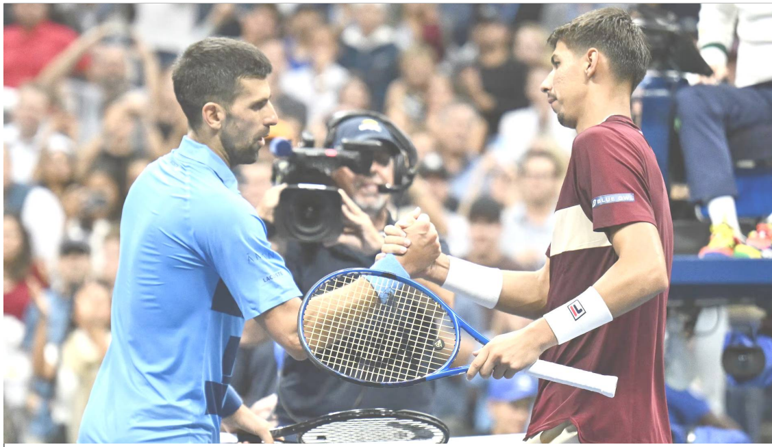
US Open tebur kija asaya tasembuba round nung Hokolbarnü Alexei Popyrin-i 6-4, 6-4, 2-6, 6-4 agi Novak Djokovic akokba sülen salemba noksa nung angur.