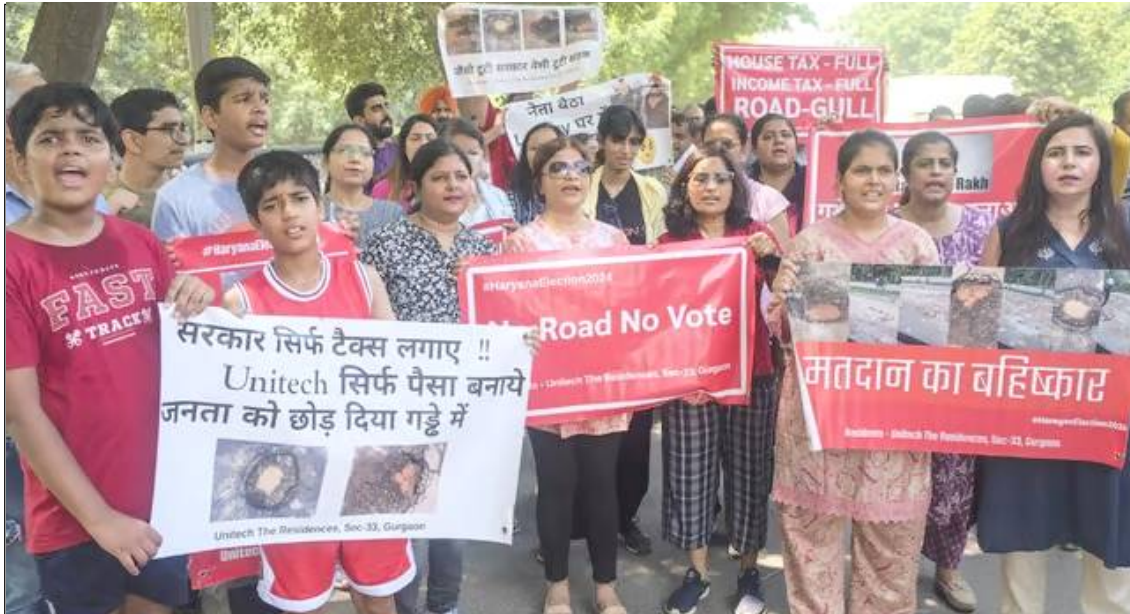
Gurugram, August 31, 2024: Gari lenmang majungba anema Gurugram nung nūburtemi Haryana sorkar anema longkak aitdang tangokba noksa nung angur.