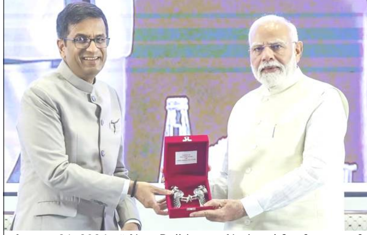
August 31, 2024 nü New Delhi nung National Conference of District Judiciary semzükba sentong nung Ato kilonser Narendra Modi aser Chief Justice of India, D.Y. Chandrachud na tangokba noksa nung angur.

ajanga pa zükset, ta police-i metetdaksü. Malik ya Charkhi Dadri district kübok Bandhra yim anasa liasü; pai anogo shia plastic pongdang tazüng aser merang tamajung shidena yoka liasü, ta police-i metetdaksü. Iba ken o nung nisung pongu puogo aser arrshi küm 18 tekübok tanur anata densema puogo, ta police-isa metetdaksü.