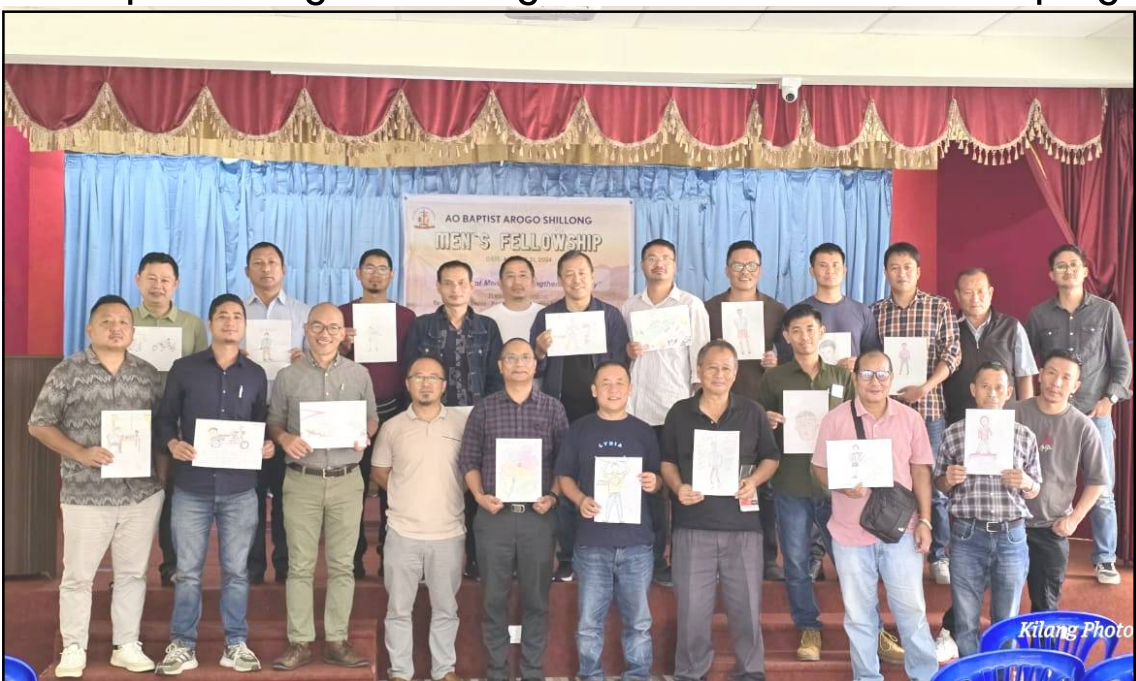
Ao Baptist Arogo Shillong-i Shillong nung alir Aor teburtem longjema tanela tsütsü tashi itdaksütsü atema "Men's Fellowship" tenzuka lir. August 31 nü parnok telongjem sentong nung agiba noksa ka yangi angur ( Shillong, August 31, 2024)