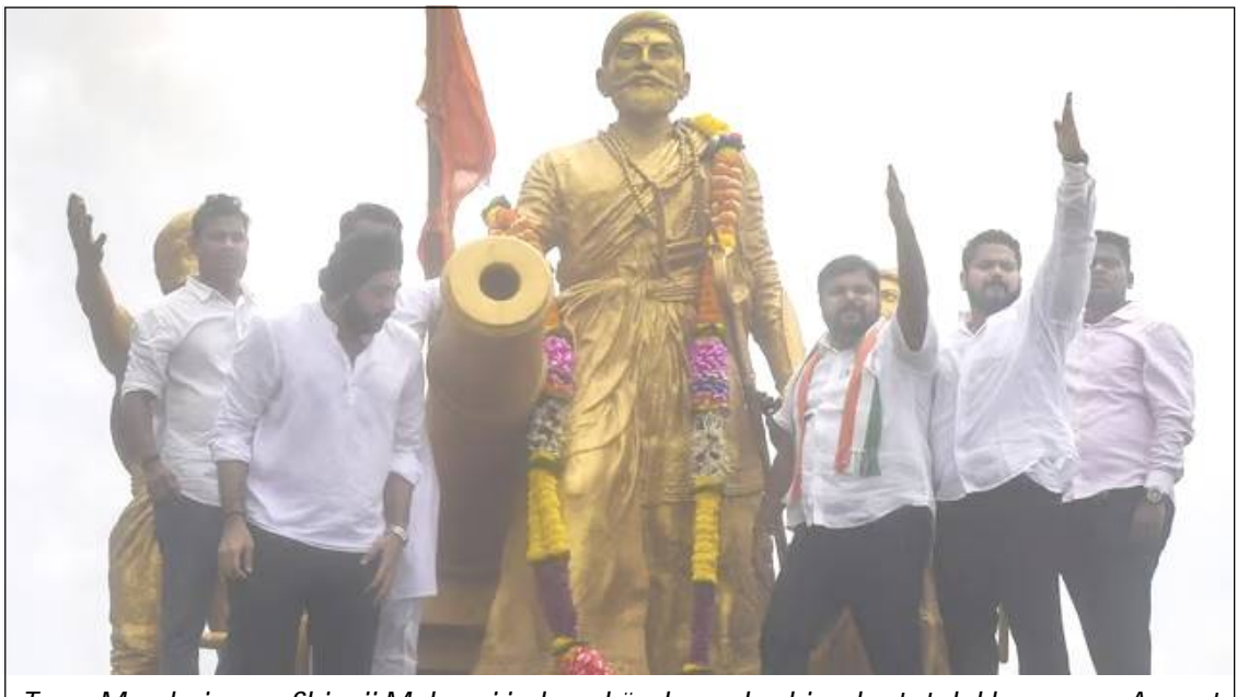
Tawa Mumbai nung Shivaji Maharaj indang kūrakyanglu chirepba tatalokba anema August 31 nü Mumbai nung Maharashtra Youth Congress-i Chhatrapati Shivaji Maharaj indang kūrakyanglu anasa nokdaker longkak aitdang tangokba noksa nung angur.