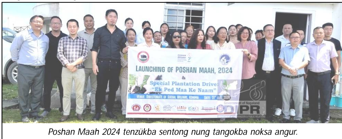
Poshan Maah 2024 tenzükba sentong nung tangokba noksa angur.

Kohima, August 31 (TYO): Küm shia September ita nung Rashtriya Poshan Maah amonger; 2018 küm Ato kilonser Narendra Modi-i Poshan Abhiyaan tenzüksüba sülen states aser Union Territories/ Departments den senteper linük tesem ajaklen Poshan Maahs 6 takok ngua mongogo, ta ketdangsertemi metetdaksü.