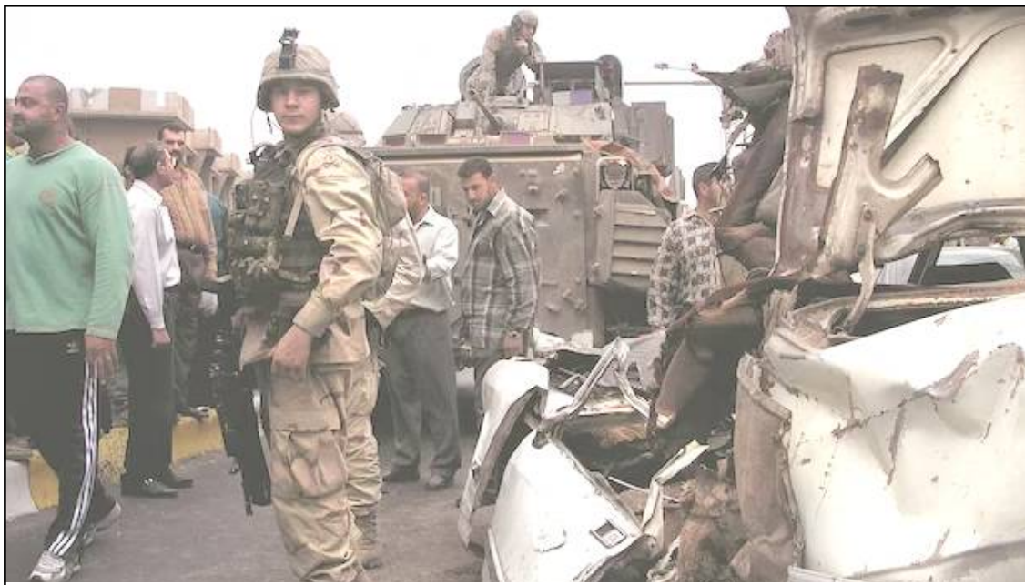
Iraq security forces den senteper Iraq anüolen meita aoba mapang ISIL (ISIS) telungpur 15 tepset.

Washington, Luroi/August 31 (Agencies): United States military-i ashiba agi, Iraq security forces den senteper Iraq anüolen meita aoba mapang ISIL (ISIS) telungpur 15 tepsetogo.