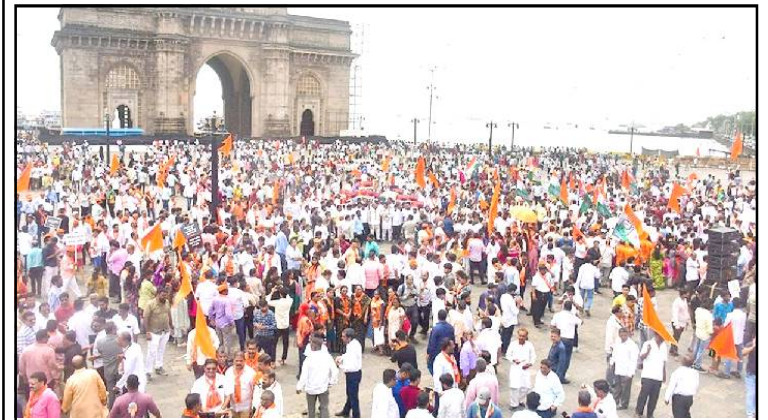
Anogo ishika tejaklen Mumbai nung Chatrapati Shivaji Maharaj indang kürakyanglu chirepba anema September 1 nü Mumbai nung Maha Vikas Aghadi lenirtemi Rajkot Fort nung longkak aitdang tangokba noksa nung angur.

State ajaki tourism sector ajungkettsüsü meranger aser ibaji ajanga linük rongsenkettzung ainba nung shilem agir, ta paisa metetdaksü.