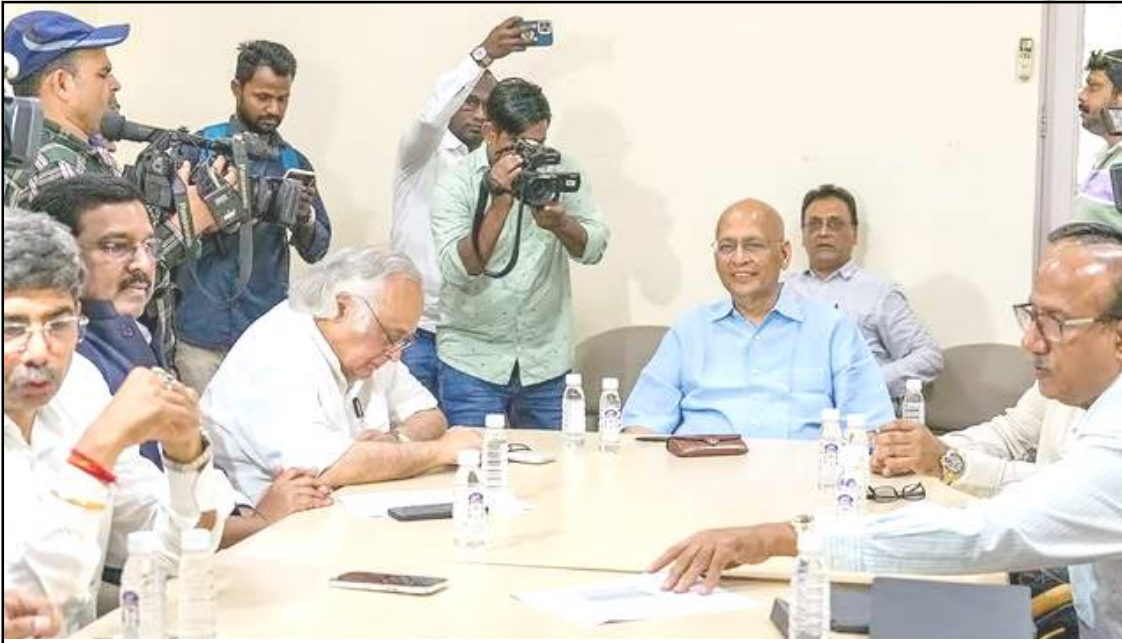
September 01, 2024 nü New Delhi nung Congress lenir, Abhishek Manu Singhvi leniba nung party indang legal department senden amendang tangokba noksa nung angur.