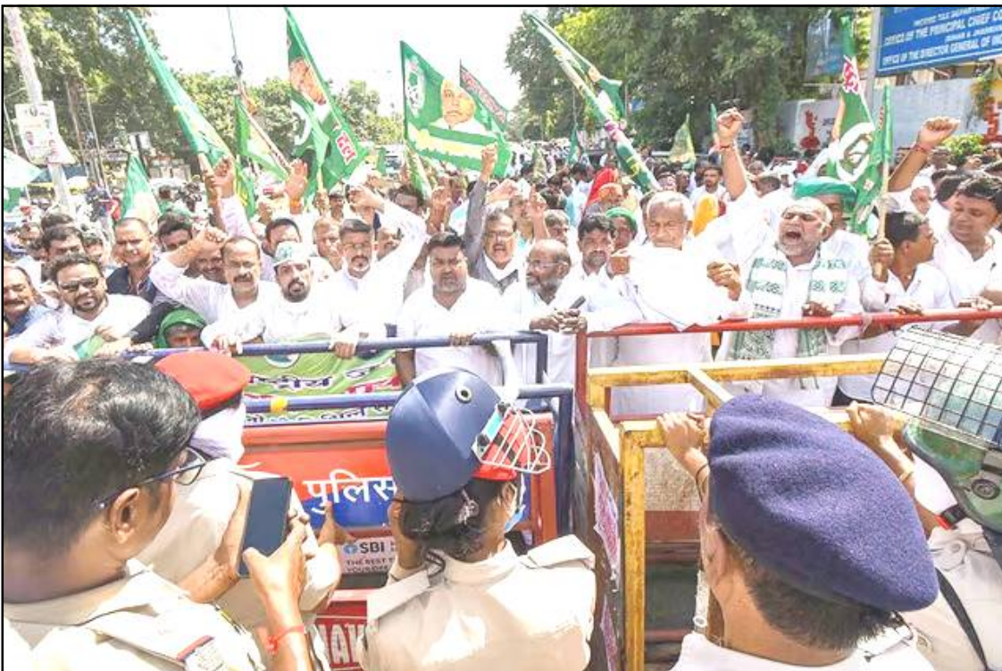
September 02, 2024 nü Patna nung Rashtriya Janta Dal Farmers Cell nungi züngsemtemi longkak aita Raj Bhavan-i aodang police-i nokdanga aliba noksa nung angur.

nisung 276,000 dak tema kongshigo. National Disaster Response Force (NDRF) team 26-i state anaprongla nung tzümettsüng agi kongshiba nüburtem yaridar. Hyderabad nunga aonung piyong tzunglu aruba sülen tesem aika nung tzü metsünga ajanga September 2 nü Hyderabad district nung school ajak sodi sangdonga liasü. Vijayawada nung rong amshia tzümettsüng agi kongshibapurtem nem chiyungtsü den teyari balala lema agütsüdar. Tzümettsüng ajanga Andhra Pradesh-Telangana arrtsü nung kanga tongtibang apu ka raksaba ajanga state ana national highway tesendaktep lenmang raksago. Khammam nungbo sorkari agütsüba teyari agi nübur ket matonger, aser nisung aika building nung jenoker tzü ajema akümtsü atatepdar saka tzümettsüng tensa tamajungba dang akümer. Budameru Vagu ayong densema ayong aika nung tzü tali mobanga yimdar. Budamru Vagu ayong anasa alirtem aika aienshidaksa relief camps nung jenoka lir. Indian Meteorological Department (IMD)-i September 2 nungi September 5 tashi Andhra Pradesh tesem aika nung tzunglu kanga arutsü, ta metetdaksüogo.