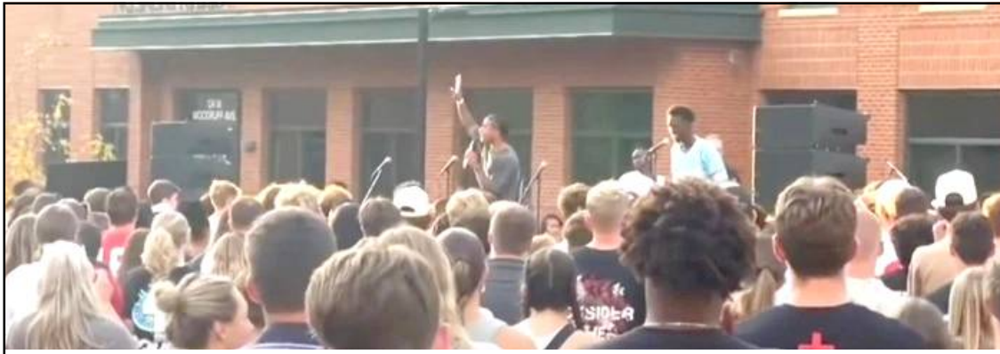
Ohio State University campus nung revival sentong agidang tangokba noksa nung angur.

September 02, 2024: Taoba hopta Ohio State University campus nung tanela asentenshi sentong ka agiba sülen kaketshir aika baptiogo.