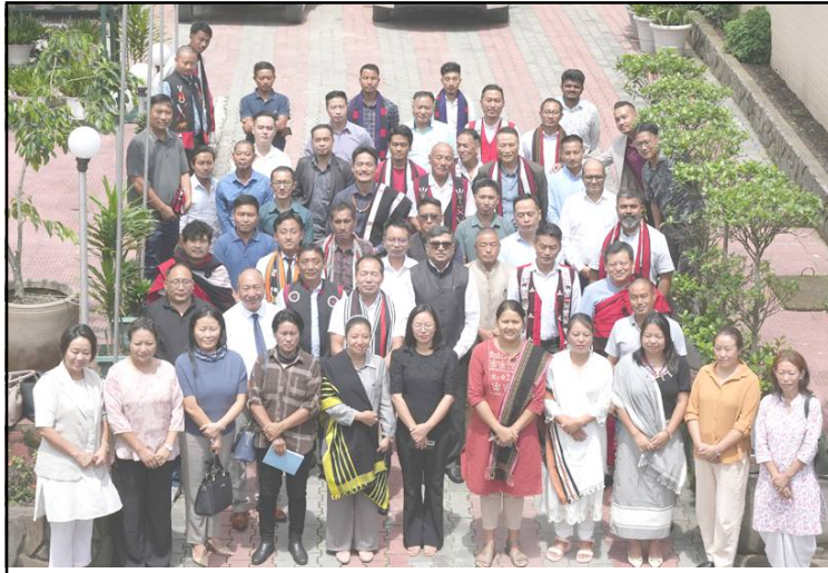
International Centre for Integrated Mountain Development (ICIMOD), Nagaland State Bio-Diversity Board (NSSB) aser Nagaland Community Conserved Areas Forum (NCCAF) ajanga Hotel Japfu, Kohima nung ayongzükba shisadokden senden nung adenertem noksa nung angur.

Kohima, Rongjui/Sept. 03 (TYO): International Centre for Integrated Mountain Development (ICIMOD), Nagaland State Bio-Diversity Board (NSSB) aser Nagaland Community Conserved Areas Forum (NCCAF) lungjemer Hotel Japfu, Kohima nung September 3-4, 2024 anogotem atema shisadokden senden ka ayongzükba lir.