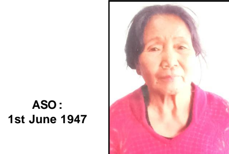
ASO: 1st June 1947