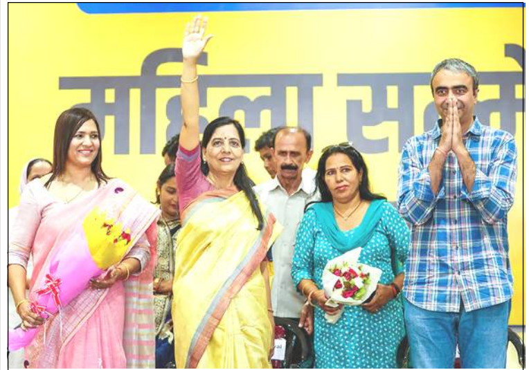
September 07, 2024 nü Bhiwani nung Delhi Chief Minister aser AAP convenor Arvind Kejriwal kinungtsü, Sunita Kejriwal aser AAP lenir, Anurag Dhanda na tetsürtem senden ka nung adenba noksa nung angur.

shisem. Taküm June ita nunga Chad yimtiba nung sepaitem injang rizüngba depot ka nung mi lendong tulu ataloka liasü. Iba lendong nung nisung 9 asü aser nisung 40 dak tema yirua liasü. Alima tesem balala nung lendong atalokba mapang nung India-i linük aika yariogo aser mezüng yarir bendang linüktem rongnung India densema lir. Taküm June ita nunga India-i Haiti nem blood transfusion osettem densema medical teyari balala agüja liasü. Haiti nung züyümkümlen rong ka nung mi adoka nisung 40 asüba sülen India-i medical teyari agütsü. June ita nungsa India-i Papua New Guinea nem teyari balala seret ton 19 agüja liasü. Iba linük nung anentsüh lendong tulu ataloka nisung jenti asüba aser kiojen aika raksaba sülen India-i teyari oset balala agütsü. May ita nunga Kenya nung tzümetsüng lendong tulu atalokba sülen India-i Kenya nem teyari oset balala den medical supplies agüja liasü.