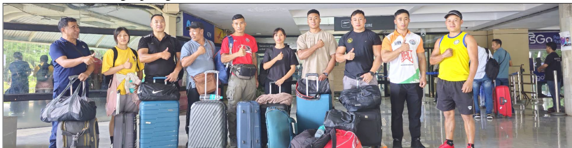
All India Traditional Wrestling & Pankration Federation (AITWPF) kübok Indian Sports contingent nung shilem ka ama Nagaland Wrestling Association (NWA) nungi züngsem ter (10), 5th World Nomad Games 2024 nung Belt & Mas Wrestling discipline kübok Astana, Kazakhstan nung shilem agitsü atema aodang Delhi International Airport nung tangokba noksa nung angur. Parnok ya September 15, 2024 nü Delhi-i meyipa shilangtsü imlar.