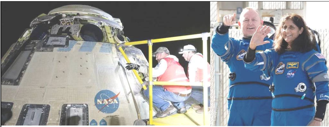
(Abelen) Boeing Starliner spacecraft alimai meyipa shilangba noksa angur. (Achiji) Butch Wilmore aser Sunita Williams. (File photo)

New Mexico, Rongjui/Sept. 07 (Agencies): Boeing indang Starliner spacecraft alimai meyipa shilangba maparen tembangogo, saka yangji mener shilangtsü aliba astronauts tem International Space Station nung lir.