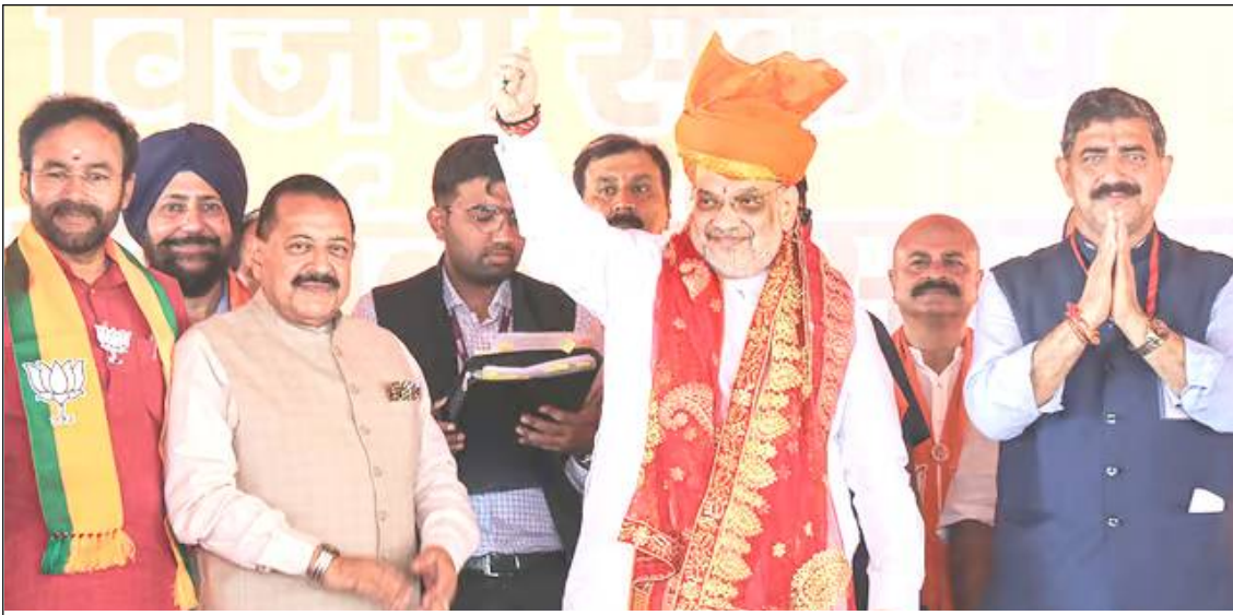
September 07, 2024 nü Jammu nung BJP nung inyakterem senden nung Union Home Minister Amit Shah aser Minister of State, Jitendra Singh na adenba noksa nung angur.