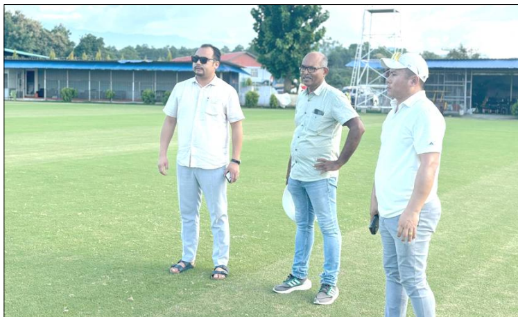
BCCI Chief Curator Ashish Bhowmick-i Nagaland Cricket Stadium semdangba noksa nung angur.

Dimapur, Rongjui/Sept. 07 (TYO): 2019 kum Board of Control for Cricket in India (BCCI) indang Chief Curator ama shimsang Ashish Bhowmick-i Honibarnü Sovima, Chümoukedima nung aliba Nagaland Cricket Stadium semdanga liasü. Nagaland Cricket Association (NCA) ajanga BCCI matches tem ayongzüksü aliba atema asaya moapu yanglushiba asadangsü atema pai iba tesem ya semdanga liasü.