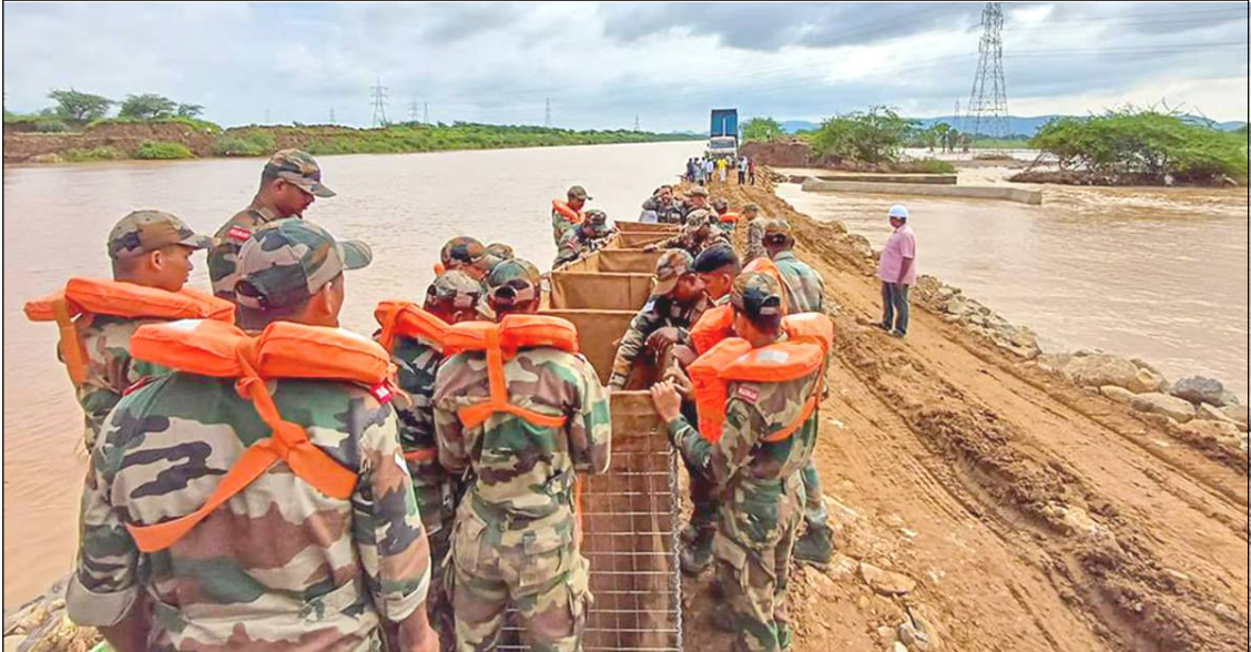
September 07, 2024: Vijayawada nung Indian Army tem aser sorkar ketdangsertem yaritepa tzümetsüng agi kongshiba tesem ka nung mapa inyakdang tangokba noksa nung angur.

Haryana nung October 5 nü election agitsü aser October 8 nü vote azüngtsü. 2019 küm Haryana assembly elections nung single largest party ji Bharatiya Janata Party liasü aser parnoki Jannayak Janta Party aser Independent MLA 7 den lokteper sorkar aküm.