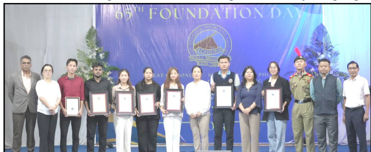
Fazl Ali College, Mokochung indang 65th Foundation Day mapang tesemdanger tongti, Thsuvisie Phoiji, DC Mokochung aser Principal FAC den sempet anguba kaketshirtem külemi tangokba noksa nung angur.

Dimapur, Rongjui/Sept. 07 (TYO): Fazl Ali College Mokochung indang 65 buba Foundation Day nüngtem nung sentong ka September 7, 2024 nü college auditorium nung agia liasü, kong tesemdanger tongti ama Deputy Commissioner, Mokochung, Thsuvisie Phoiji dena liasü. Iba sentong nung academic year 2024 atema alakteta takok tajung ngutetba kaketshirtema tushia liasü.