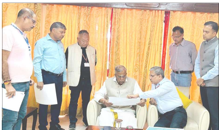
September 7, 2024 nü Chümoukedima nung Nagaland Governor La Ganesan-i NHIDCL Director (Technical), Atul Kumar aser ketdangsurtem den ajurutepeba angur. Iba senden nung Governor Ganesan-i NHIDCL dang tekaratiba nung NH29 nung anentsüh aluba yadoka lenmang lapoktsü aser highway dak sendakba maparen tembangtsü ayongzük.

Parnokisa sorkar college tem nung bus gari aser infrastructure peria maliba den ANCSU Biennial Collegiate Meet 2024 aser Coaching institutes onüktem lemsatopa liasü.