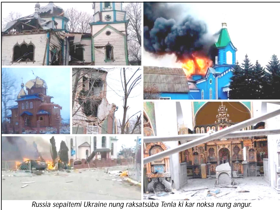
Russia sepaitemi Ukraine nung raksatsüba Tenla ki kar noksa nung angur.

September 06, 2024: Taoba mapang Soviet Union nung aliba linük balala nung Khrista osangtajung prokba ministry-i, European & Asian Christian ministry-i, Russia nunger sepaitemi Ukraine tesem ajaklen yimsü temeden anema inyaker, aser 2022 küm nungi tenzüka tang tashi nung sepaitemi Ukraine nung Tenla ki 600 shi raksatsüogo, ta metetdaksü.